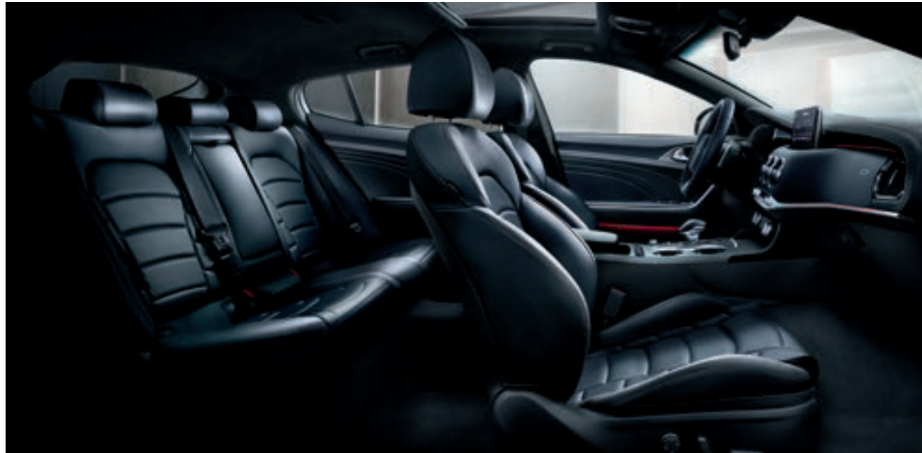
Nappa Leather Seat Trim*