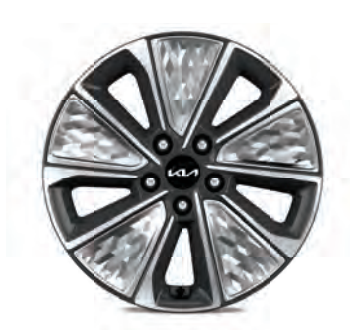
17" alloy wheels