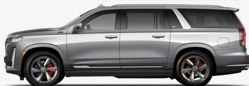
OPTIONAL SPORT SUSPENSION LOWERING KIT