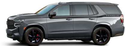
BLACK ON STERLING GRAY METALLIC