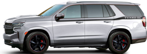
OPTIONAL SPORT SUSPENSION LOWERING KIT