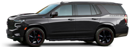
SILVER ON DARK ASH METALLIC