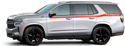
HUGGER ORANGE ON SUMMIT WHITE