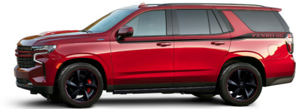
BLACK ON RADIANT RED METALLIC

YENKO/SC ® side stripe graphics are made from OE-quality vinyl that is UV resistant that will not fade, crack, or peel. Available in a variety of colors to compliment all factory body colors