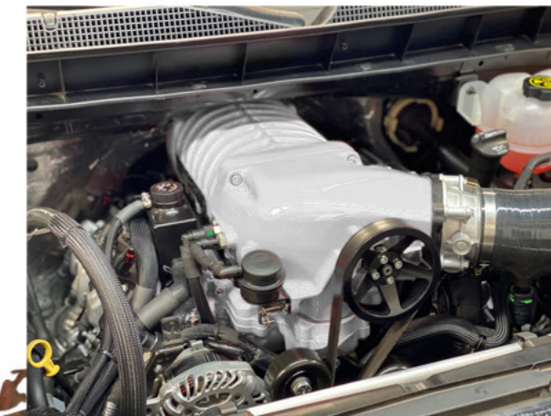
SUPERCHARGER COMES STANDARD IN BLACK. CUSTOM COLORS OPTIONAL. SHOWN IN BODY COLOR PAINT.

SPECIALTY VEHICLE ENGINEERING INTRODUCES THE NEW FOR 2023 700HP (5.3L) AND 800HP (6.2L) YENKO/SC® TAHOE AND SUBURBAN. AVAILABLE ON 2023 2WD OR 4WD LS, LT, RST, Z71, PREMIER, AND HIGH COUNTRY MODELS. AVAILABLE ONLY FROM GM DEALERS NATIONWIDE.