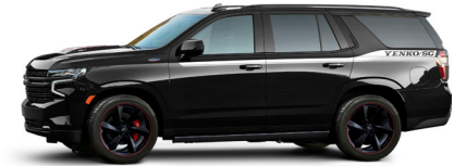
WHITE ON BLACK