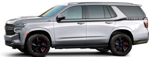
FACTORY RIDE HEIGHT

YENKO® badged Brembo 6-piston big front brake calipers in red (custom colors optional) with 16.1" Vented Rotors (GM dealer supplied)