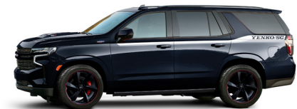
WHITE ON MIDNIGHT BLUE METALLIC