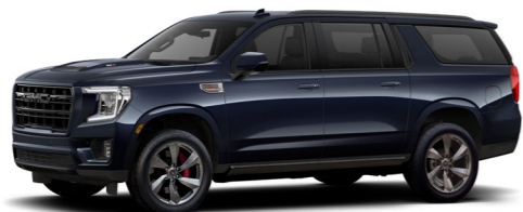
FACTORY RIDE HEIGHT

Brembo 6-piston big front brake calipers in red (custom colors optional) with 16.1" Vented Rotors (GMC dealer supplied)