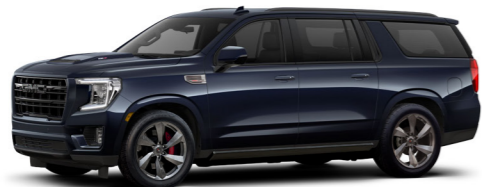
OPTIONAL SPORT SUSPENSION LOWERING KIT