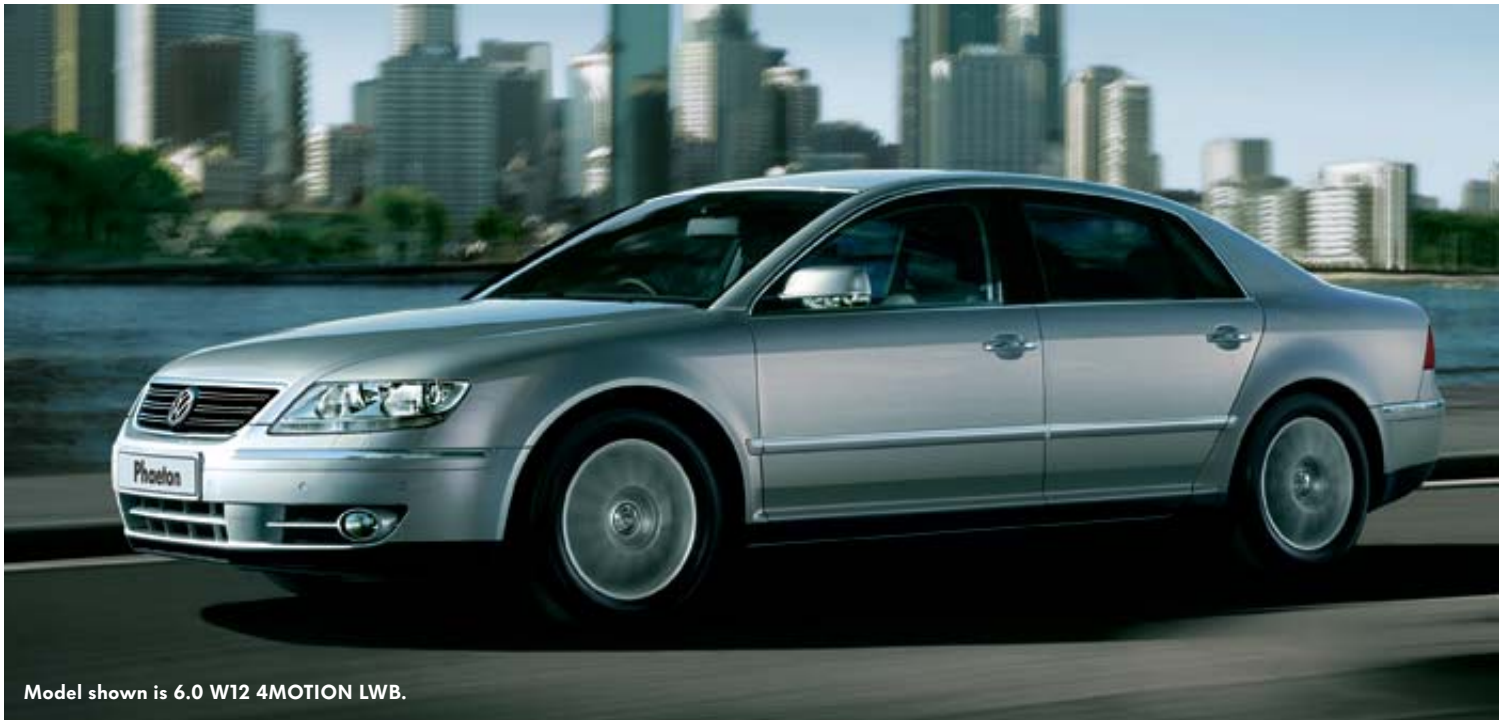
Model shown is 6.0 W12 4MOTION LWB.

The above specifications are for information purposes only as our products are continually updated and changes may be made to the specifications at any time. If you require any specific feature, you must consult your authorised Volkswagen luxury car specialist retailer who is regularly updated with any change in specification. Specifications are subject to change without notice.