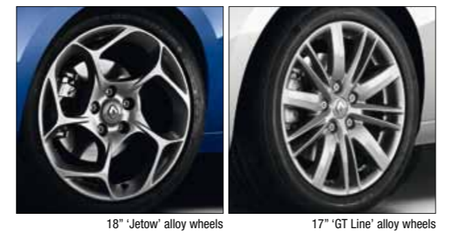
18" 'Jetow' alloy wheels 17" 'GT Line' alloy wheels