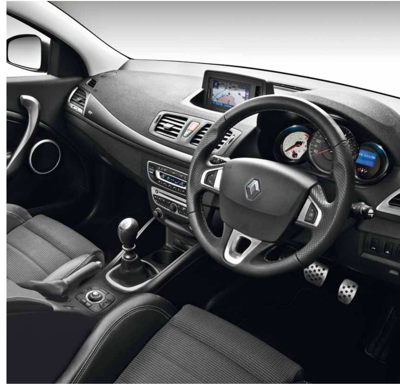
Image shown is GT version and includes optional Carminat TomTom® with joystick control and optional Dual Zone climate control.