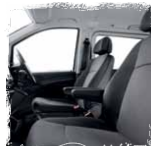
Comfort seats (Vito Sport)