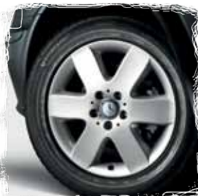
17" 6 spoke alloy wheels (Vito Sport)