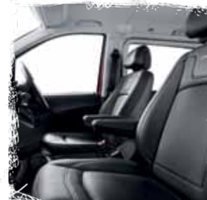
Leather seats with contrast stitching (Sport-X)