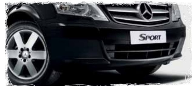
Colour coded bumper (Vito Sport)