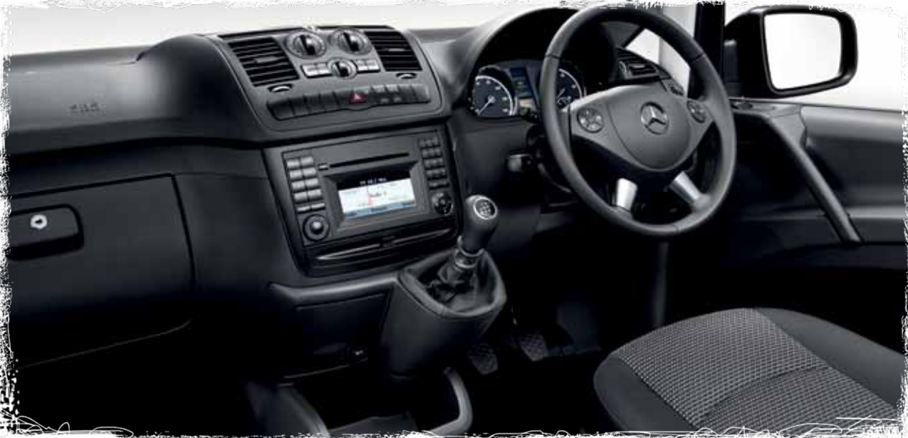
Vito Sport interior