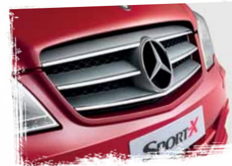
Aggressive BRABUS-designed chrome front spoiler as featured on Sport-X.

They've got all the cool extras you have come to expect including alloy wheels (Brabus versions on the Sport-X) and chrome detailing. So read on and find out what makes them the ultimate kit carrying transport.