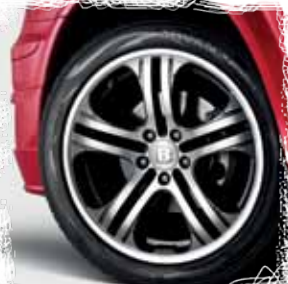
All new BRABUS 18" alloy wheels (Sport-X)