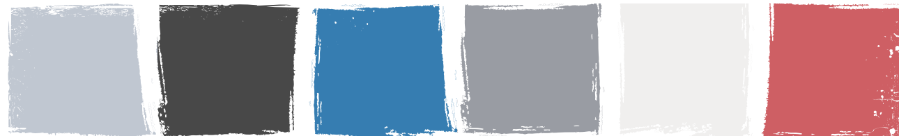
Brilliant Silver Metallic Obsidian Black Metallic Jasper Blue Metallic Flint Grey Metallic Arctic White Magma Red

Both the Vito Sport and Sport-X are now available in the following choice of paint colours.