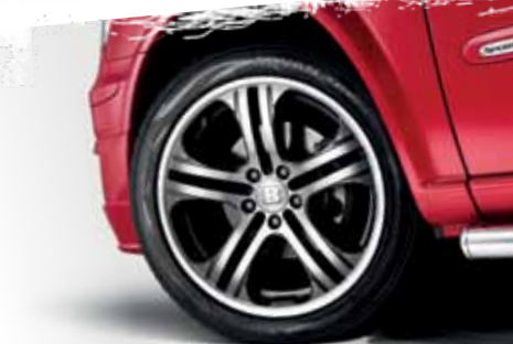
Sport-X includes stylish 18" BRABUS alloys.