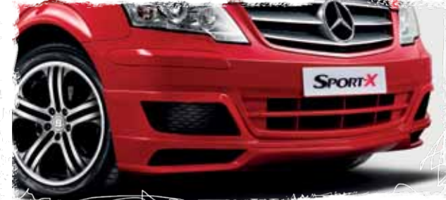
All new custom designed BRABUS front spoiler (Sport-X)