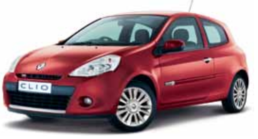
• 15" 'Del Arte' alloy wheels See Page 24

• ALLOY WHEELS • FRONT FOG LIGHTS • AIR CONDITIONING • BLUETOOTH • MP3 CONNECTIVITY