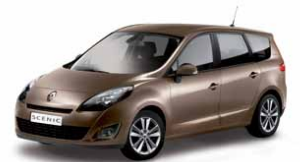
17" 'Sari' alloy wheels Multi-functional TunePoint See Page 40