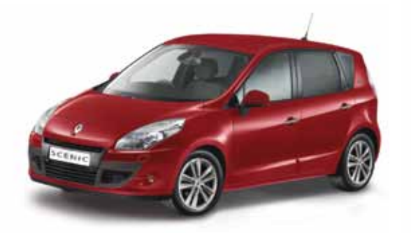
17" 'Sari' alloy wheels Multi-functional TunePoint See Page 40

17" 'Sari' alloy wheels Multi-functional TunePoint See Page 34