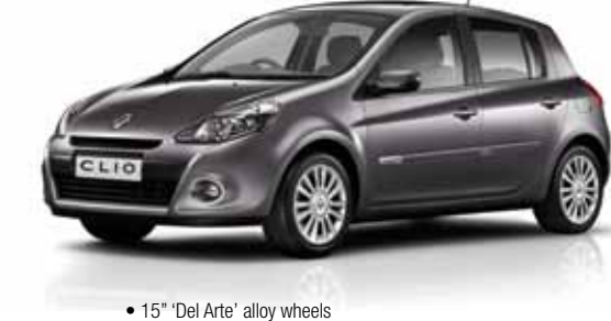
See Page 24