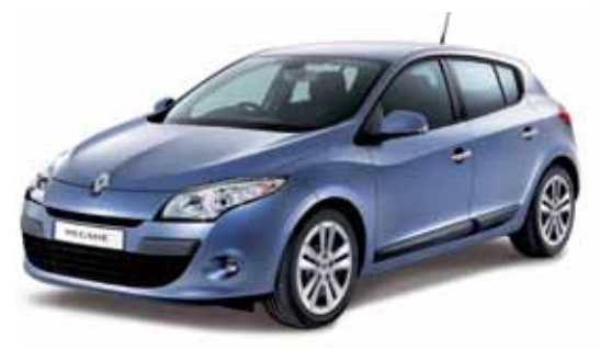
17" 'Sari' alloy wheels Multi-functional TunePoint See Page 32