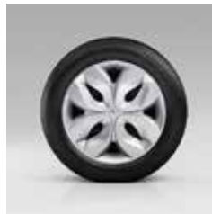
Aerobase 15" wheel trims