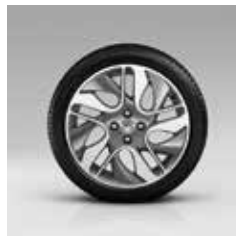
Tech Run 17" alloy wheels*