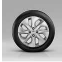
Aerotronic 16" alloy wheels