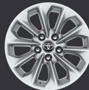
16" alloy wheels

Standard on Icon and Icon Tech Hatchback and Touring Sport