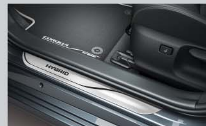
Aluminium scuff plates