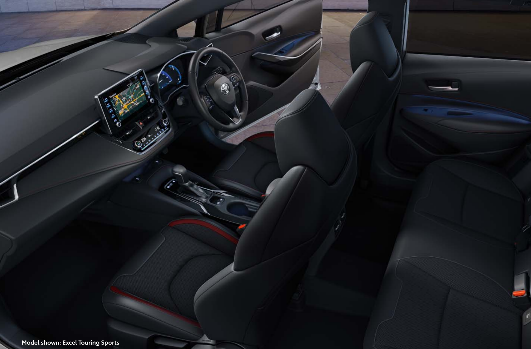
Model shown: Excel Touring Sports