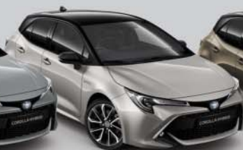
2RD Sterling Silver*/ Eclipse Black