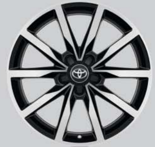
18" machined-face black alloy wheels Optional on Excel grade