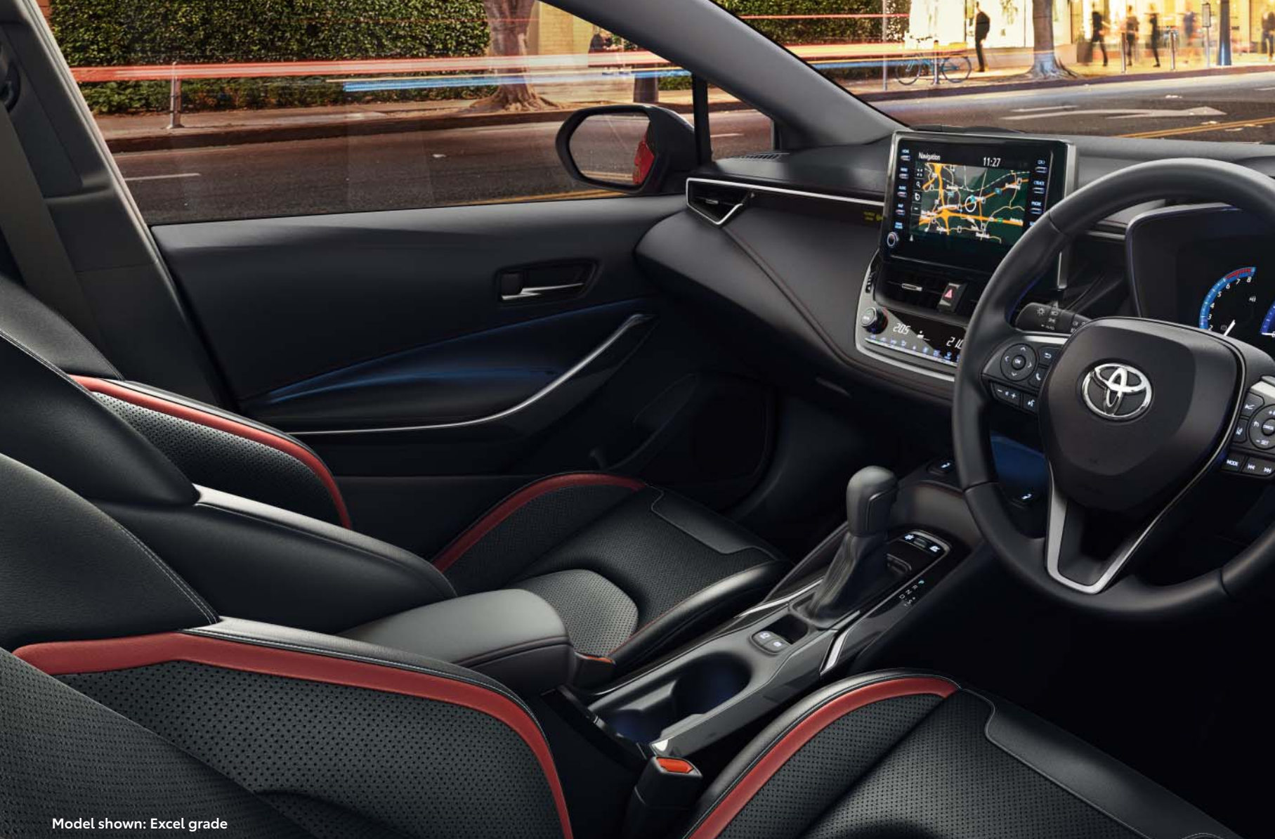
Model shown: Excel grade