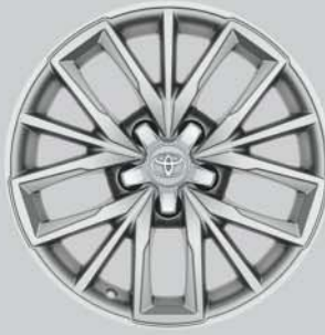
17" silver alloy wheels Optional on Design grade