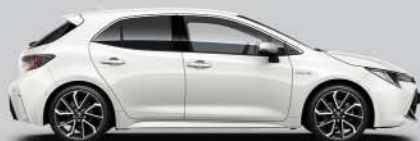
040 Pure White