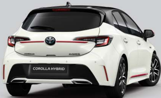
Red lower door trim and tailgate trim