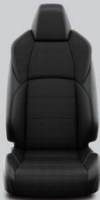
Black fabric with synthetic leather Standard on Design Hatchback and Touring Sports