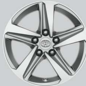
16" silver alloy wheels Optional on Icon and Icon Tech grade