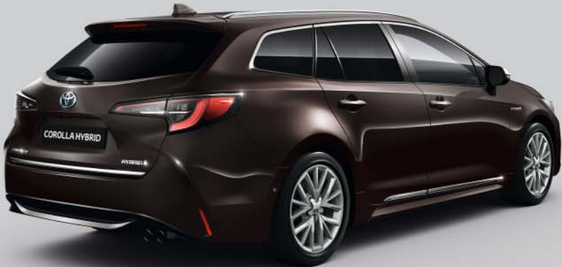
Chrome rear boot door trim