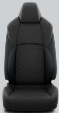
Black quilted fabric, grey stitching Standard on Icon and Icon Tech Hatchback and Touring Sports