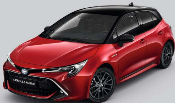
Black front bumper trim and black lower door trim