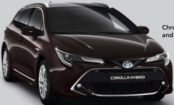
Chrome front bumper trim and chrome lower door trim