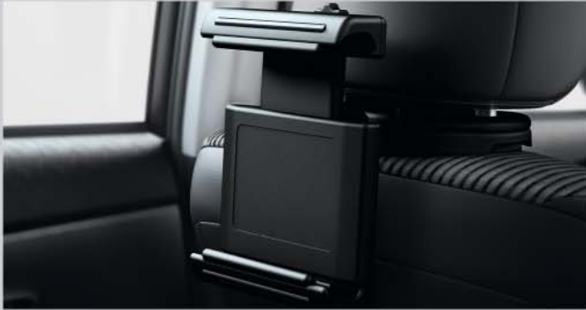
Universal tablet holder with docking station Available on all grades for all body types.