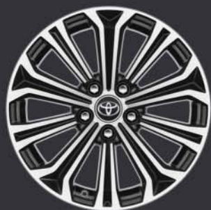
17" machined-face alloy wheels

Standard on Design Saloon and Excel 1.8 Touring Sport