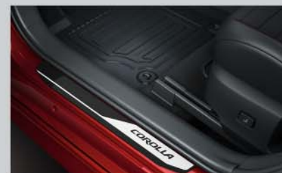
Rubber floor mats and aluminium scuff plates