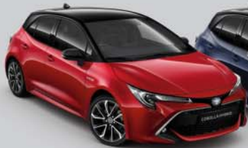
2SZ Scarlet Flare* / Eclipse Black