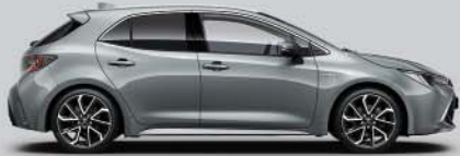
1H5 Manhattan Grey §