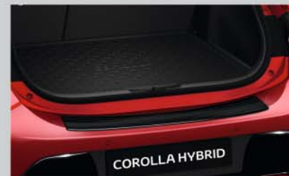
Rear bumper protection plate (black plastic)

Applicable to all grades for both Hatchback and Touring Sports body type, not available for Corolla TREK and GR SPORT