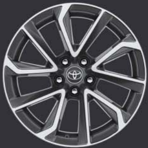
18" machined-face alloy wheels Standard on Excel Hatchback and 2.0 Touring Sport