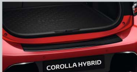
Rear bumper protection plate