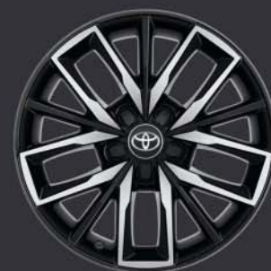
17" machined-face alloy wheels

Standard on GR SPORT Hatchback and Touring Sport 2.0