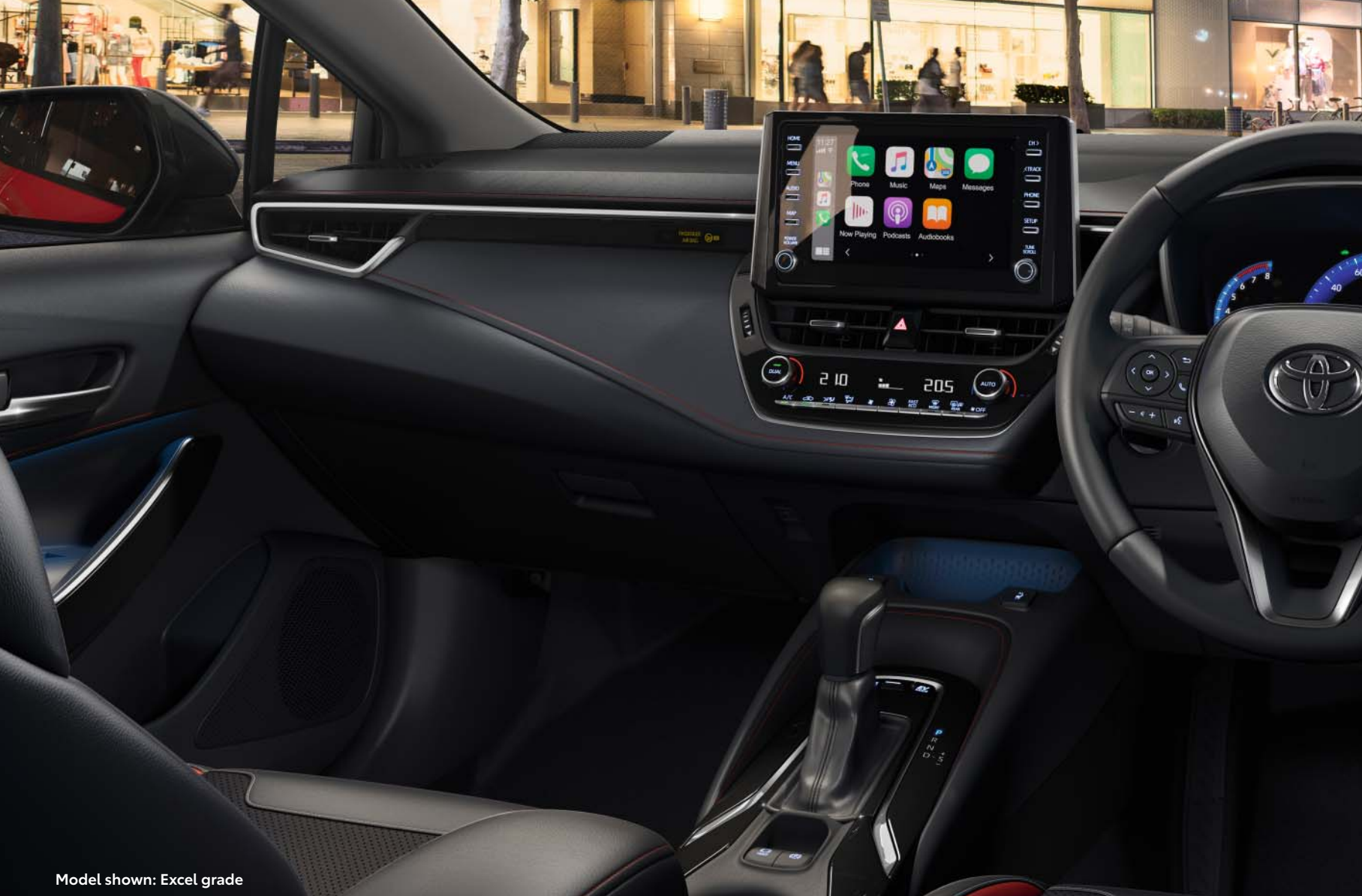
Model shown: Excel grade