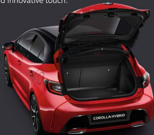
Boot liner and front and rear mudflaps

Genuine Toyota accessories are designed with the same care and attention to quality and detail as your new Corolla. They will help to give you the opportunity to add your own stylish, practical and innovative touch.