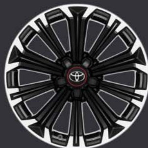
17" machined-face alloy wheels

Standard on Design Saloon and Excel 1.8 Touring Sport