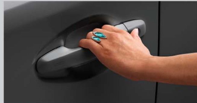
Door handle protection film Protect your door handle paint against scratches caused by rings or other jewellery worn by you and your passengers. Available on all grades for all body types.