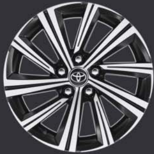
17" machined-face alloy wheels Standard on Design Hatchback and Touring Sport

Make your Corolla stand out from the crowd even more by enhancing its exterior look further using these sets of alloy wheels. Alloy wheel options are available for Hatchback and Touring Sports only.