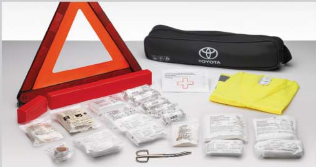
European safety kit Available on all grades for all body types.