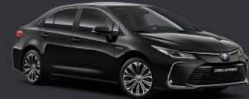
209 Eclipse Black §