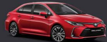
3U5 Scarlet Flare*