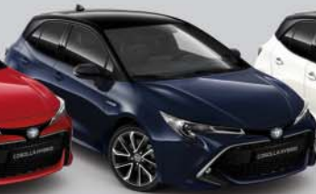
2UQ Obsidian Blue § / Eclipse Black