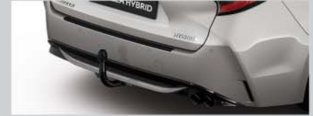
Vertical detachable towing hitch

For Saloon, this pack can only be purchased with horizontal detachable towing hitch with 13-pin electrics. Available for all grades.