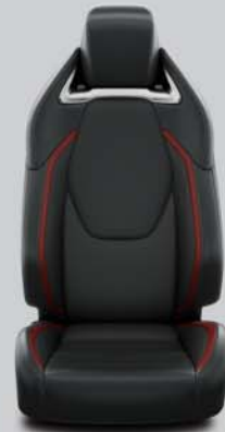
Black leather sport seat with red accents Standard on Excel Hatchback and Touring Sports