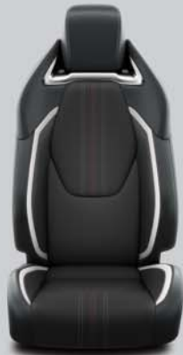
Black fabric with partial leather seats Standard on GR SPORT