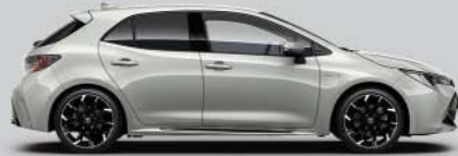
1K6 Ash Grey §