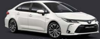
040 Pure White