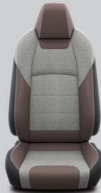
Brown and grey fabric with grey stitching Standard on TREK