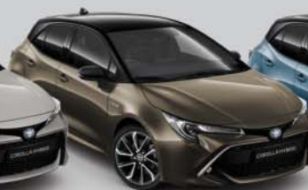
2RF Titan Bronze § / Eclipse Black**