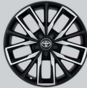
17" machined-face black alloy wheels Optional on Design grade