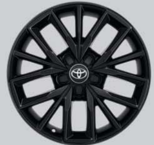
17" gloss black alloy wheels Optional on Design grade