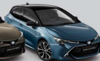
2RG Denim Blue § / Eclipse Black**