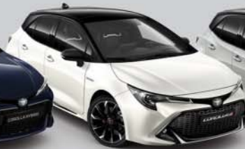
2NR Pure White § / Eclipse Black