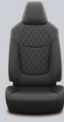
Diamond quilted black fabric Available on all Saloon grades