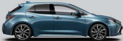
8U6 Denim Blue §**