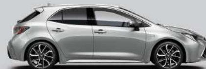
1F7 Tyrol Silver §