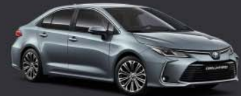
1K3 Satin Grey §