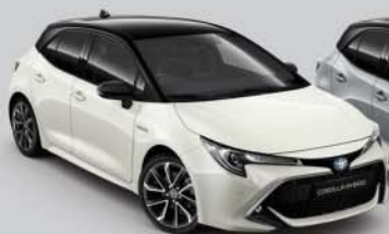
2KR White Pearl*/ Eclipse Black