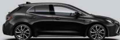
209 Eclipse Black §