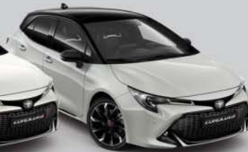
2RZ Ash Grey § / Eclipse Black