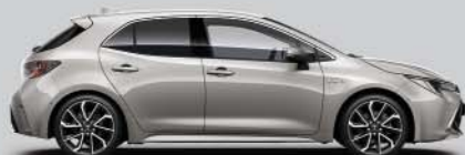
1J6 Sterling Silver*