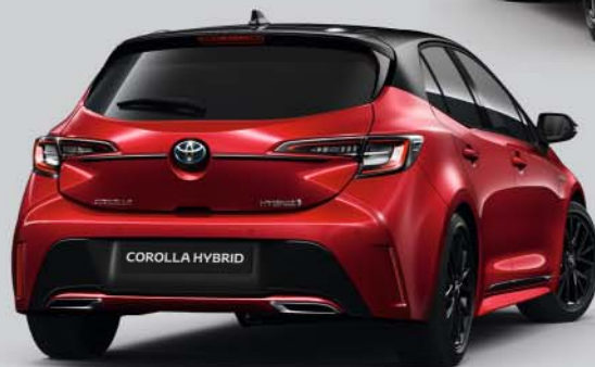
Black lower door trim and tailgate trim