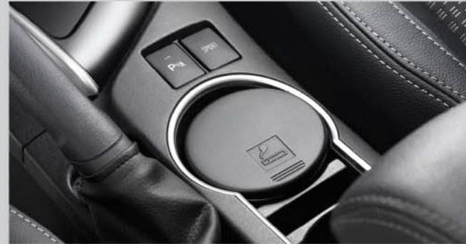
Removable console storage can Available on all grades for all body types.