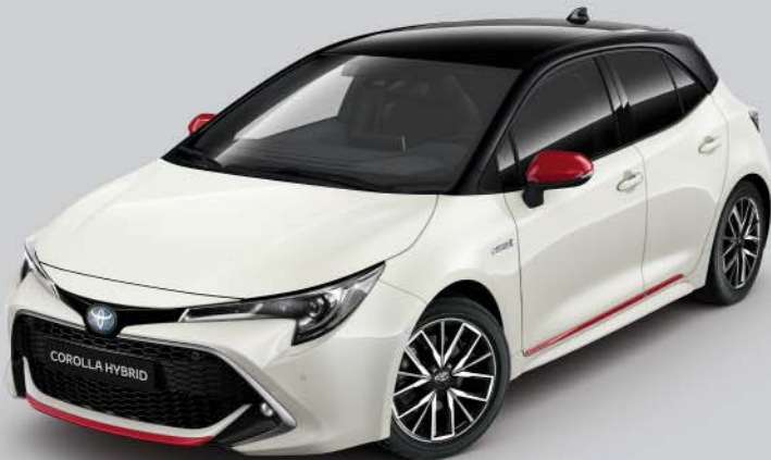
Red front bumper trim and red lower door trim