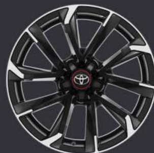
18" machined-face alloy wheels

Standard on GR SPORT Hatchback and Touring Sport 2.0