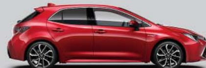
3U5 Scarlet Flare*