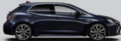
8X8 Obsidian Blue §