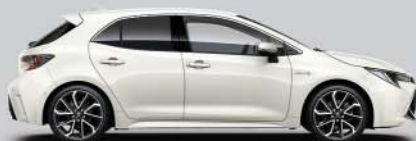
070 White Pearl*