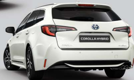
Black lower door trim and tailgate trim