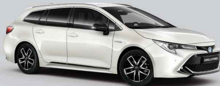
Black front bumper trim and black lower door trim

Colour-matching red and black wing mirror covers are not part of the Style Pack, however they can be purchased separately.