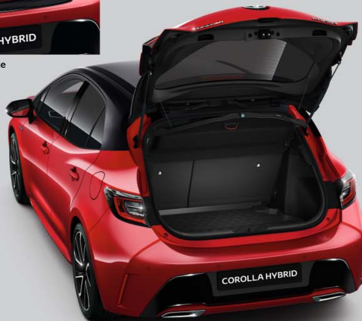
Boot liner and front &amp; rear mudflaps

Applicable to all grades for both Hatchback and Touring Sports body type, Corolla TREK and Corolla GR SPORT.