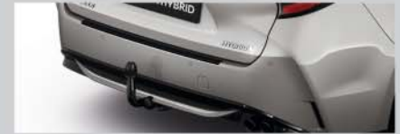
Horizontal detachable towing hitch

Horizontal towing hitch is not applicable to Corolla TREK, Corolla GR SPORT and 2.0 Hybrid.