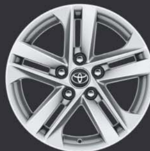
16" alloy wheels

Standard on Icon and Icon Tech Hatchback and Touring Sport