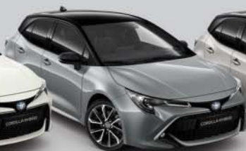
2QS Manhattan Grey § / Eclipse Black