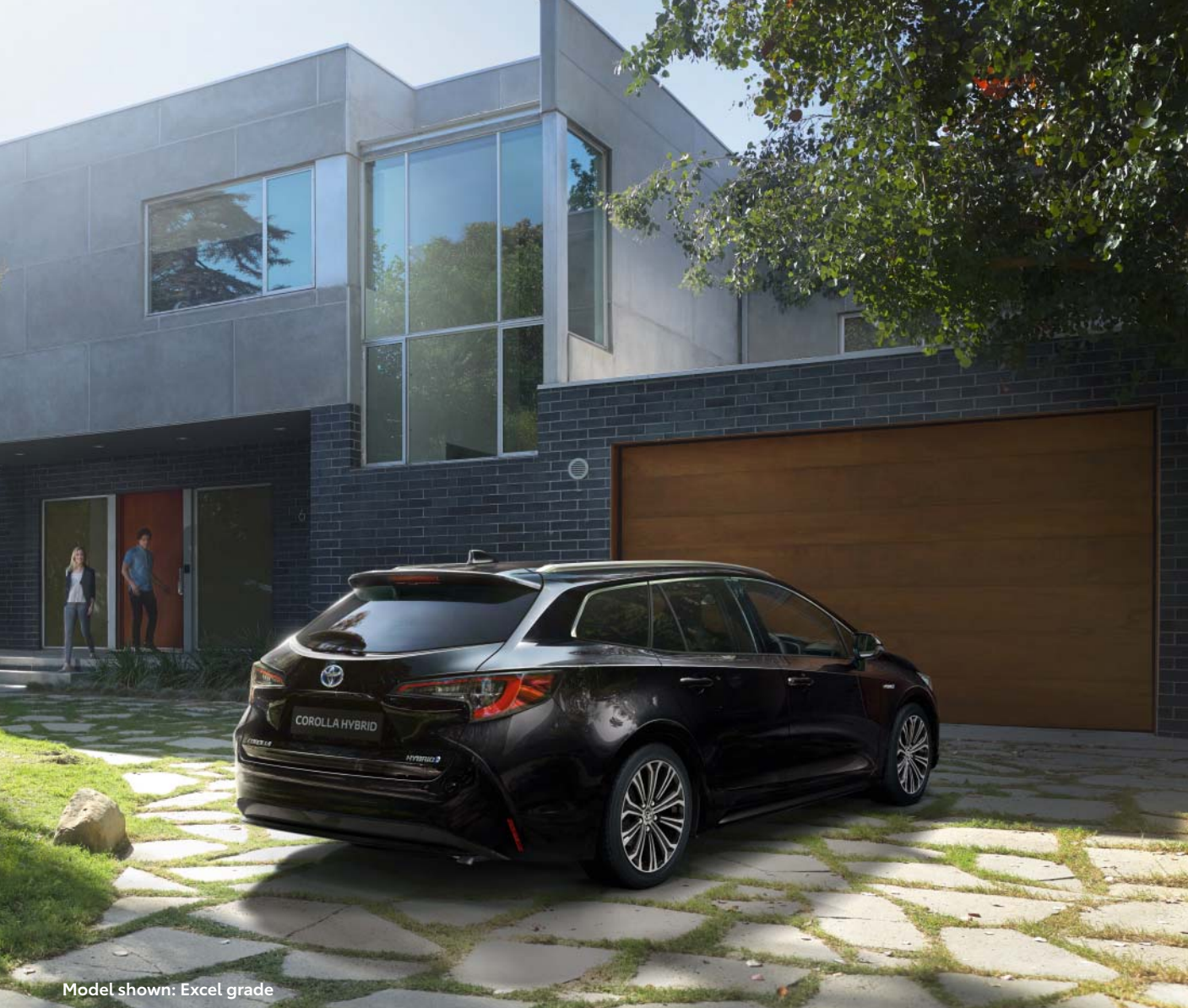
Model shown: Excel grade