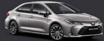
1K0 Metal Stream §