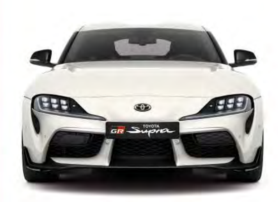
A96 White Metallic*