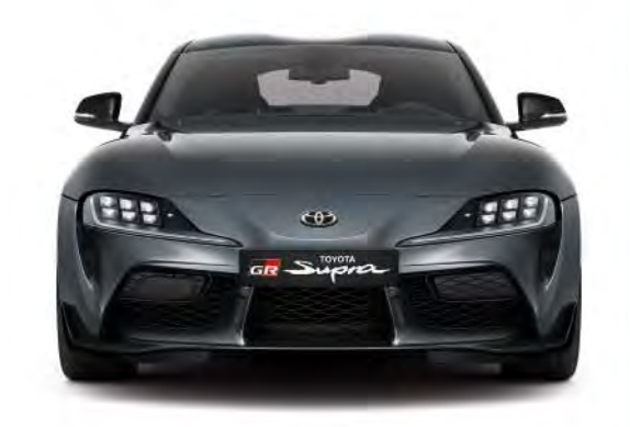
C2Y Ice Grey Metallic*

The Toyota GR Supra's "Condensed Extreme" design will turn heads whichever colour you choose. With a choice of six exterior finishes, from the striking Prominence Red to the powerful-looking Ice Grey metallic, your look is sure to impress.