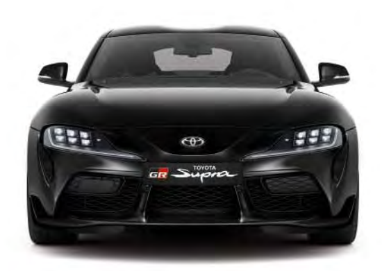
475 Black Metallic*