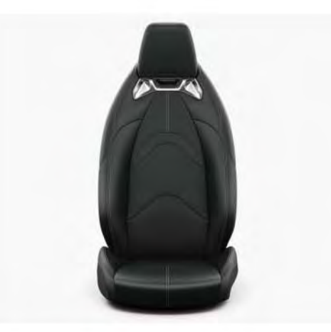
Black leather Standard on 3.0 Pro