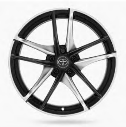
19" Black & Silver Forged alloy wheels (5-double-spoke) Standard on 3.0 Pro