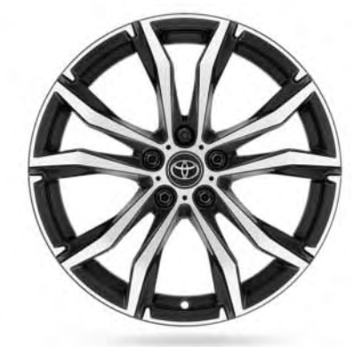
18" Black & Silver Machined-face alloy wheels (5-double-spoke) Standard on 2.0 Pro