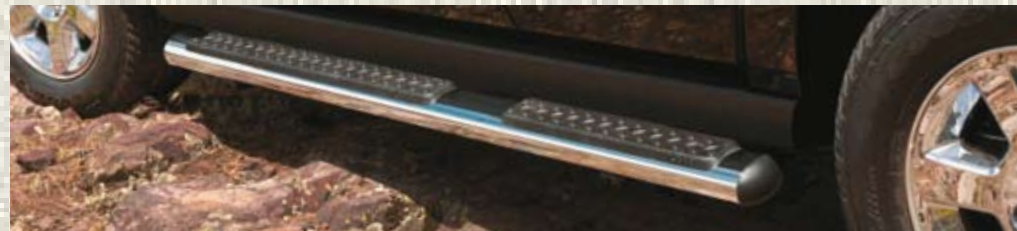
Chrome Tubular Side Steps feature 4-inch oval chromed aluminium, with textured stepping surfaces that match rear bumper tread pattern. Step pads feature Jeep logo and mount securely with corrosion-resistant, ElectroCoated steel mounting brackets. No drilling required. (Also available in Black.)

Even though your Commander isn't afraid to get down and dirty, you still have a refined side that deserves expression. The Chrome Accent Package adds distinctive touches that not only protect, but also enhance an already commanding vehicle. Now you'll look good whether you're on the road or off — and that's a very tough act to follow.