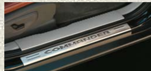
Door Entry Guards protect interior door sills from scratches while adding a nice touch of style. Brushed stainless steel plates feature embossed Commander name on Front Guards. Set of four.

Includes accessories not part of the Chrome Accent Package →