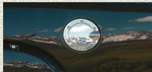
Chrome Fuel Filler Door features a special bolt pattern that complements the fender flare patterns on Commander Limited, as well as the shift knob and steering wheel trim levels. Replaces existing fuel filler door.