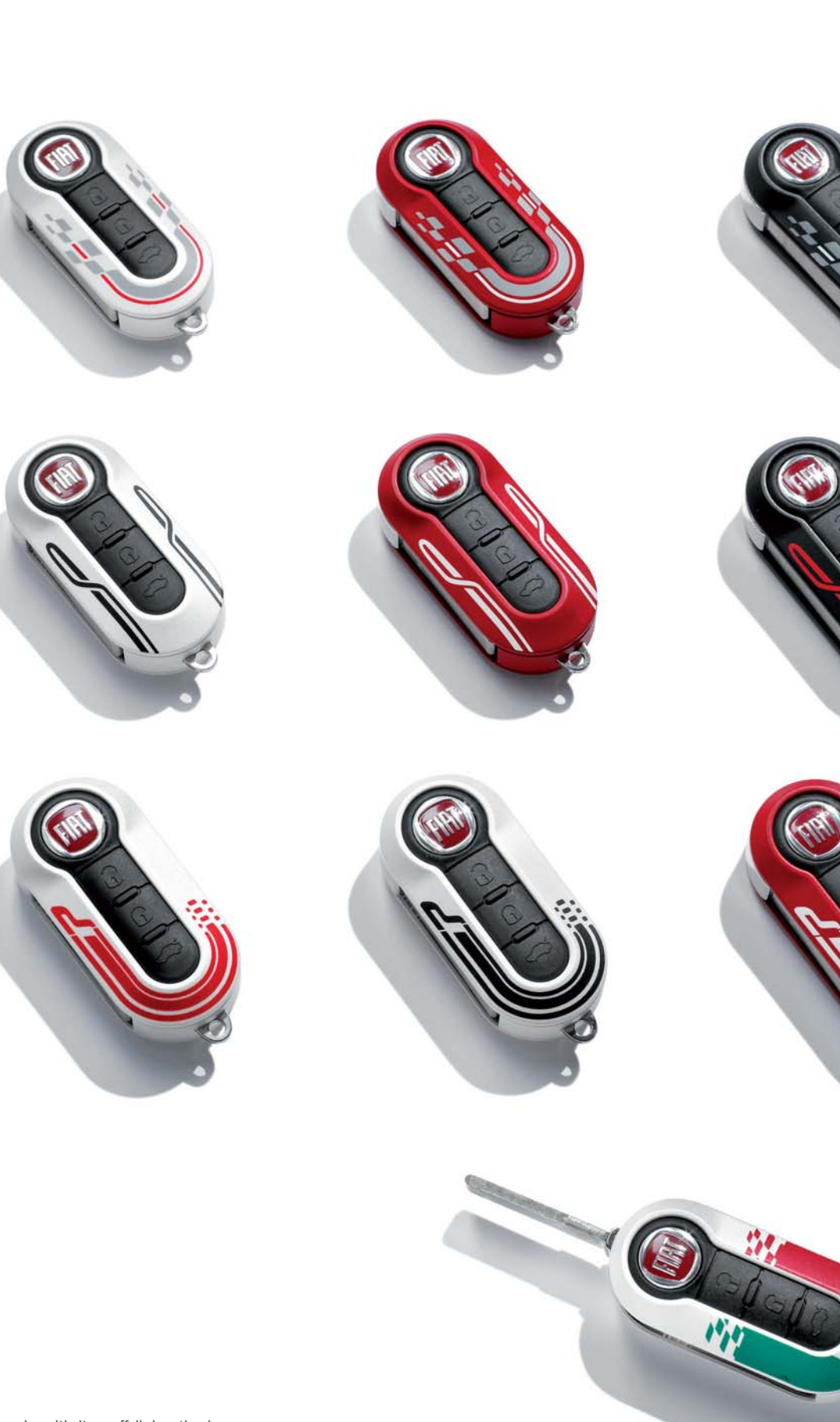
Like a tuxedo with its cuff-links, the key covers coordinated with the external stickers imbue the Grande Punto with a touch of class.