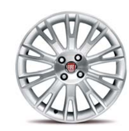
17" DOUBLE CORK ALLOY WHEELS with 205/45 R 17" tyres Chrome Shadow colour (opt. 434)