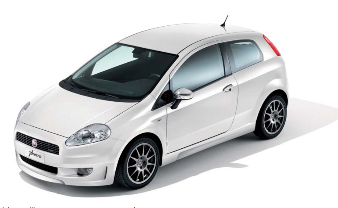
'Would you like an even more aggressive Grande Punto? Then choose the new sporting kit which includes front and rear dam, sideskirts and rear spoiler'.