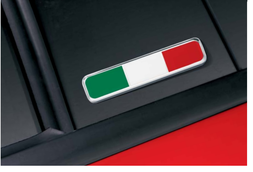
The aluminium 'Italian Flag' badge is the touch that can make the difference: it stands out on the pillar of the vehicle, thanks to enamelled gems that make it sparkle and shine.