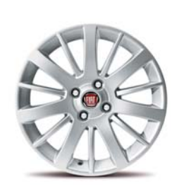
16" HALFPIPE ALLOY WHEELS with 195/55 R 16" tyres▲ Aluminium colour (opt. 431)