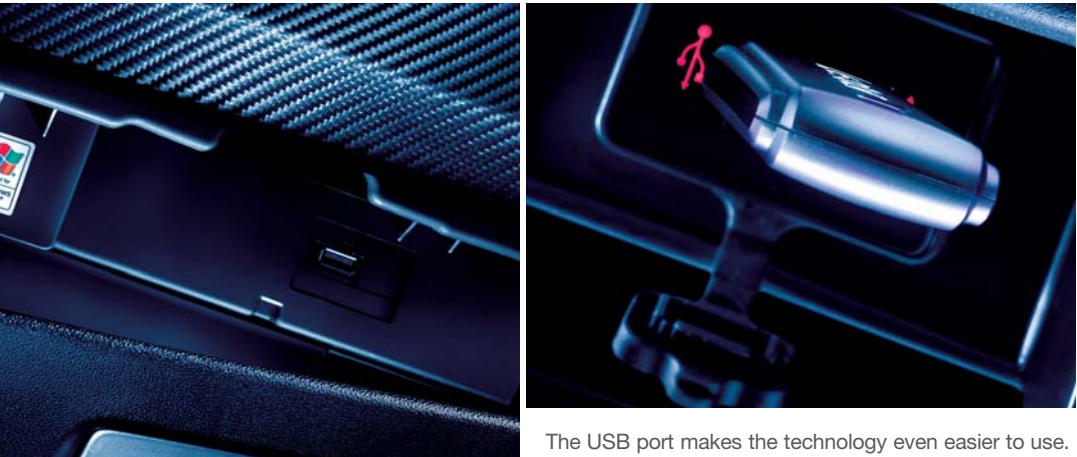
The USB port makes the technology even easier to us Located in the glove compartment, it allows you to constantly update your playlists, to insert preloaded navigation maps and all the information you need.