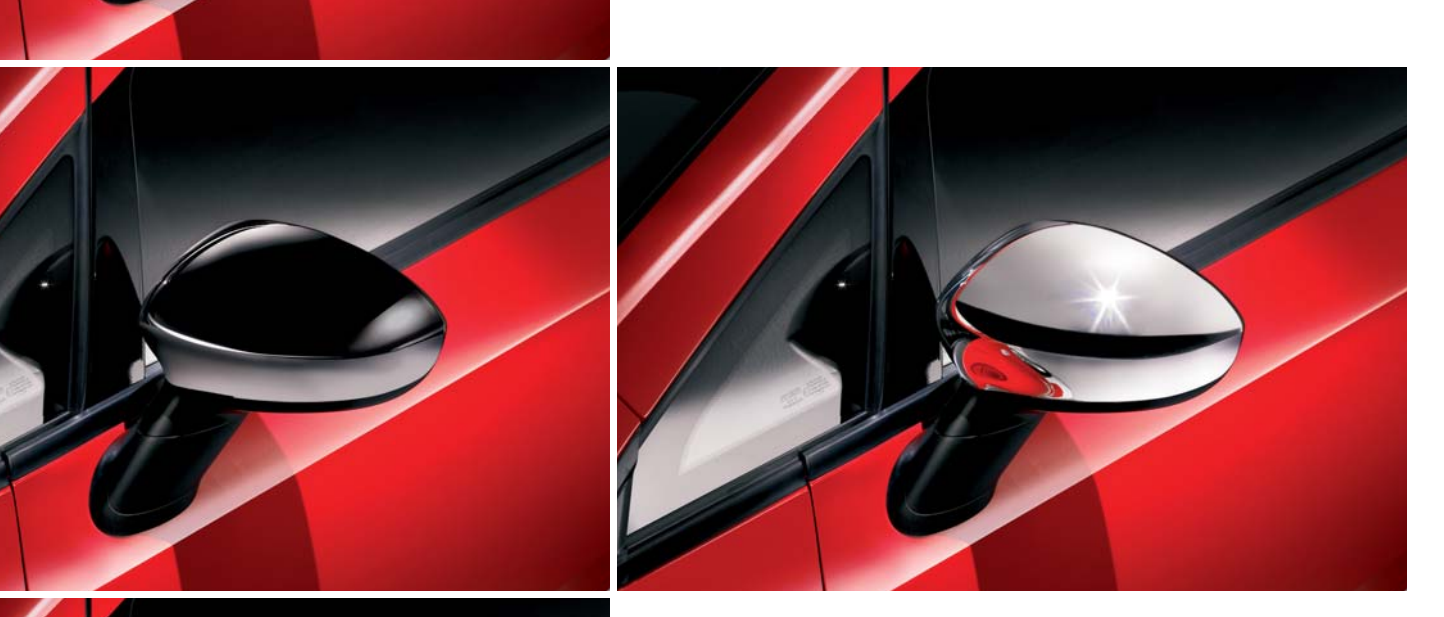
The customised covers of the wing mirrors, in 4 colours, further enhance the customisation of your Grande Punto.