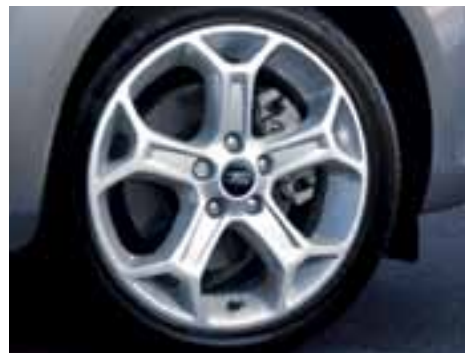
Standard Zetec 17" alloy wheels

Precision driving. It's what you'll experience each and every time you get behind the wheel of the Mondeo. It means that whether you're heading out of the city for a weekend or simply powering through traffic on your way to the office, the responsive engine, precision ride and smooth handling will make every drive a pleasure. In fact, everything that makes a journey as effortless and comfortable as possible has been considered, from the superior European build quality right through to the room and comfort inside the spacious cabin. And because everyone's driving needs are different there is a choice of petrol and diesel engines across the Mondeo range.