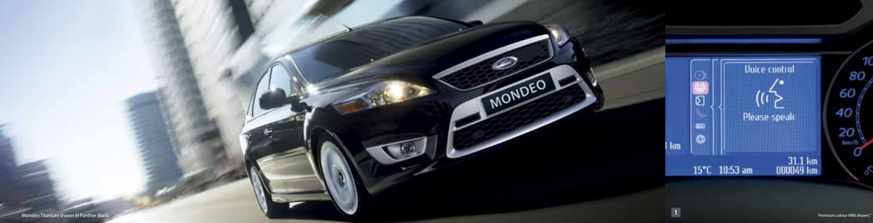
Mondeo Titanium shown in Panther Black.