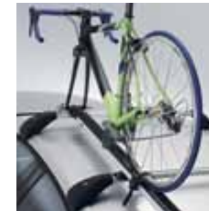
Carry bars and bike carrier (sold separately) for easy transport of bikes of all sizes.