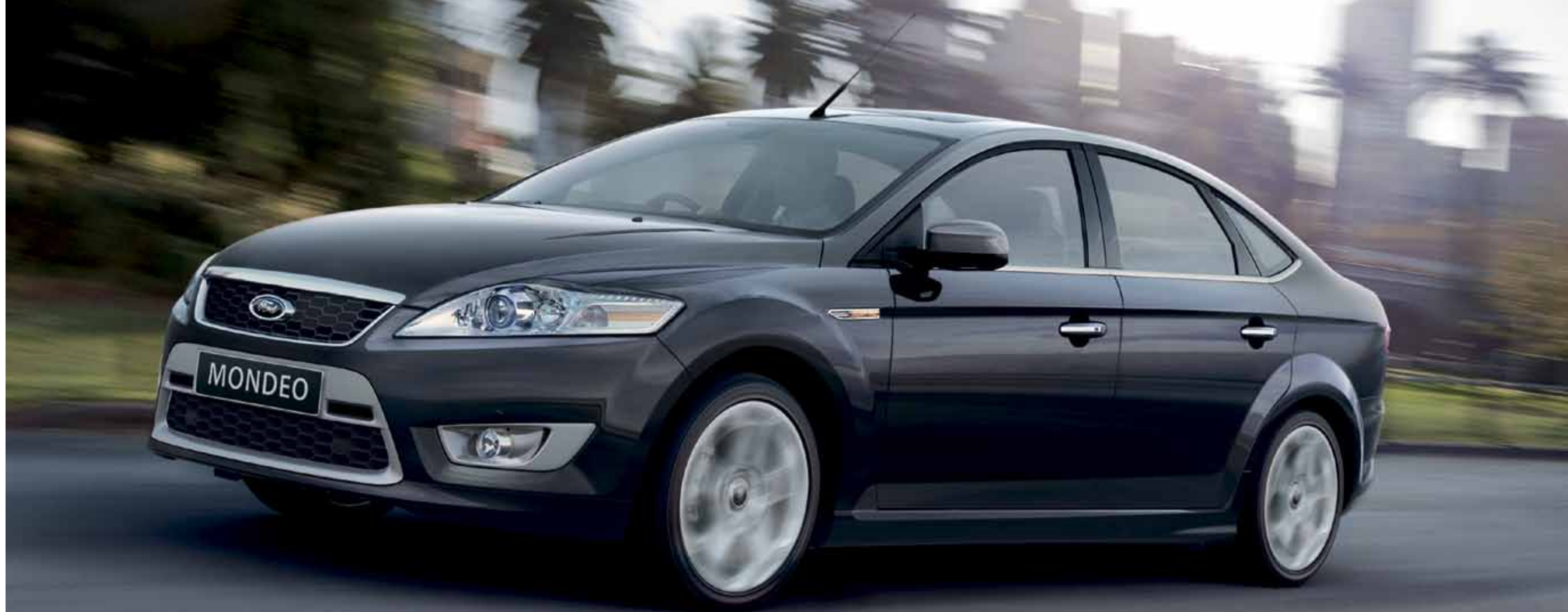
Mondeo Titanium shown in Sea Grey.

Some designs are blessed with a unique talent to stand out from the pack. Like the Ford Mondeo. With genuinely striking looks, the Mondeo displays real visual energy on the road and has an eye-catching presence in the car park. The Mondeo's appeal lies in its immediate visual impact, the sleek exterior styling cues and the unmistakable sense that all the proportions and details feel just right. The impressive Mondeo range includes both hatch and wagon body styles.