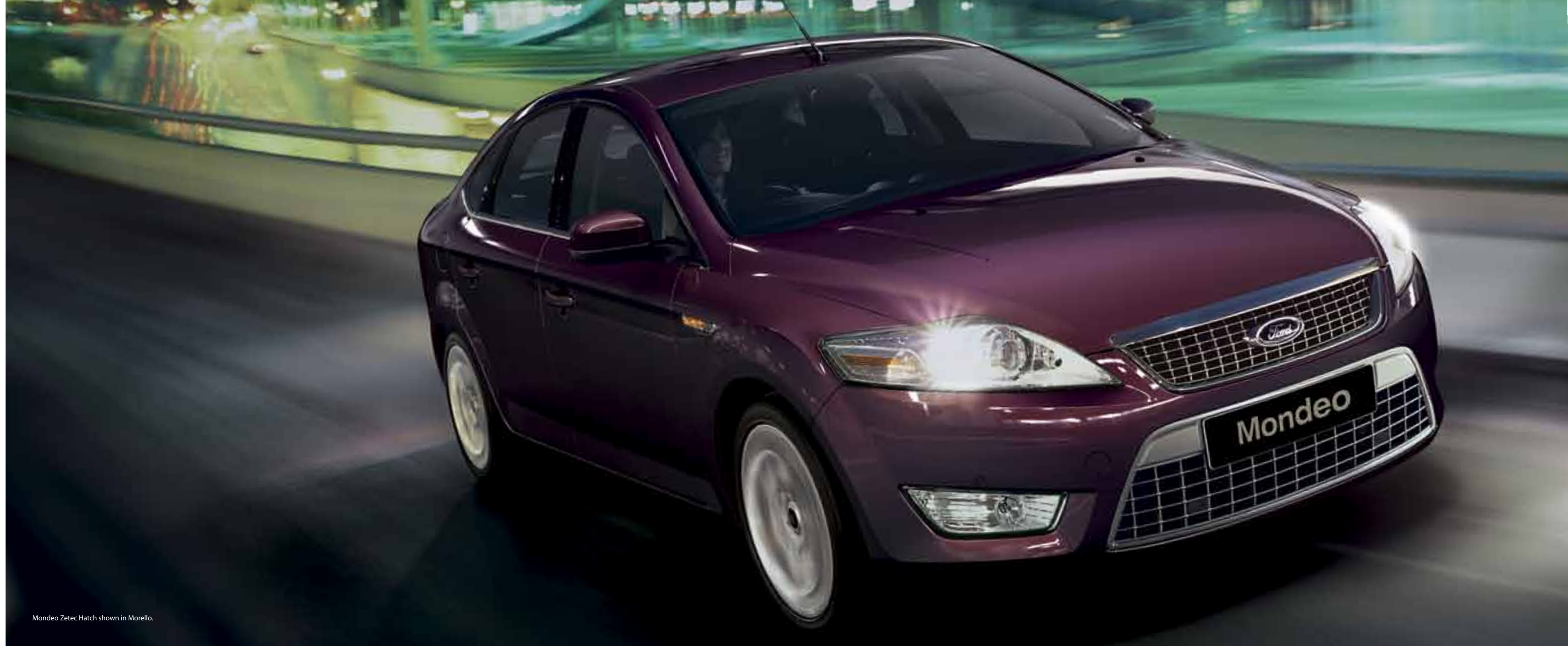
Mondeo Zetec Hatch shown in Morello.