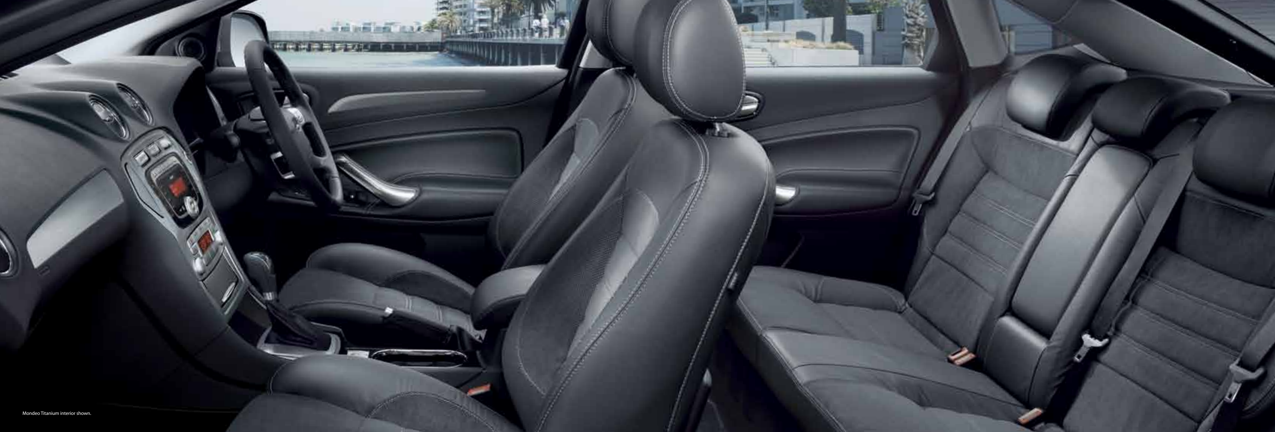
Mondeo Titanium interior shown.