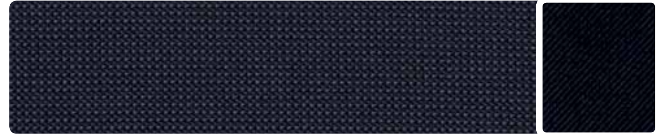
Minute in Infinity Blue.