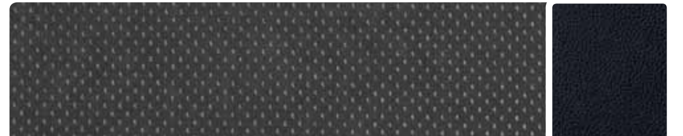
Alcantara/leather in Ebony with Silver stitching.