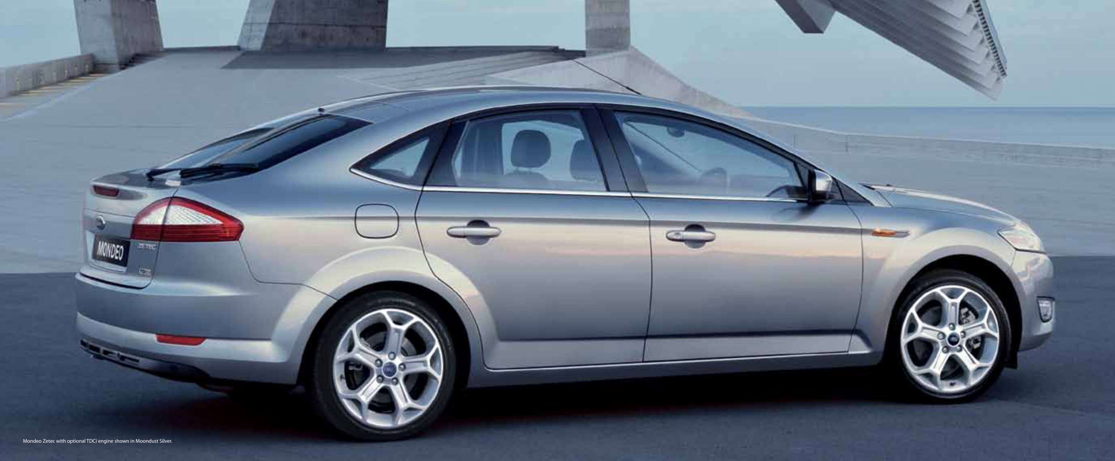
Mondeo Zetec with optional TDCi engine shown in Moondust Silver.