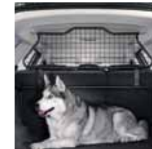
Cargo barrier - wagon.