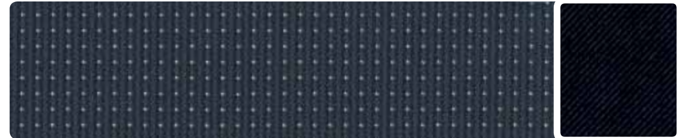
Daphne in Blue.