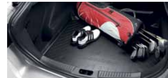
Waterproof boot liner helps keep boot area clean and dry.