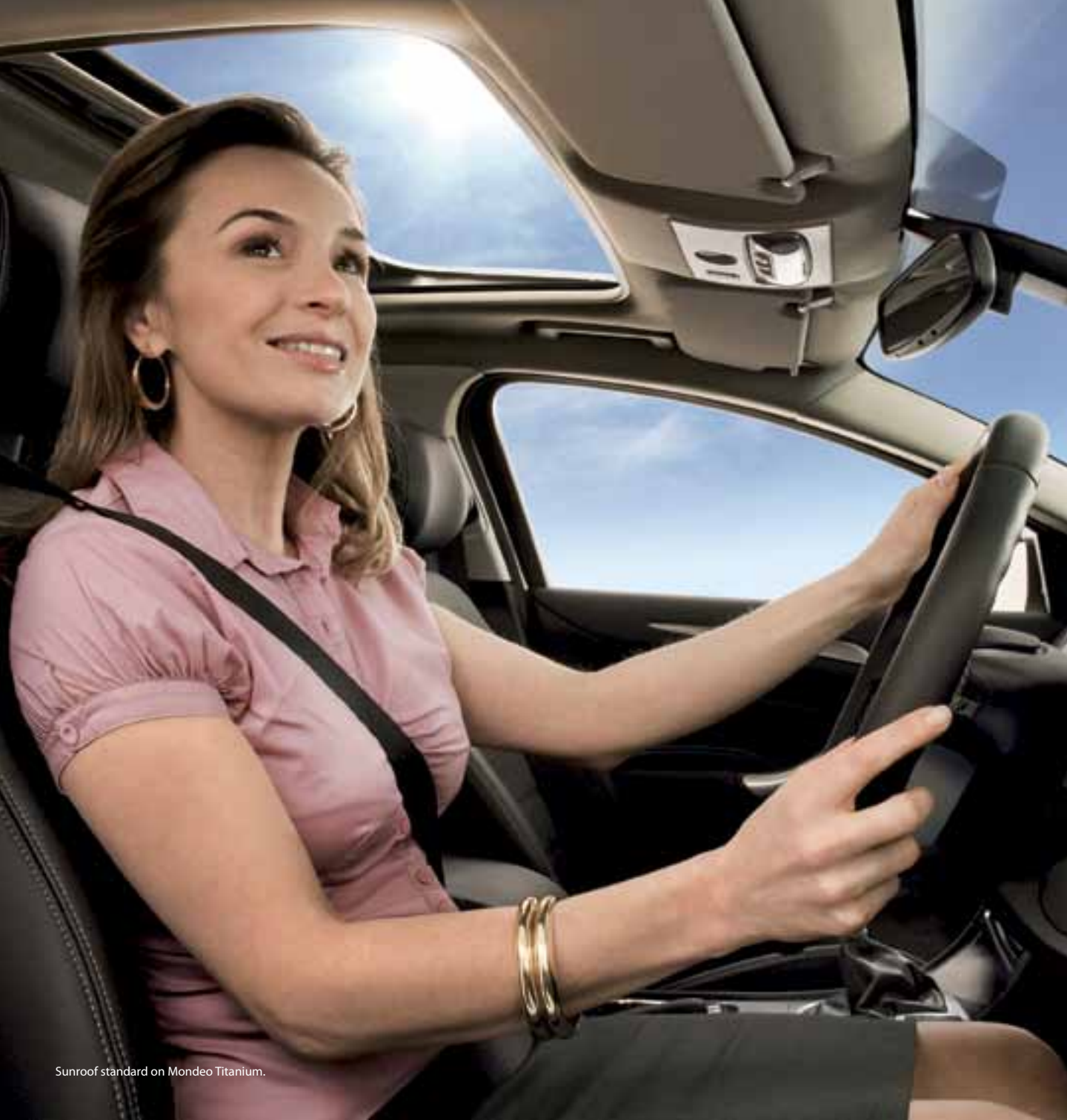
Sunroof standard on Mondeo Titanium.