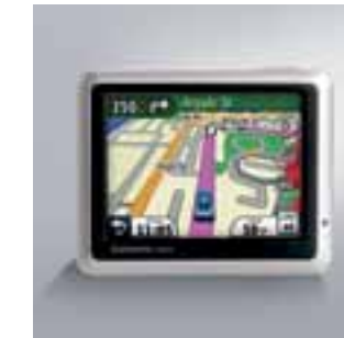
Garmin Nuvi 1250 portable satellite navigation system.