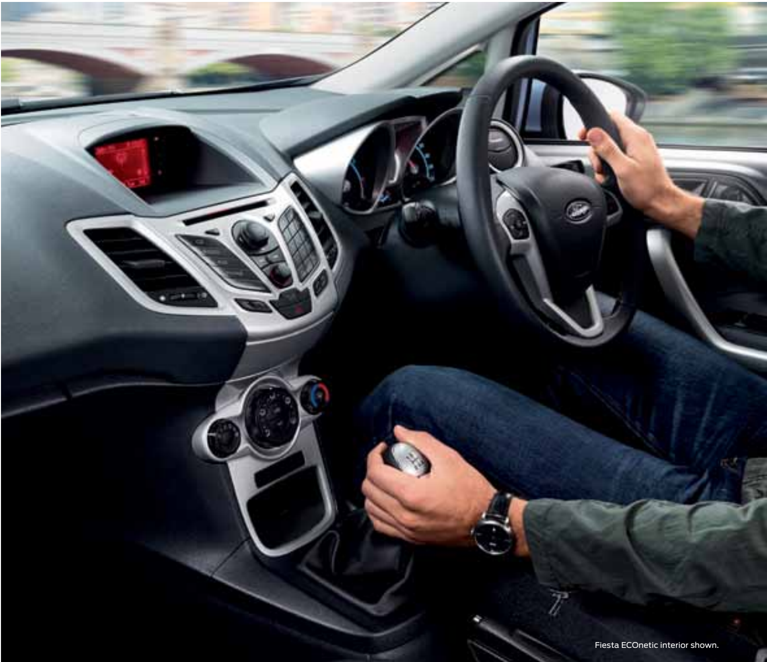
Fiesta ECONetic interior shown.

The environment is everyone's responsibility. At Ford, our 'sustainability vision' plays a key role in shaping the cars we design, engineer and build.