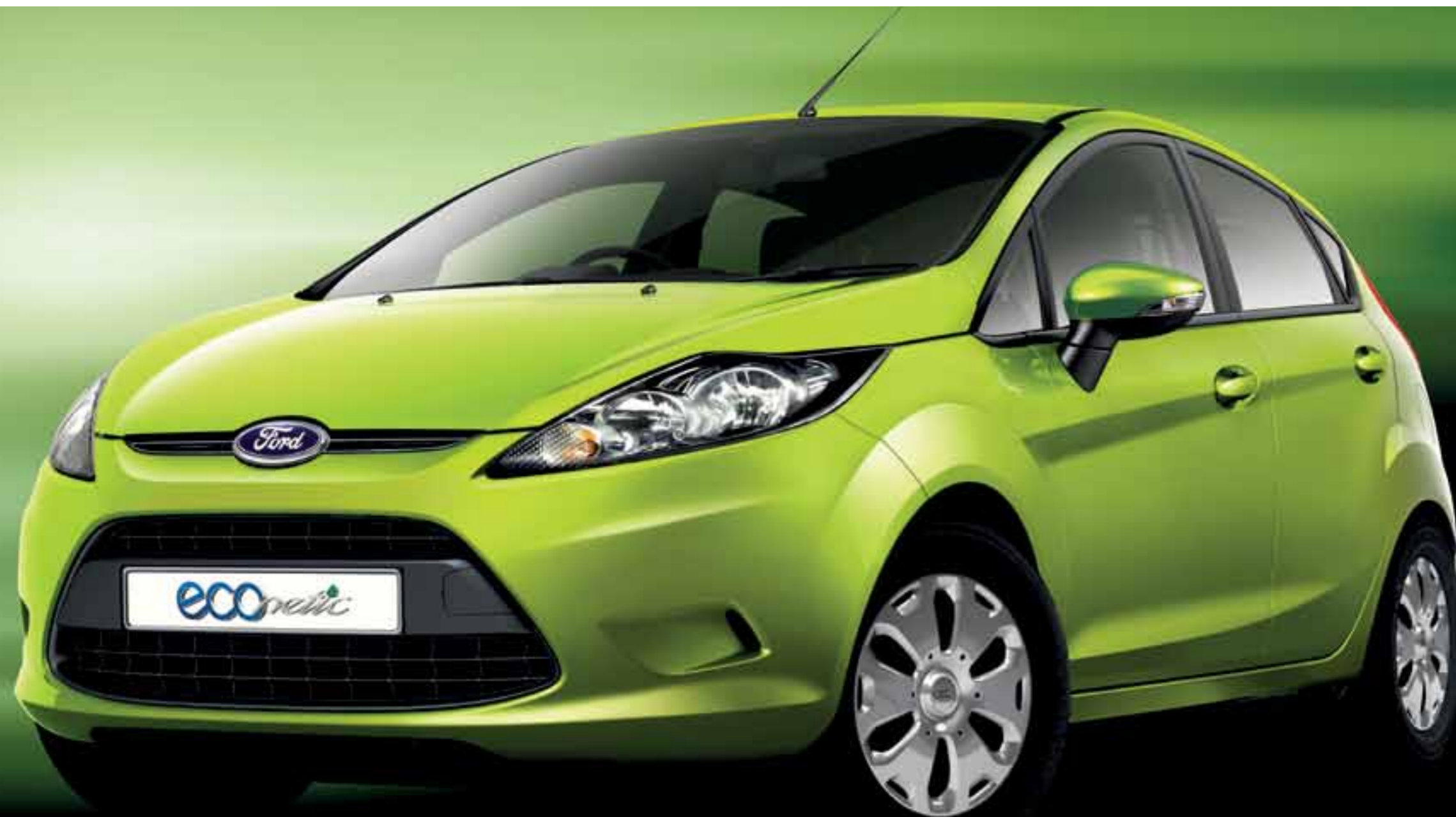
Fiesta EONetic 5 door shown in Squeeze.