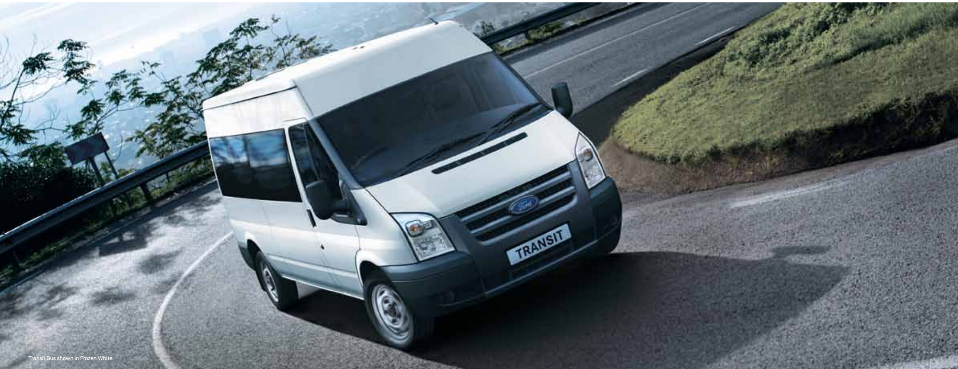
Transit Bus shown in Frozen White.

If your business relies on moving people safely and comfortably, your choice of bus is all important.