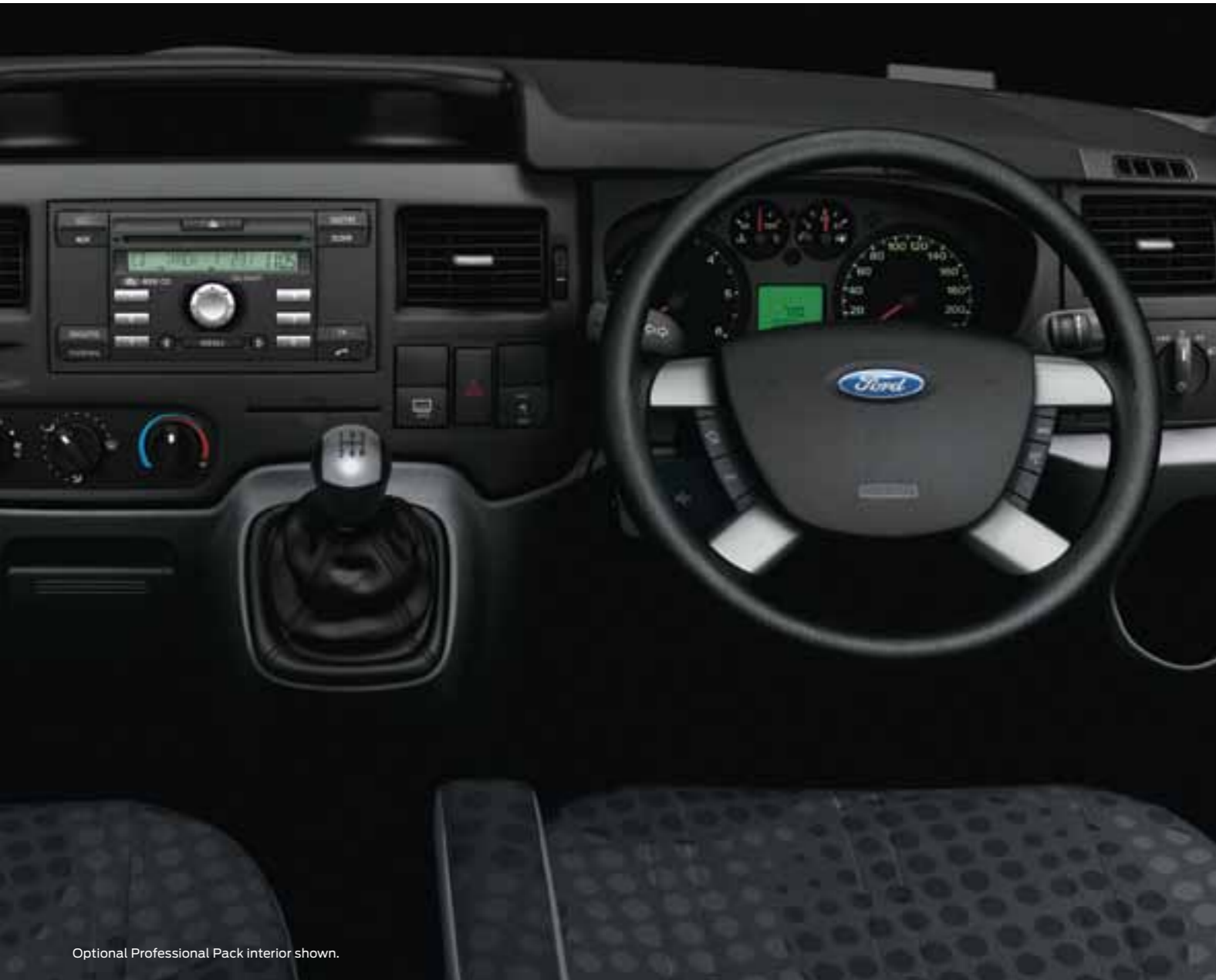
Optional Professional Pack interior shown.

Spend the best part of your day on the road and not surprisingly, comfort becomes a priority.