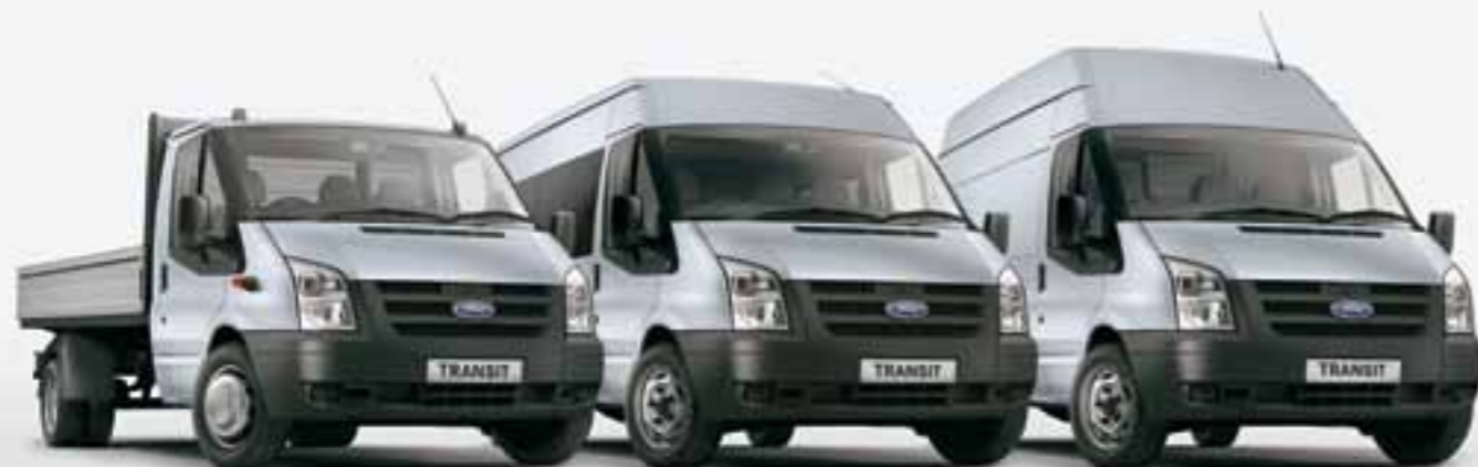
The Ford Transit line-up makes choosing the right van, cab chassis or bus for your business simple. The Transit range definitely means business with bold exterior styling, diesel power, advanced safety and superior comfort. Left to right: Transit Cab Chassis shown with aftermarket tray, Transit Bus, and Transit Van LWB shown with high roof and optional full partition.

That's why the 12-seater Ford Transit Bus is the best candidate for the job. Transit allows your passengers to travel in first-class comfort. Power front windows and supportive seats, each with a height adjustable headrest, make for a relaxing journey, while an interior designed with sound deadening surfaces all but eliminates noise and vibration. Match this with Ford's respected light commercial heritage, and you can be sure your Transit will be reliable, hungry for work and able to handle the rigours of long trips. Top this off with Transit's modern looks, and you and your passengers are guaranteed to arrive in style.