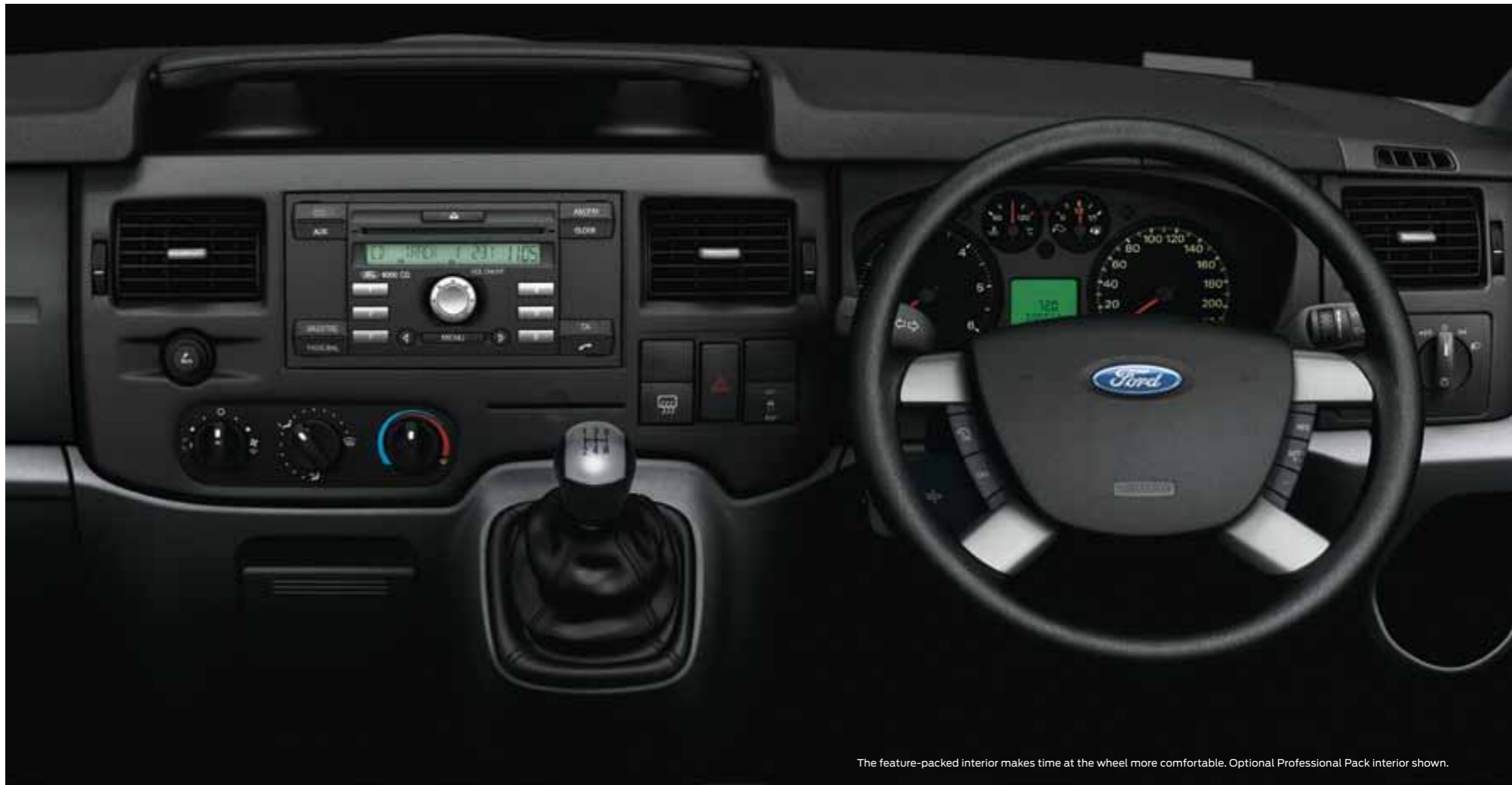
The feature-packed interior makes time at the wheel more comfortable. Optional Professional Pack interior shown.

In business, there's nothing more precious than you and your cargo. So when it comes to safety, Transit delivers big time. The solid body structure offers end-to-end strength and surrounds you with a protective shell. Inside, a driver's airbag and the ABS with Electronic Brakeforce Distribution are standard across the range. Plus, for added protection the optional Professional Pack includes front passenger airbag, cruise control, and Dynamic Stability Control (DSC) with Traction Control* and Hill Launch Assist. Driver and passenger are further protected by optional front side airbags† that provide increased protection from side impacts in an accident. In terms of vehicle and cargo security, an alarm, engine immobiliser, power door deadlocks and unique security coded keys are standard on every Van and Cab Chassis model. You can see why Transit is a safe bet for you and your business.