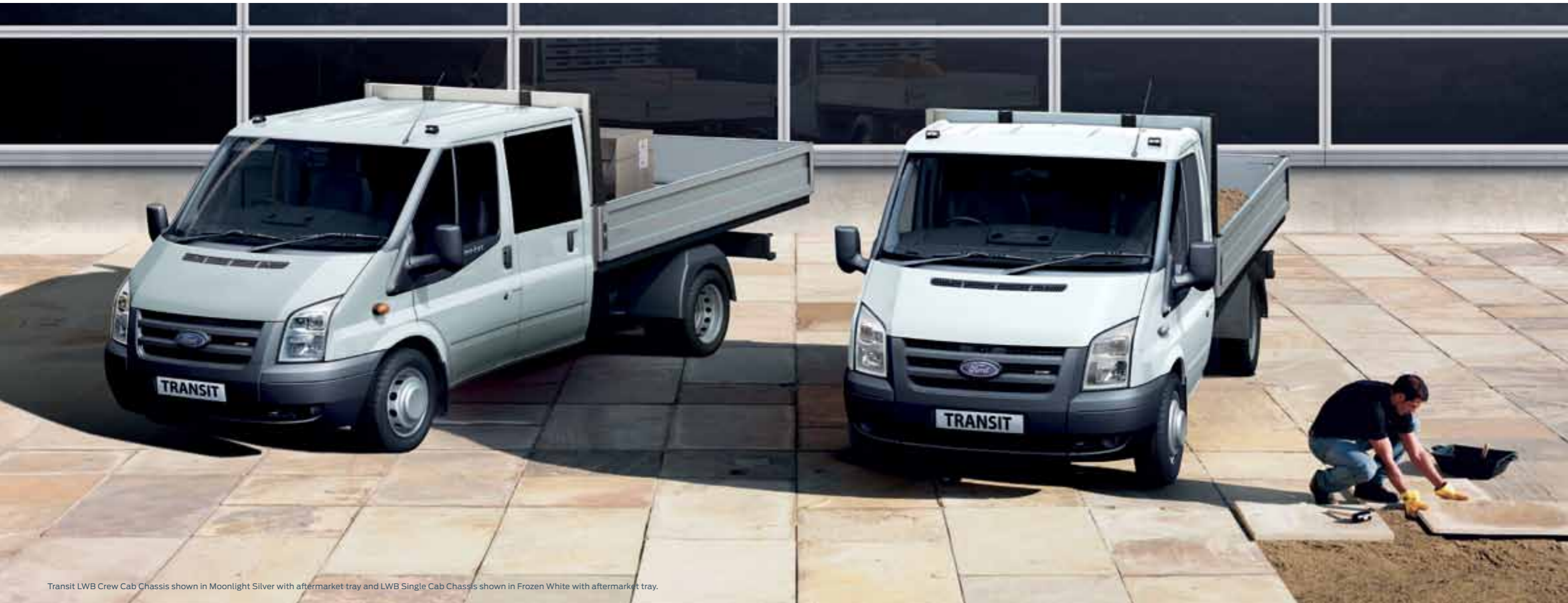
Transit LWB Crew Cab Chassis shown in Moonlight Silver with aftermarket tray and LWB Single Cab Chassis shown in Frozen White with aftermarket tray.

Everyone wants their business to go places. Making sure it does can have a lot to do with the vehicle you choose.