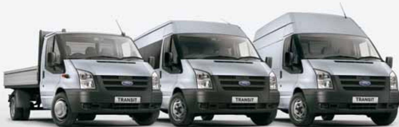
The Ford Transit line-up makes choosing the right van, cab chassis or bus for your business simple. The Transit range definitely means business with bold exterior styling, diesel power, advanced safety and superior comfort. Left to right: Transit Cab Chassis shown with aftermarket tray, Transit Bus, and Transit Van LWB shown with high roof and optional full partition.

That's why the Ford Transit Cab Chassis is the best candidate for the job. It's engineered from the ground up to get the job done. You can choose from a Single or Crew Cab, each available with a 4,490kg Gross Vehicle Mass extended frame for longer and heavier loads. So no matter how big or small the job is, there's a Transit that'll suit your needs right down to the ground. And with Ford's respected light commercial heritage, you can be sure your Transit will be reliable, hungry for work and able to handle the rigours of daily labour.