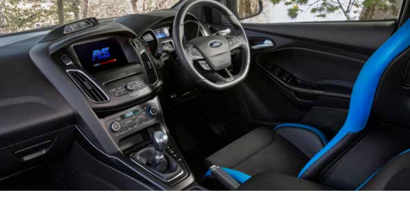
The Focus RS Limited Edition takes the striking styling, refined power and superb driving dynamics of the Focus RS to new levels of looks and performance. Designed to catch the eye and engineered to deliver every ounce of power from the 257kW 2.3L EcoBoost* engine, this RS Limited Edition will only be enjoyed by the lucky few.