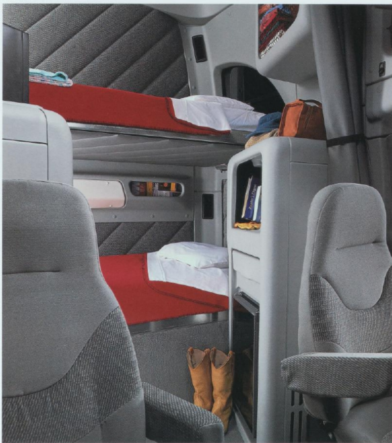
77-inch AeroLiner integrated sleeper