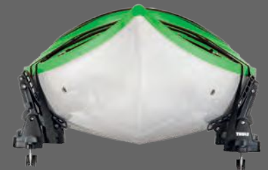
DOCKGRIP HORIZONTAL KAYAK RACK

Accommodates up to two kayaks, two stand up paddleboards or a combination of both.