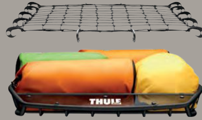
CANYON XT ROOF BASKET