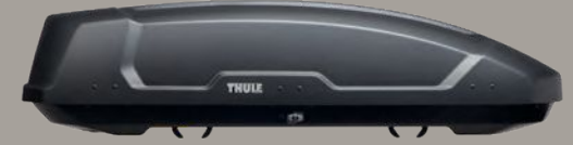
FORCE XT ROOF BOX