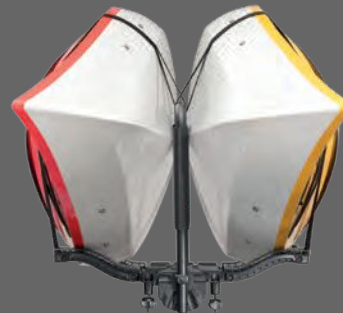
COMPASS VERTICAL KAYAK RACK

Accommodates up to two kayaks, two stand up paddleboards or a combination of both.