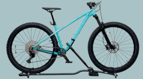
PRORIDE XT ROOFTOP BIKE RACK

Accommodates up to two snowboards, six pairs of skis or a combination of both.