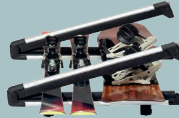
SNOWPACK L SKI AND SNOWBOARD RACK

Accommodates up to two snowboards, six pairs of skis or a combination of both.