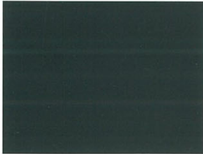
ATHLETE GREY METALLIC