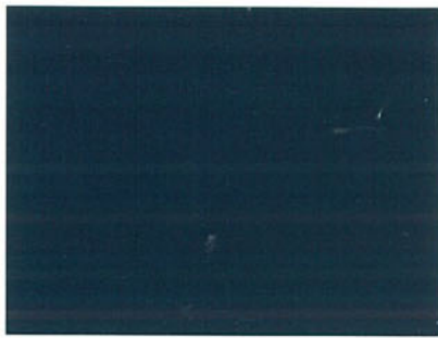
ADRIATIC BLUE PEARL