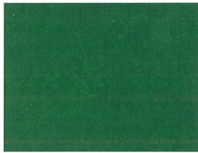
CLOVER GREEN PEARL