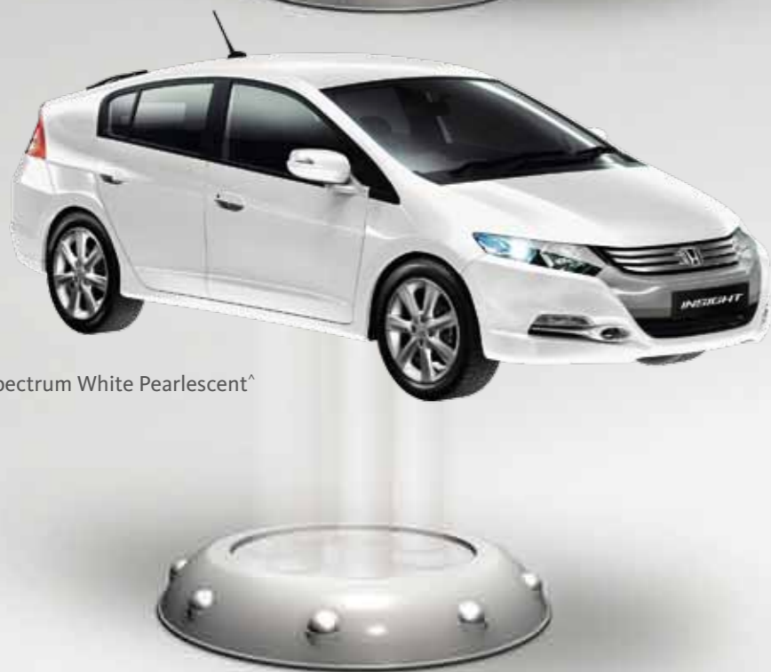
Spectrum White Pearlescent ^