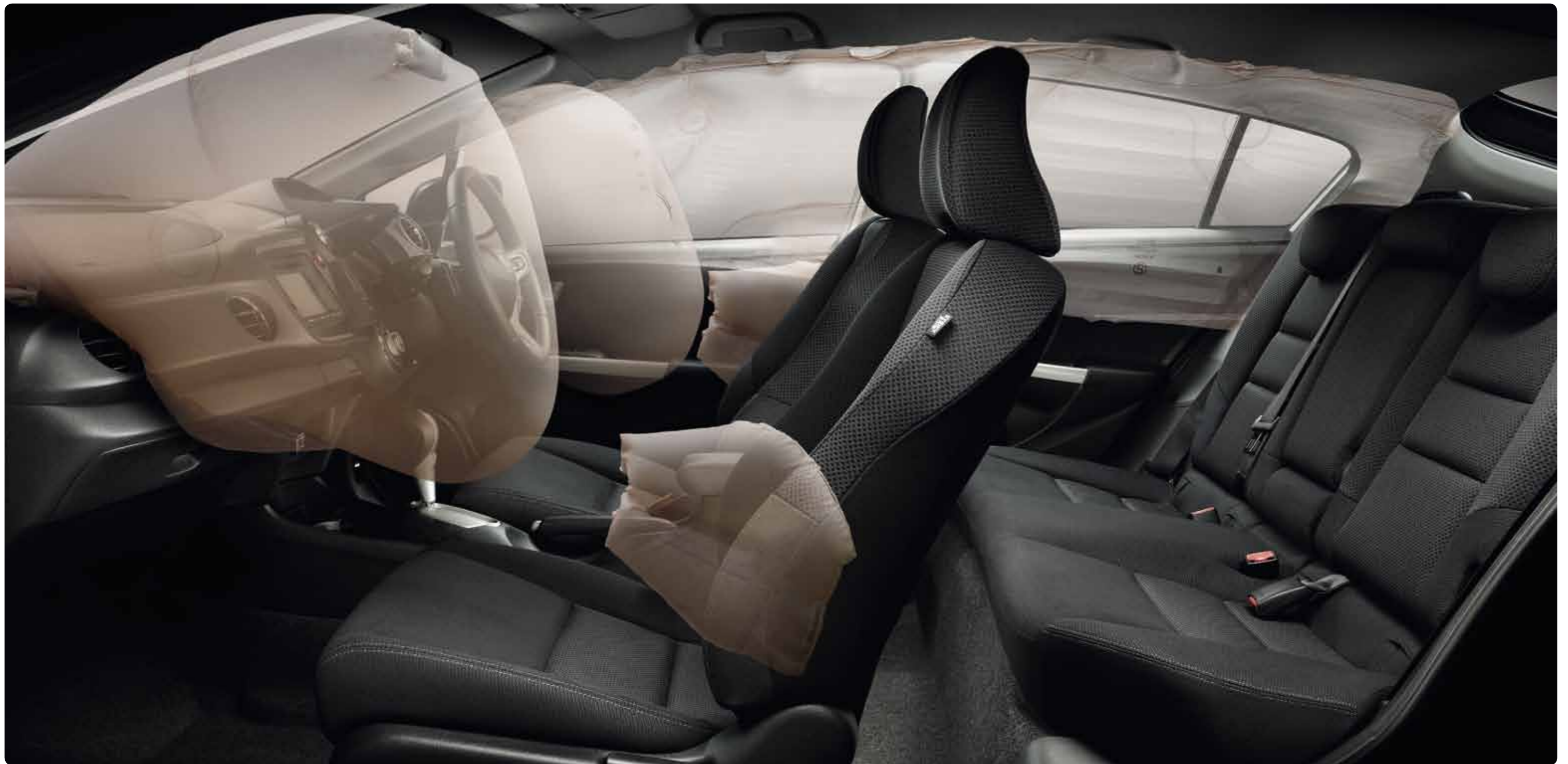
VTi-L model shown.