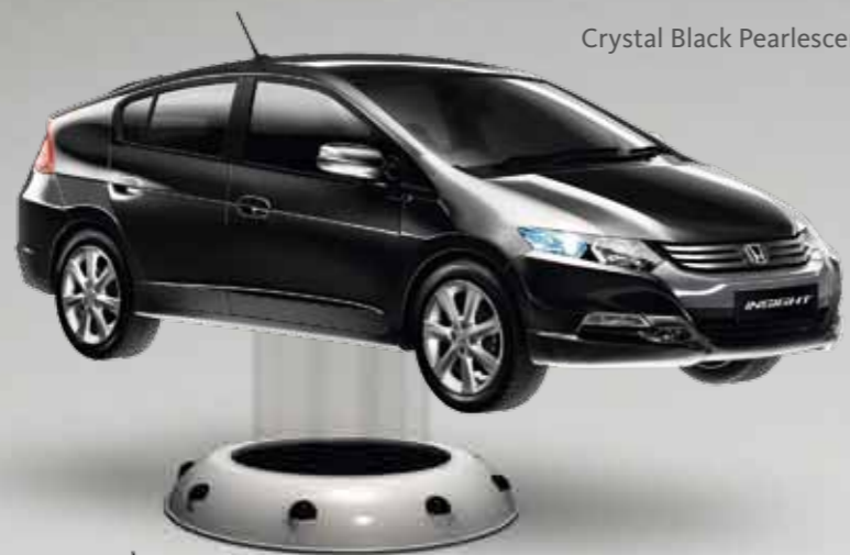
Crystal Black Pearlescent ^