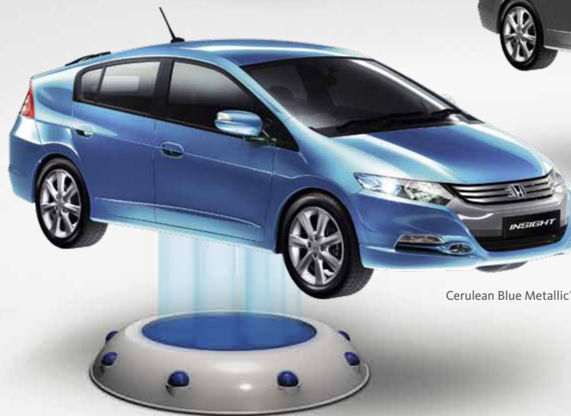
Cerulean Blue Metallic ^