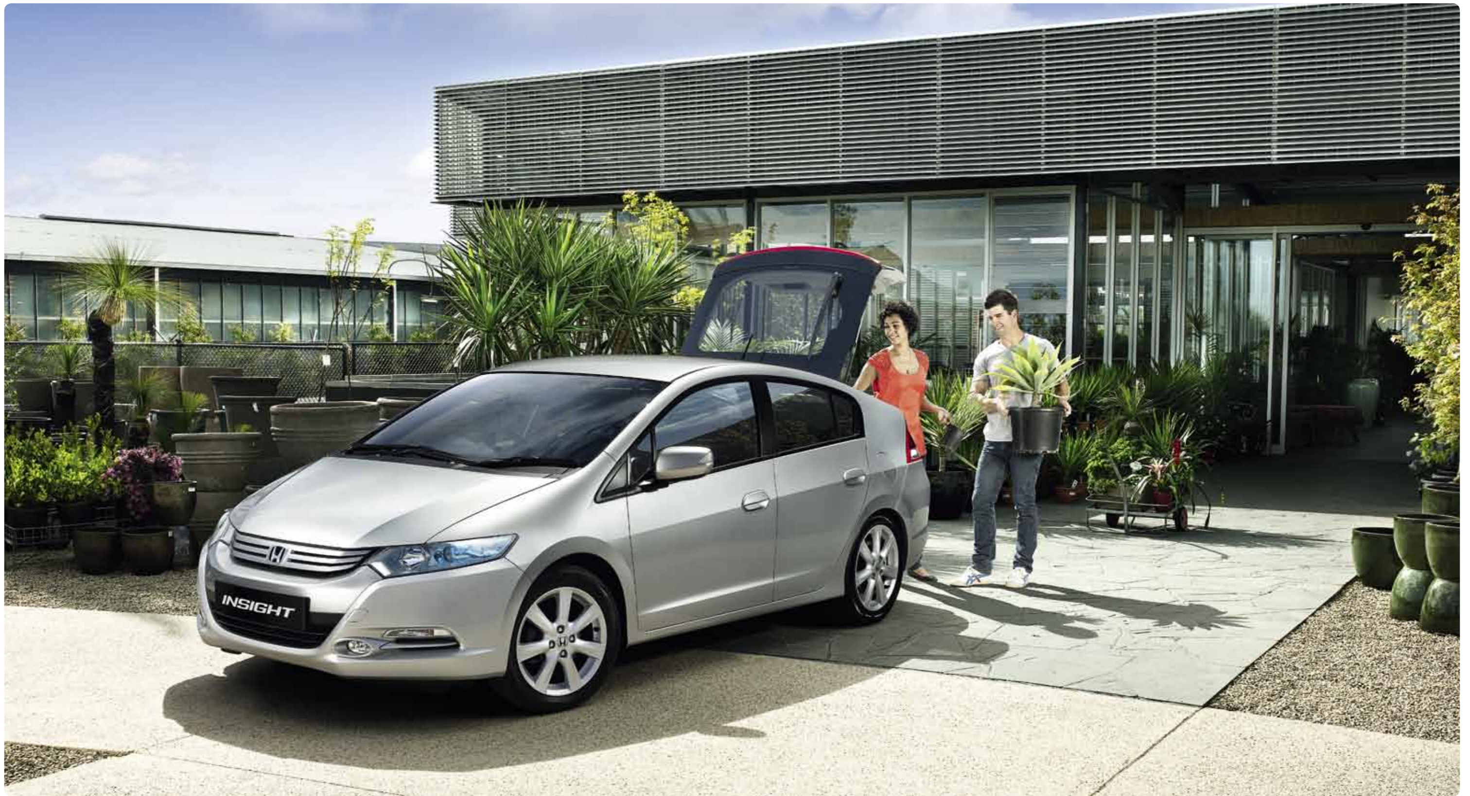
VTi-L model shown.