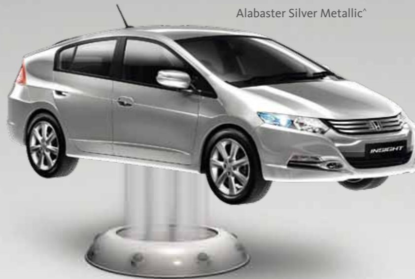
Alabaster Silver Metallic ^