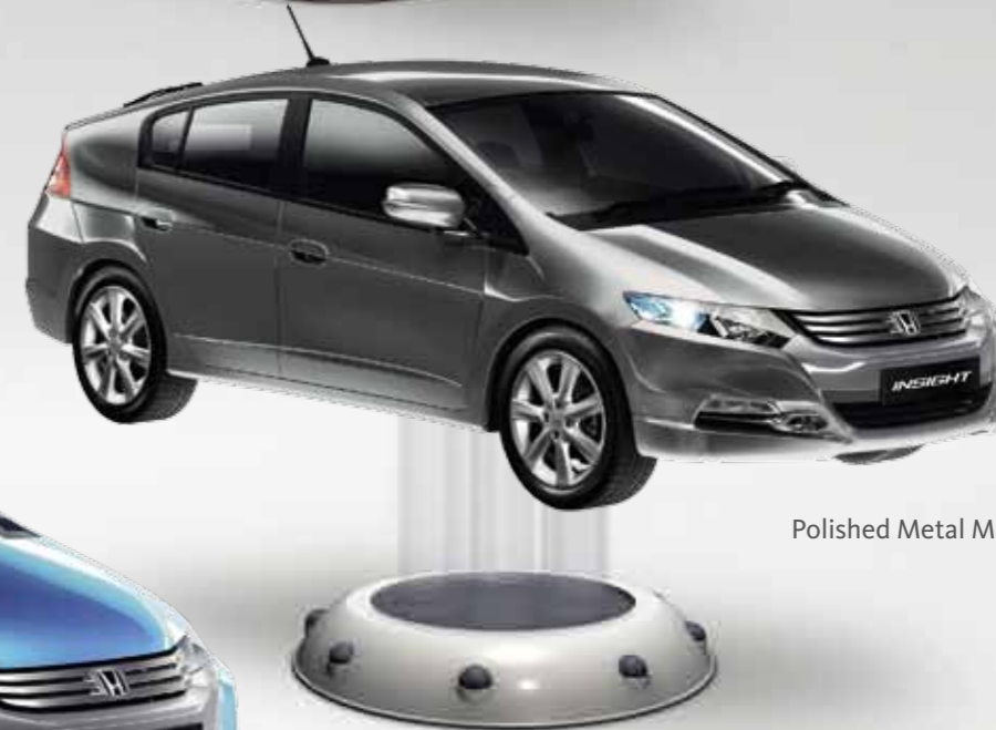
Polished Metal Metallic ^