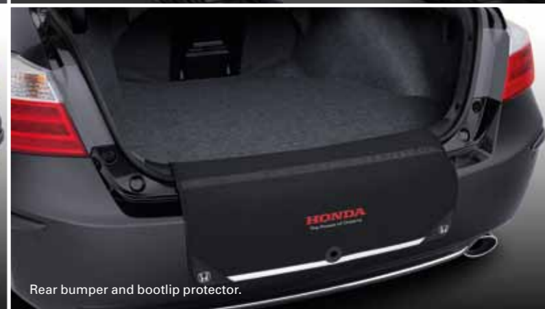
Rear bumper and bootlip protector.