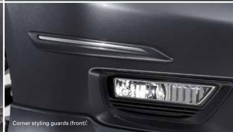
Corner styling guards (front) 1 .