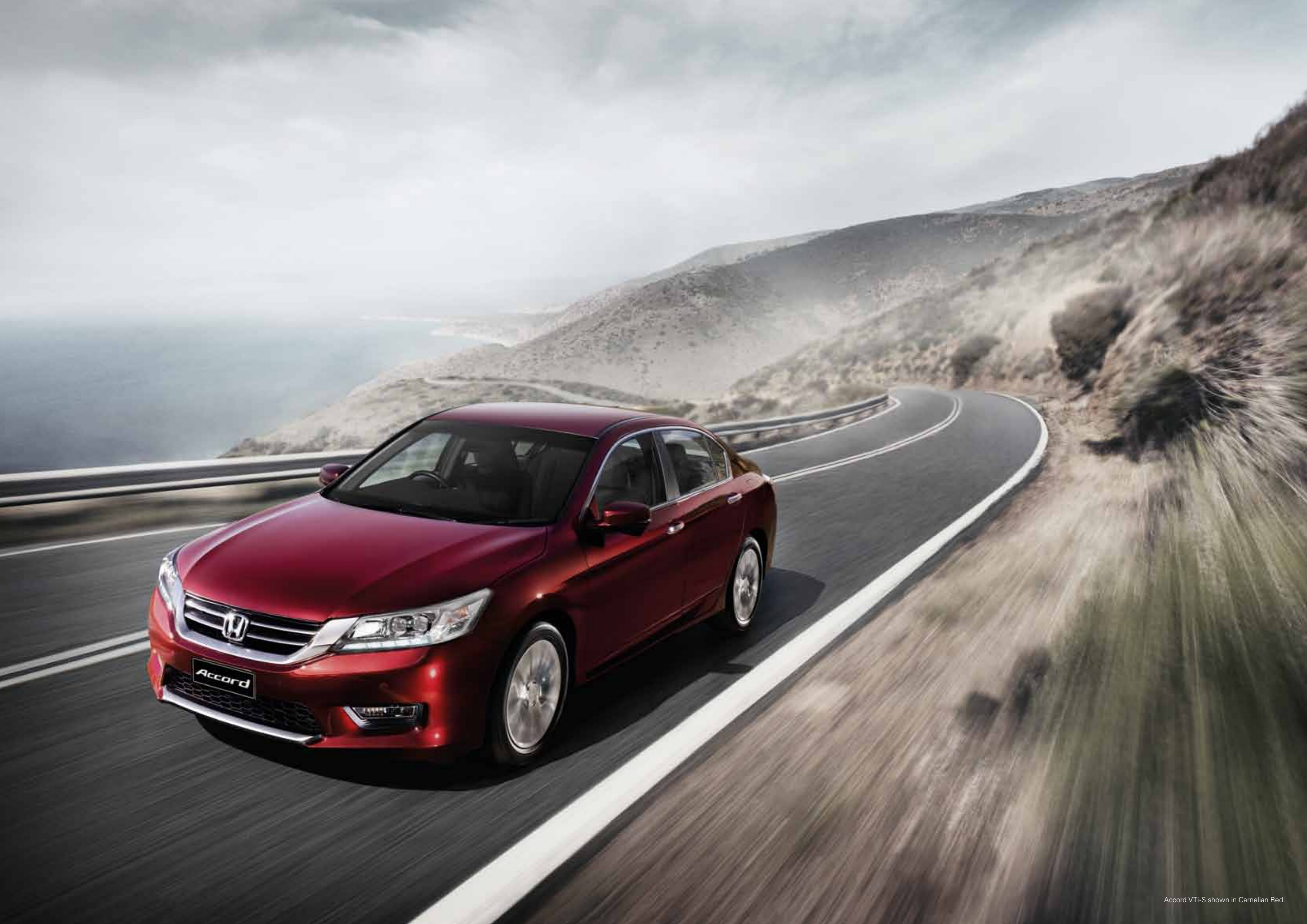
Accord VTi-S shown in Carnelian Red.