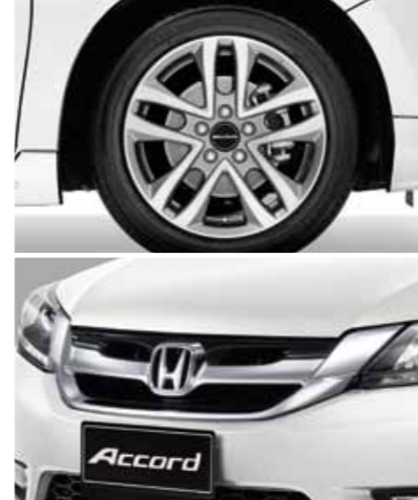
▲ Top to bottom: 17-inch alloy wheels (VTi and VTi-S only) Front grille (VTi, VTi-S and VTi-L* only)