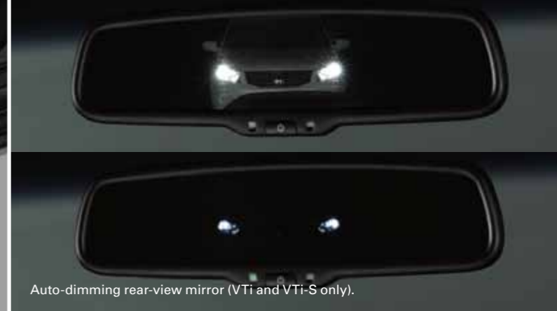
Auto-dimming rear-view mirror (VTi and VTi-S only).