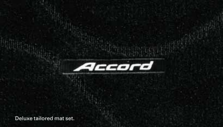
Deluxe tailored mat set.