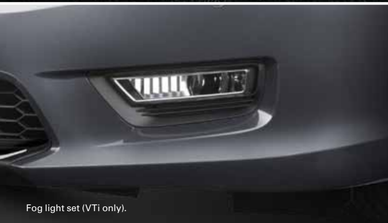
Fog light set (VTi only).