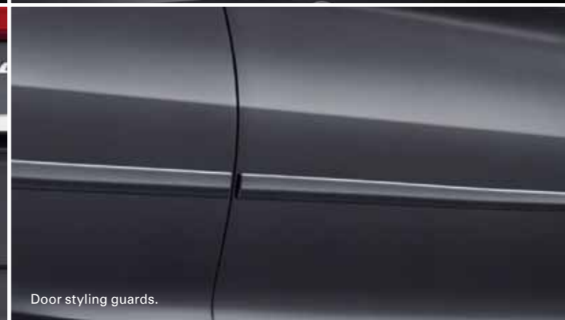
Door styling guards.