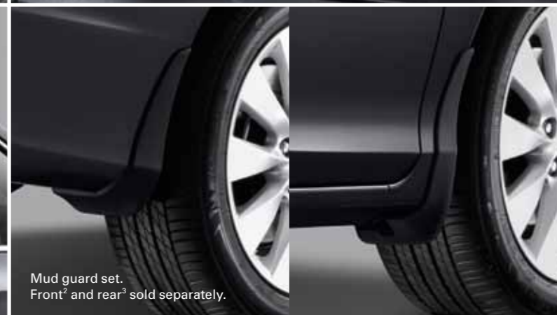
Mud guard set. Front 2 and rear 3 sold separately.