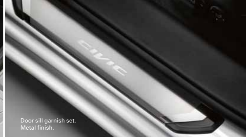
Door sill garnish set. Metal finish.