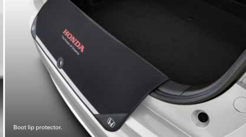
Boot lip protector.