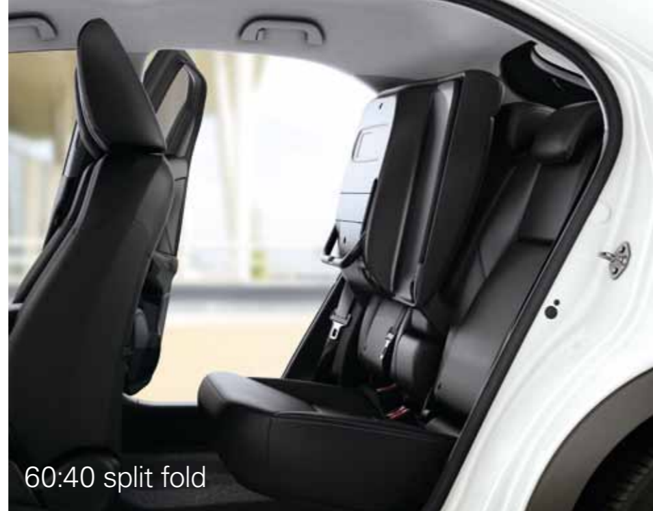
60:40 split fold