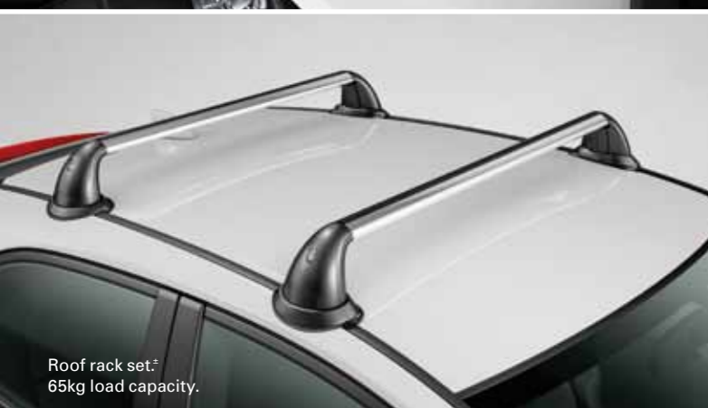
Roof rack set. 2 65kg load capacity.