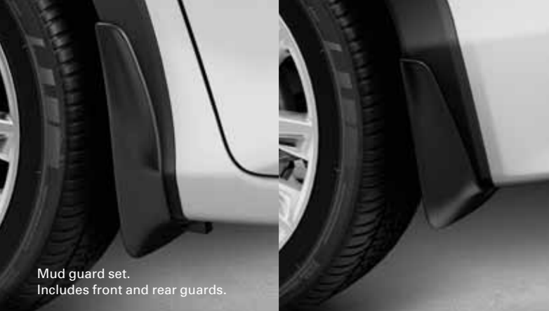
Mud guard set. Includes front and rear guards.