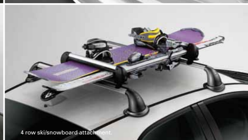
4 row ski/snowboard attachment.