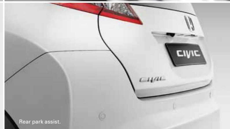
Rear park assist.