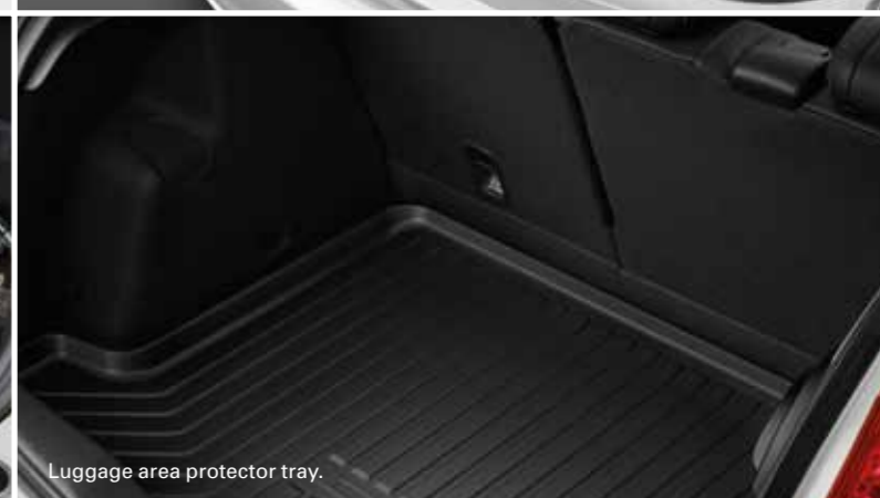
Luggage area protector tray.