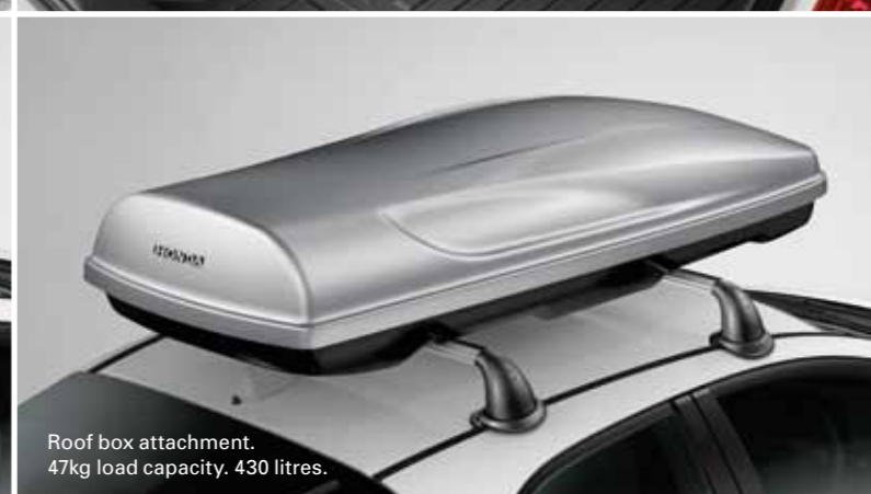
Roof box attachment. 47kg load capacity. 430 litres.