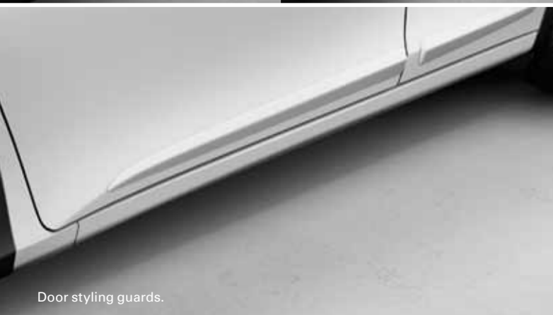
Door styling guards.