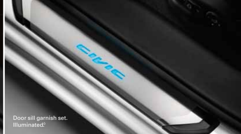
Door sill garnish set. Illuminated o