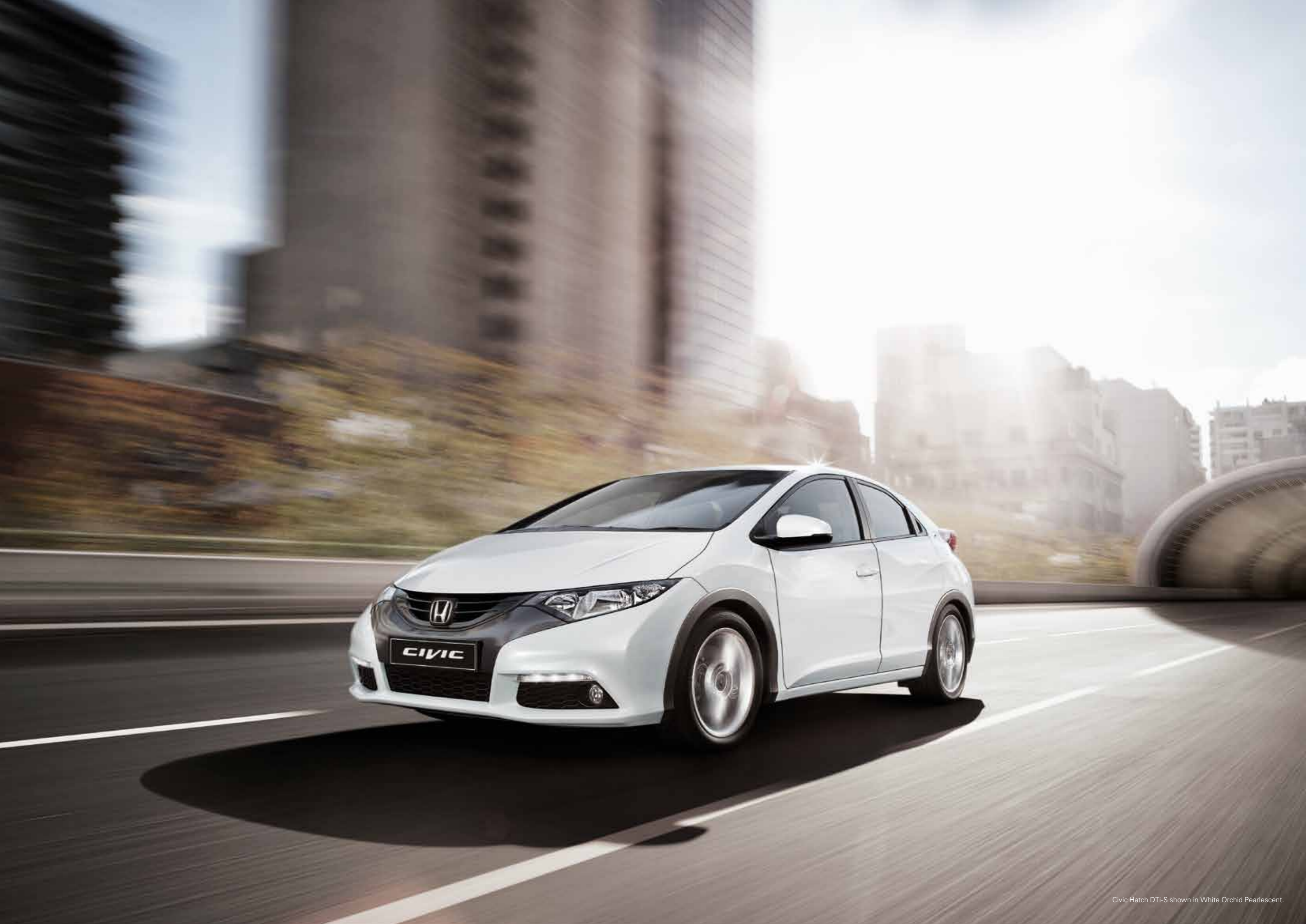
Civic Hatch DTi-S shown in White Orchid Pearlescent.