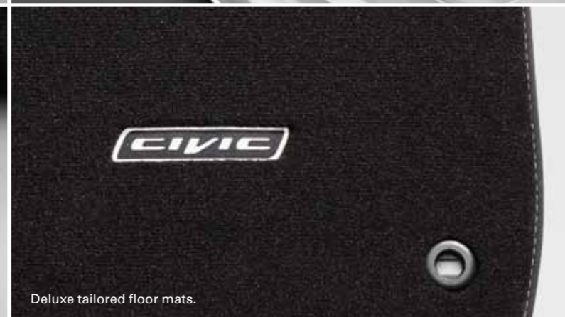
Deluxe tailored floor mats.