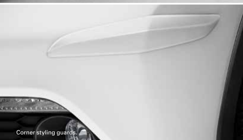
Corner styling guards.