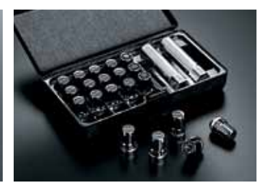
SECURITY WHEEL NUT SET