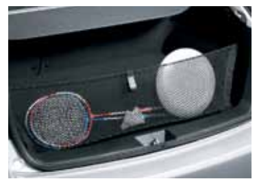
CARGO NET (REAR TAILGATE) - HATCH