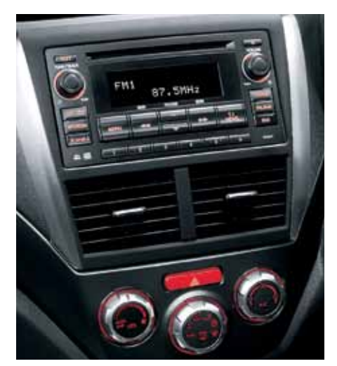
SINGLE IN-DASH CD PLAYER: SUBARU WRX