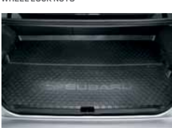
CARGO TRAY - SEDAN