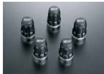
WHEEL LOCK NUTS (BLACK)