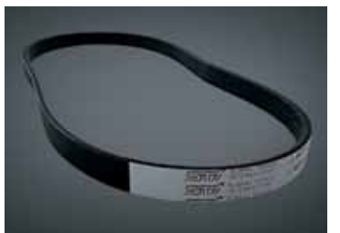
COMPETITION ALTERNATOR/POWER STEERING BELT