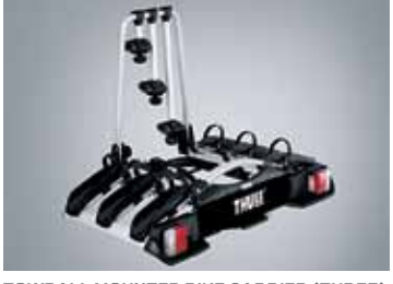
TOWBALL MOUNTED BIKE CARRIER (THREE) BICYCLE HOLDER (FORK MOUNTED)