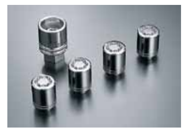
WHEEL LOCK NUTS