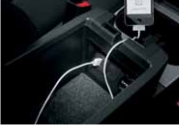
MEDIA HUB IPOD INTERFACE