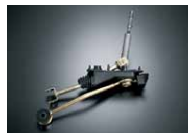
ALUMINIUM AND LEATHER GEAR KNOB - 5MT SHORT SHIFT GEAR LEVER ASSEMBLY - 5MT FLEXIBLE TOWER BAR