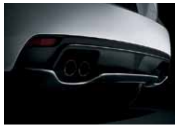
REAR UNDER SPOILER - HATCH