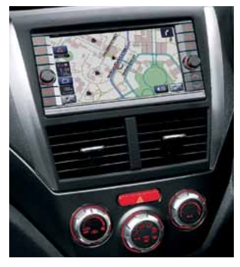
MULTI-INFORMATION IN-DASH SATELLITE NAVIGATION SYSTEM: SUBARU WRX PREMIUM