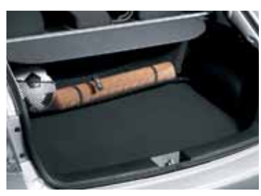
CARGO NET (REAR SEAT) - HATCH