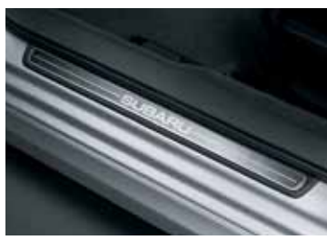
SIDE SILL PLATE