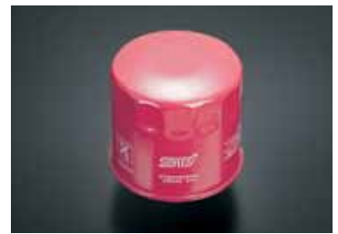
COMPETITION OIL FILTER