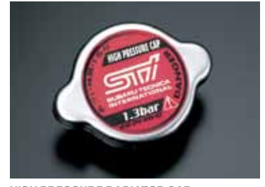
HIGH PRESSURE RADIATOR CAP