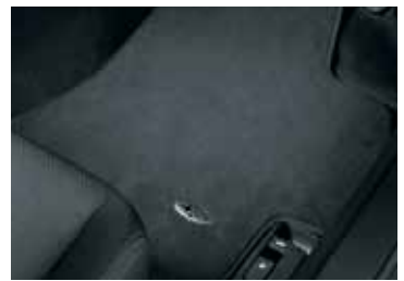
CARPET FLOOR MATS