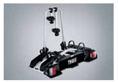
TOWBALL MOUNTED BIKE CARRIER (TWO)