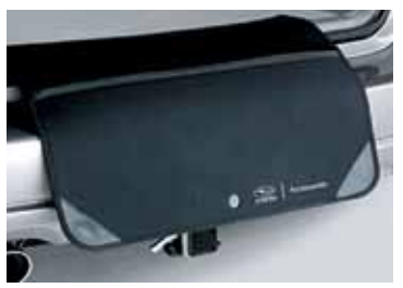
BOOT LIP AND BUMPER PROTECTOR