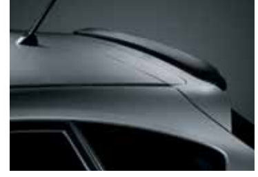
REAR ROOF LIP SPOILER - HATCH