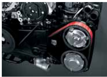
COMPETITION TIMING BELT