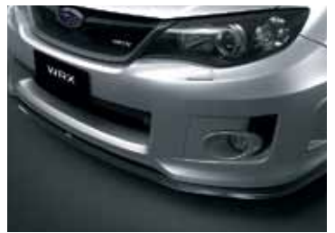
FRONT LIP SPOILER