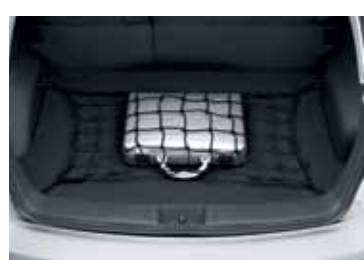
CARGO NET (FLOOR) - HATCH