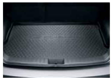
CARGO TRAY - HATCH