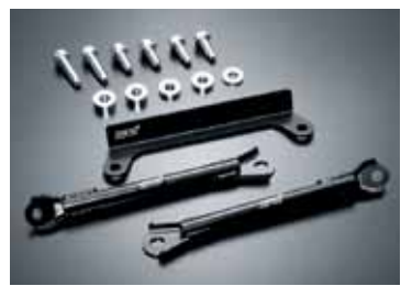
FRONT SUPPORT KIT