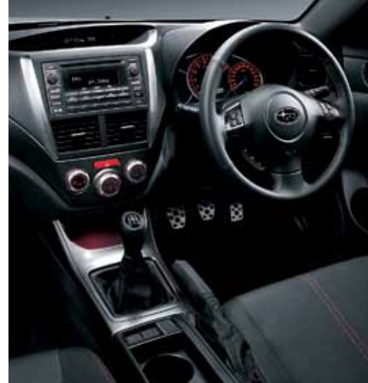
BLACK CLOTH: SUBARU WRX