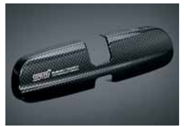
CARBON FIBRE DESIGN MIRROR COVER