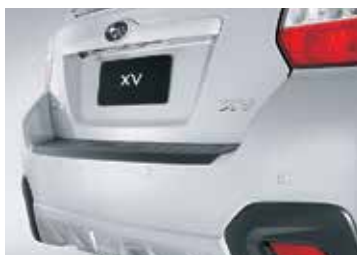
PARKING ASSIST (REAR)