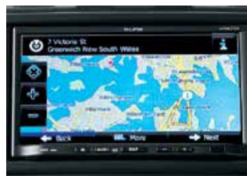
AVN NAVIGATION SYSTEM