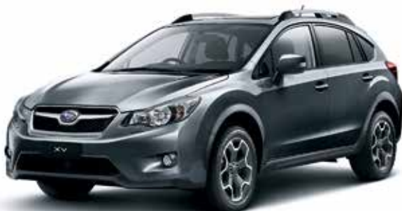
DARK GREY METALLIC