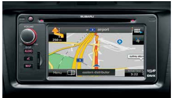
MULTI-INFORMATION IN-DASH SATELLITE NAVIGATION SYSTEM: SUBARU XV 2.0i-L AND SUBARU XV 2.0i-S