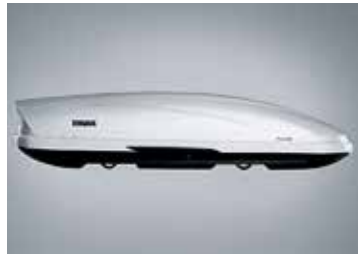
THULE MOTION 800 SILVER LUGGAGE POD