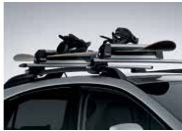
UNIVERSAL LOCKING ARMS