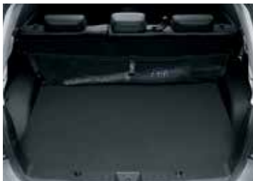
CARGO NET (REAR SEAT BACK)