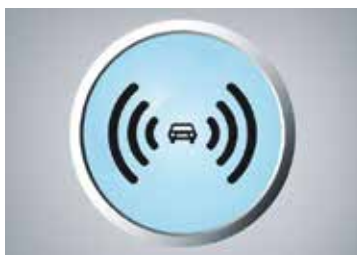
SECURITY ALARM SYSTEM