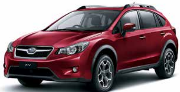
VENETIAN RED PEARL