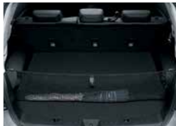
CARGO NET (REAR TAILGATE)