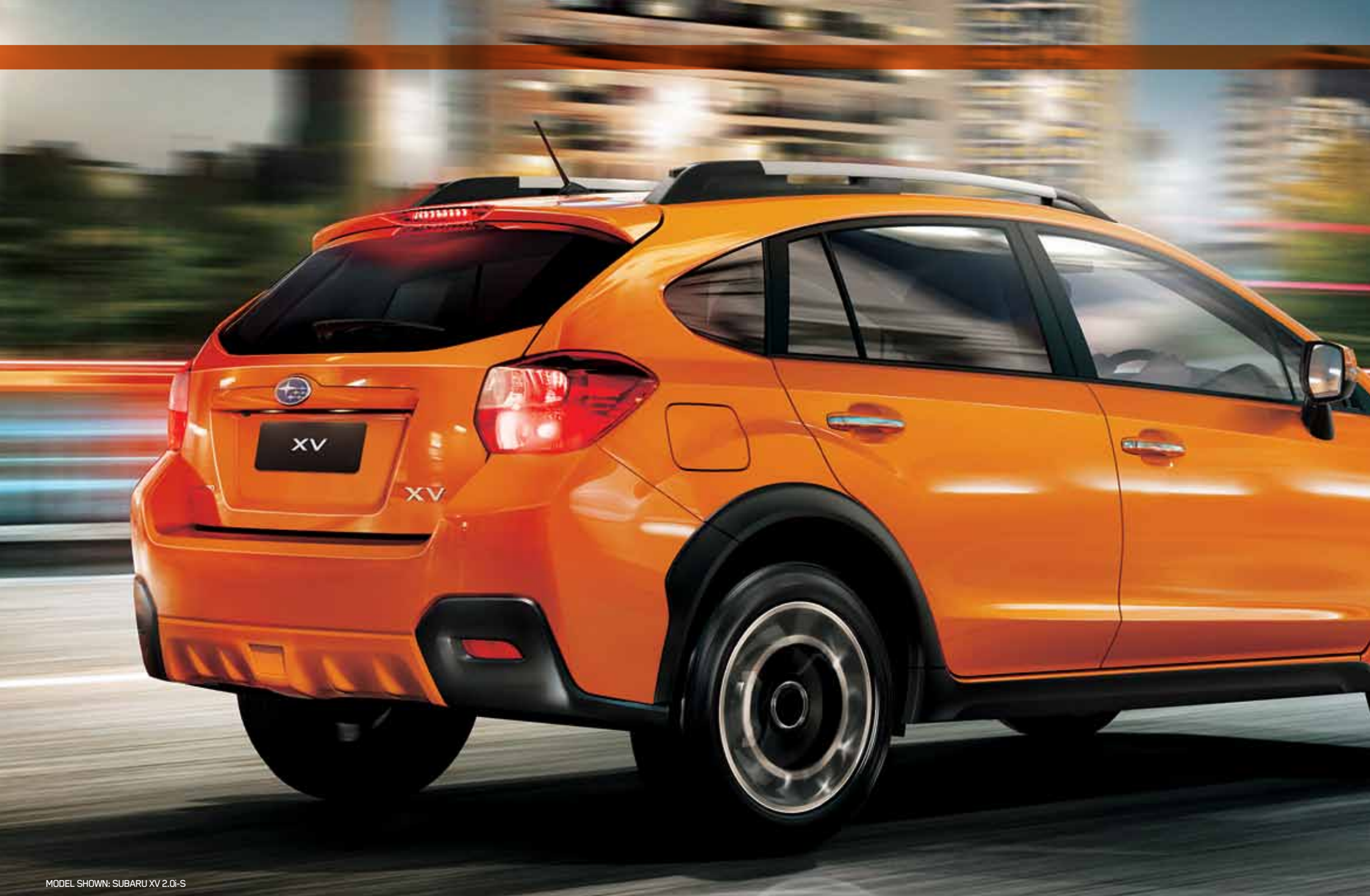
MODEL SHOWN: SUBARU XV 2.0i-S