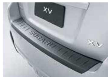
CARGO STEP PANEL (RESIN)