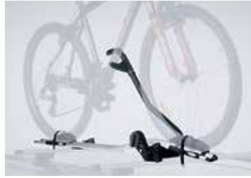
BICYCLE HOLDER (UPRIGHT)