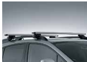
ROOF CROSS BARS