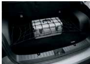
CARGO NET (FLOOR)