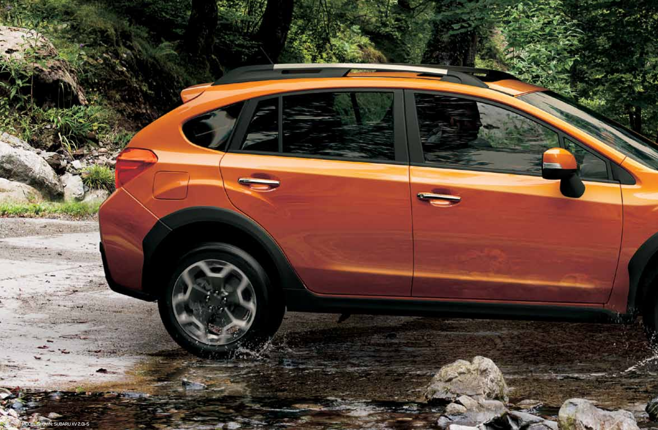
MODEL SHOWN: SUBARU XV 2.0i-S