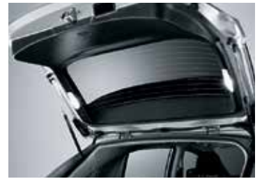
REAR HATCH LIGHTS