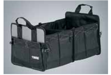
THULE GO BOX