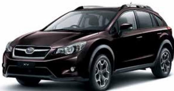
DEEP CHERRY PEARL