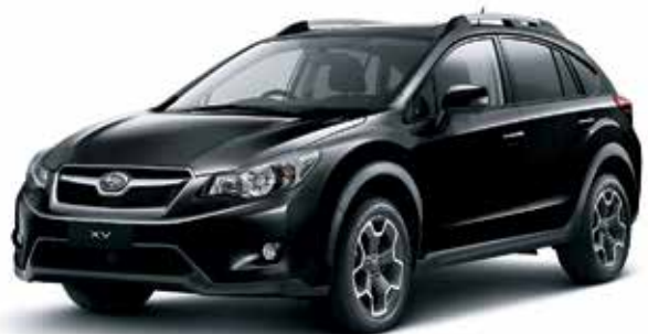
CRYSTAL BLACK SILICA