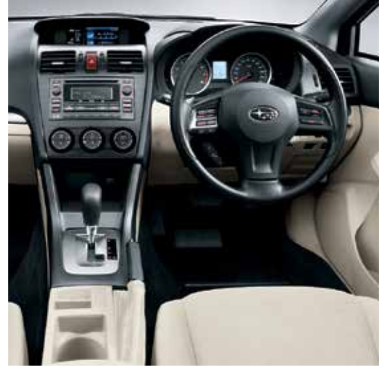
CLOTH: CHOICE OF BLACK OR IVORY: SUBARU XV 2.0i AND SUBARU XV 2.0i-L