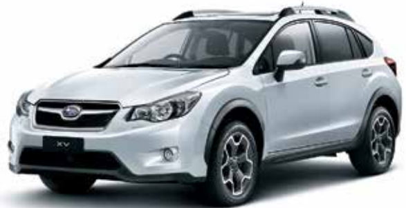
ICE SILVER METALLIC