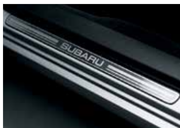
SIDE SILL PLATE