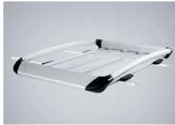
LUGGAGE RACK (SMALL AND LARGE)