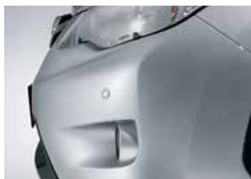
PARKING ASSIST (FRONT)