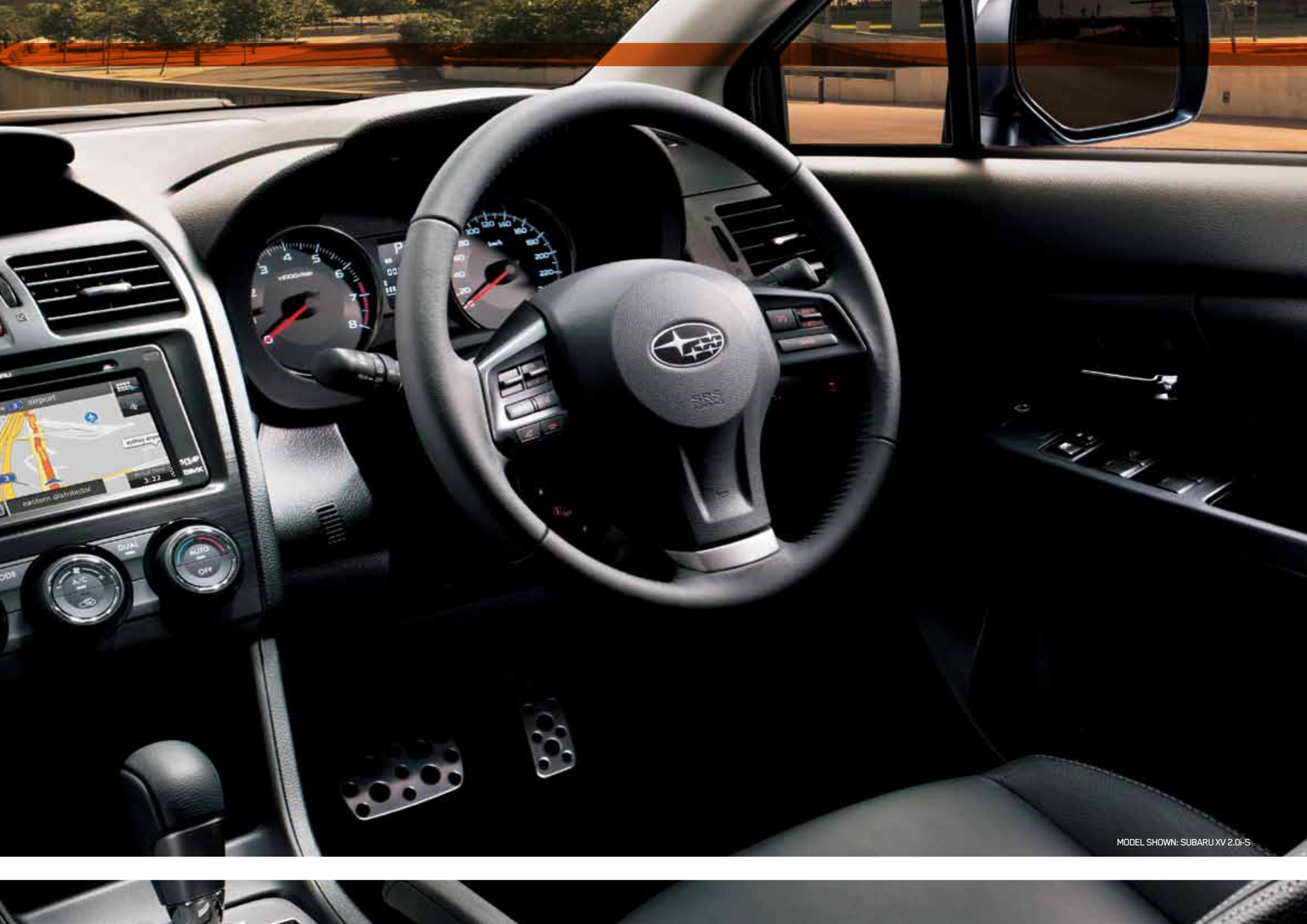
MODEL SHOWN: SUBARU XV 2.0i-S