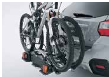
TOW BALL MOUNTED BIKE CARRIER (TWO BIKES)