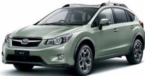
JASMINE GREEN METALLIC