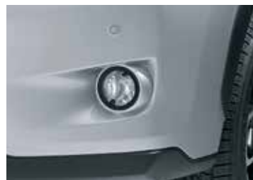
FOG LAMP PROTECTOR