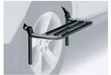
SIDE STEP UP