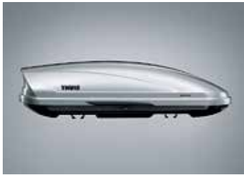
THULE MOTION 200 SILVER LUGGAGE POD