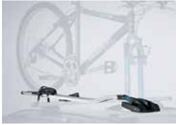
BICYCLE HOLDER (FORK MOUNTED)