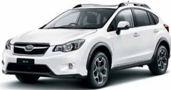
SATIN WHITE PEARL

Always check with your authorised Subaru Retailer regarding colour availability of your selected model before purchase.