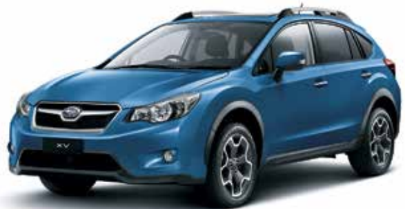
MARINE BLUE PEARL 1