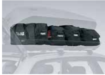
THULE GO PACK SET