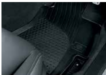
RUBBER MAT SET