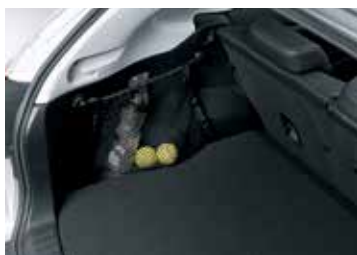
CARGO NET (SIDES)