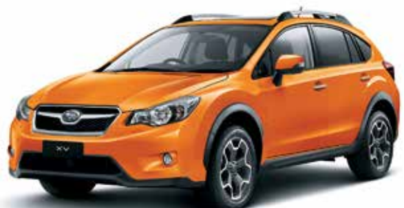
TANGERINE ORANGE PEARL