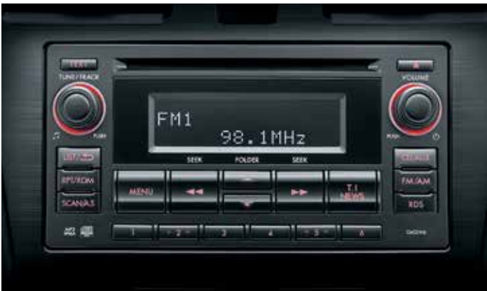
SINGLE IN-DASH CD PLAYER: SUBARU XV 2.0i