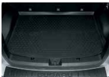
CARGO TRAY (LOW DISH)