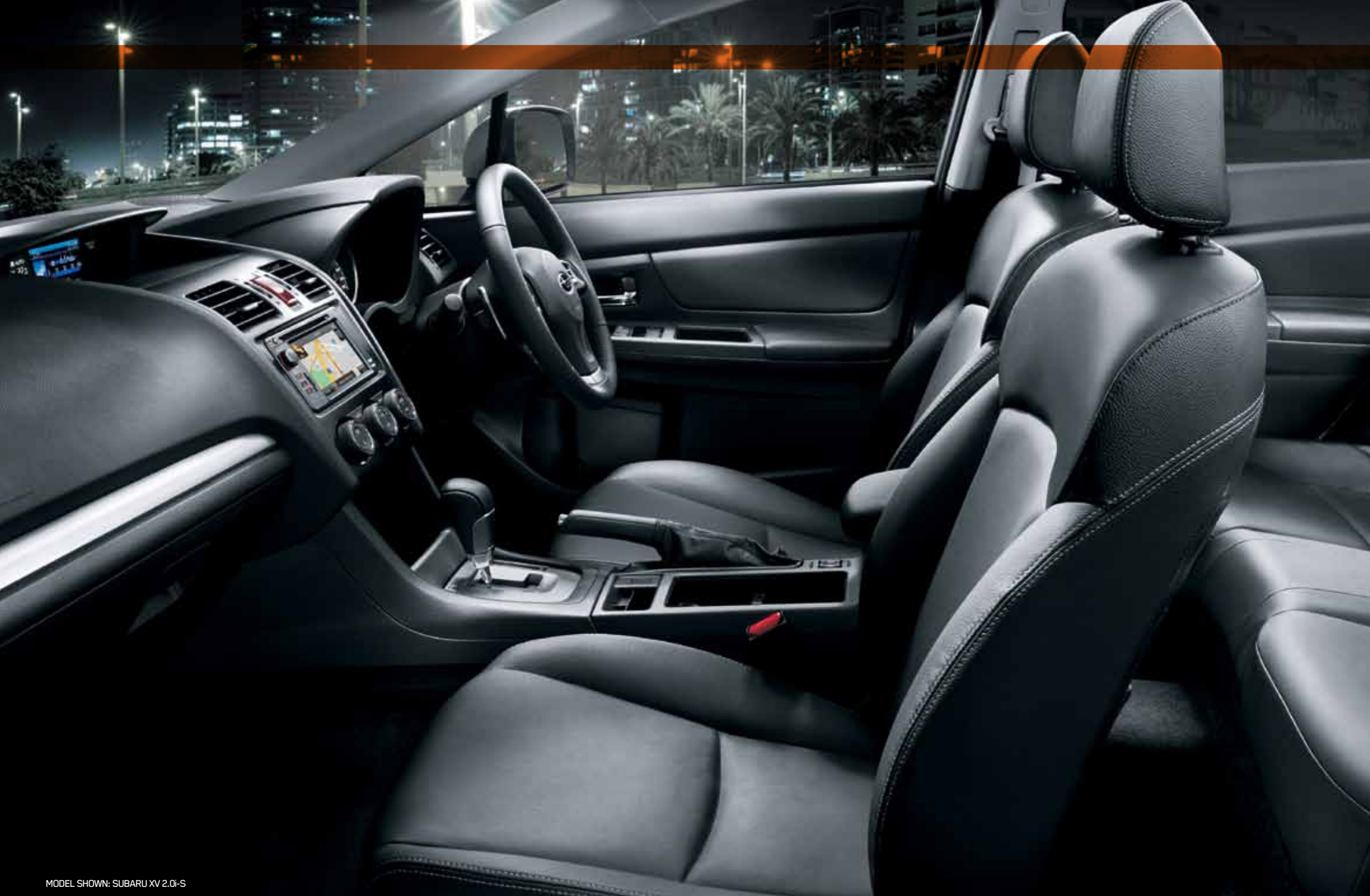
MODEL SHOWN: SUBARU XV 2.0i-S