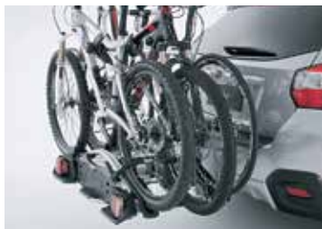
TOW BALL MOUNTED BIKE CARRIER (THREE BIKES)