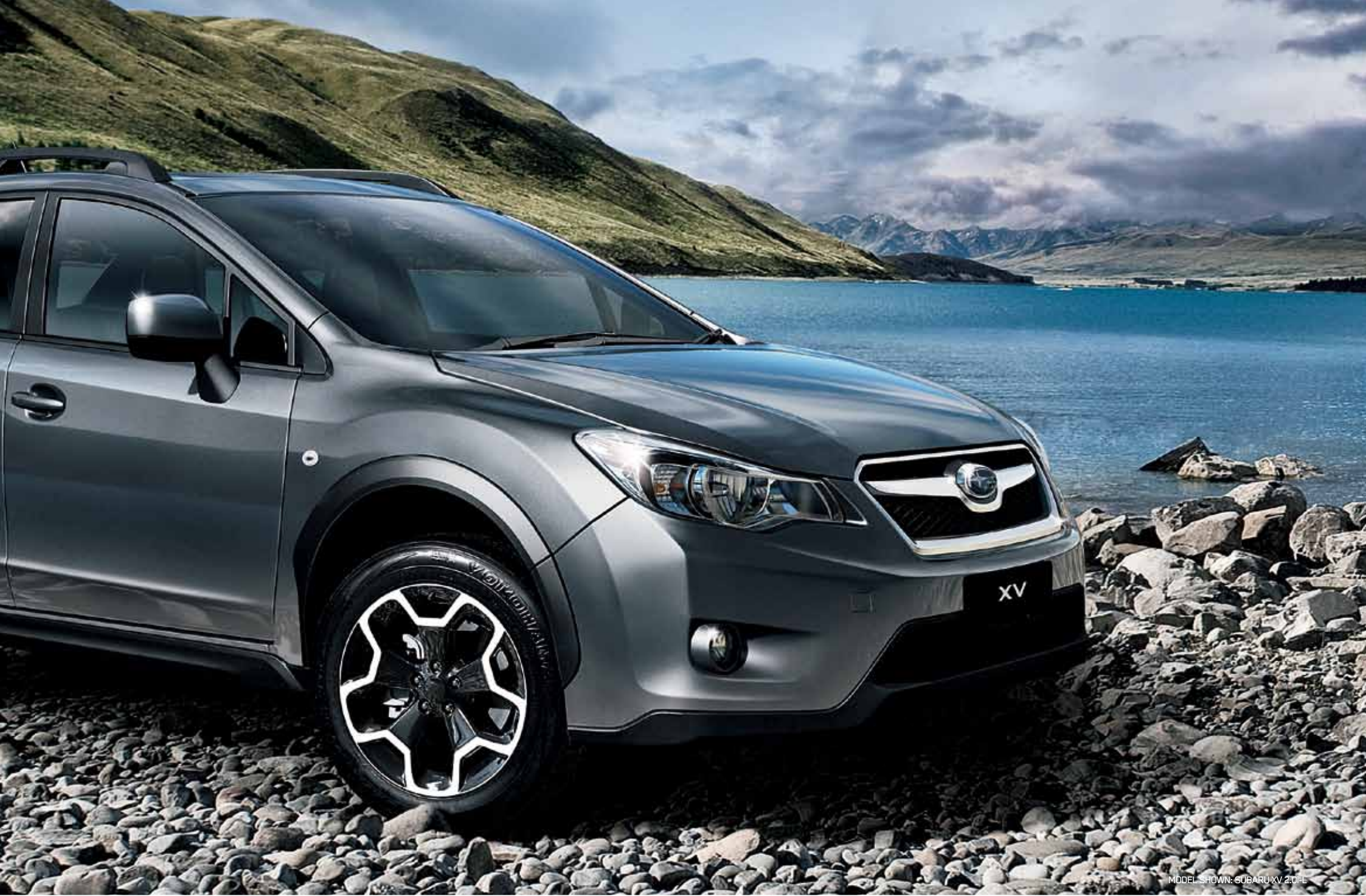
MODEL SHOWN: SUBARU XV 2.0i-L