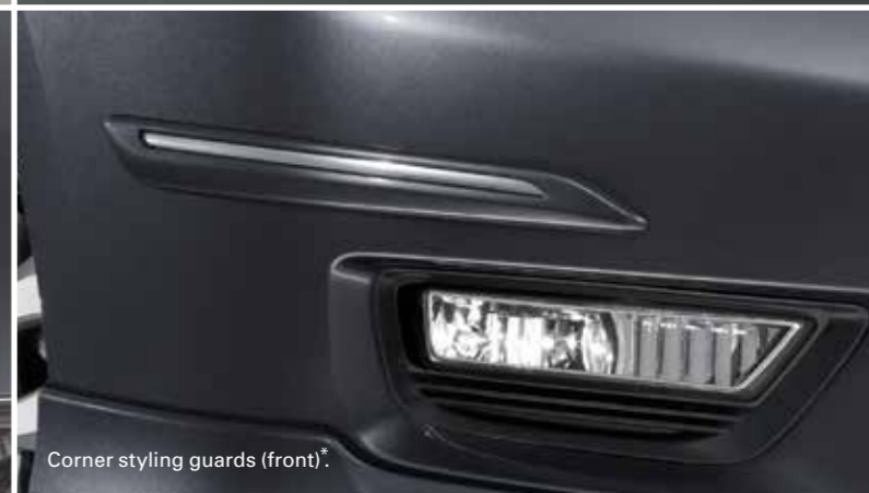
Corner styling guards (front)*.