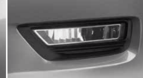
Front fog lights

As soon as a car or object is getting close, you'll hear about it thanks to the front and rear parking sensors fitted in the Accord. These sensors make parking a pleasure.