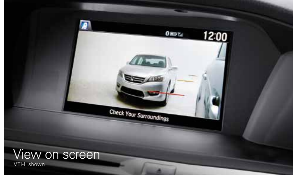
View on screen VTi-L shown

The Accord features a camera hidden in the passenger side mirror that lets you see what was previously invisible, simply by indicating to move into the left lane or manually pressing a button on the indicator stalk.