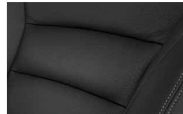
Black leather-appointed ^ seat trim – VTi-L and V6L model.