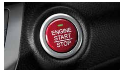
Smart keyless entry and push button start*

For greater convenience in wet weather and dull light, rain-sensing wipers and dusk-sensing headlights take over and let you focus on the drive.