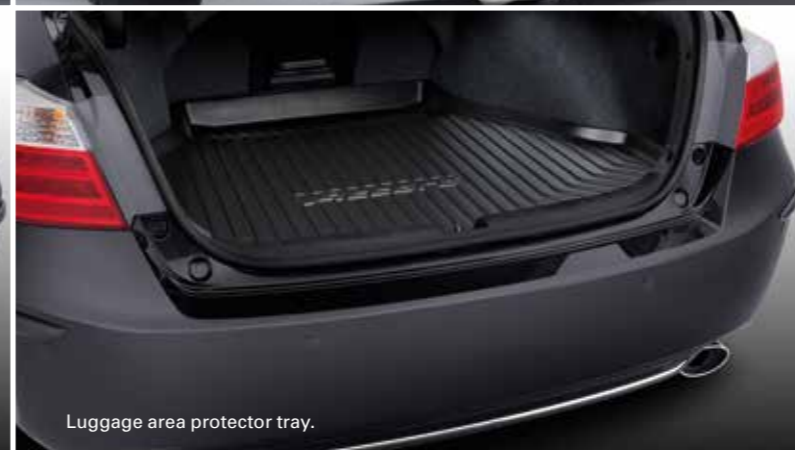
Luggage area protector tray.