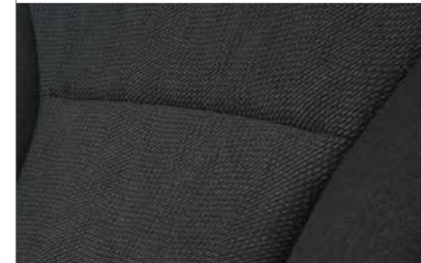
Black premium fabric seat trim – VTi-S model.