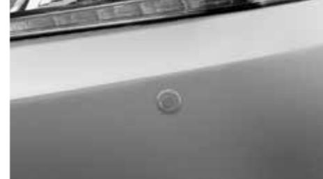
Front and rear parking sensors

While traditional blind spot monitoring systems merely alert you when a vehicle is detected, Honda's revolutionary LaneWatch uses the i-MID display to show nearly four times the view of a regular mirror, as well as 'car length' markers, so you can easily and safely switch lanes.