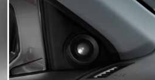
7-speaker audio system

All models come fitted with a pair of fog lights, to enhance the front grille whilst also offering a desirable safety benefit.