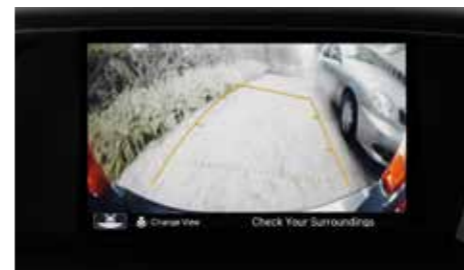
Multi-angle reversing camera

Listen to your music in perfect clarity with the 360 Watt premium audio system. This 7-speaker system includes a subwoofer, so you'll have your favourite tunes sounding just perfect.