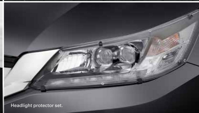
Headlight protector set.