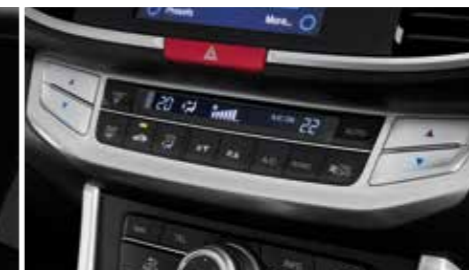
Dual-zone climate control

All Accord models feature a multi-angle rear-view camera with three different views: a high-resolution wide view, normal view and a top-down view shown on your i-MID display. Together with guidance lines that show the predicted reversing path of the vehicle, you'll always know where you're going (V6L Shown).