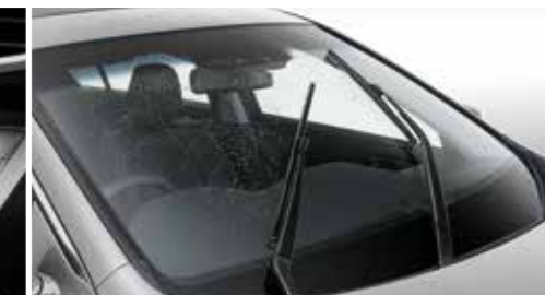
Auto wipers and headlights

Dual-zone climate control allows you and your front passenger to independently adjust the temperature. Plus, select models* feature GPS-linked solar sensors that calculate the sun's position and automatically adjust cabin temperature to compensate (V6L Shown).