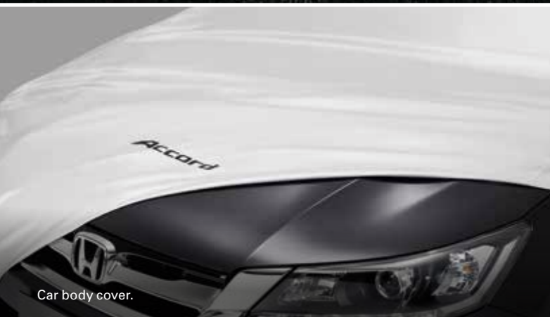
Car body cover.