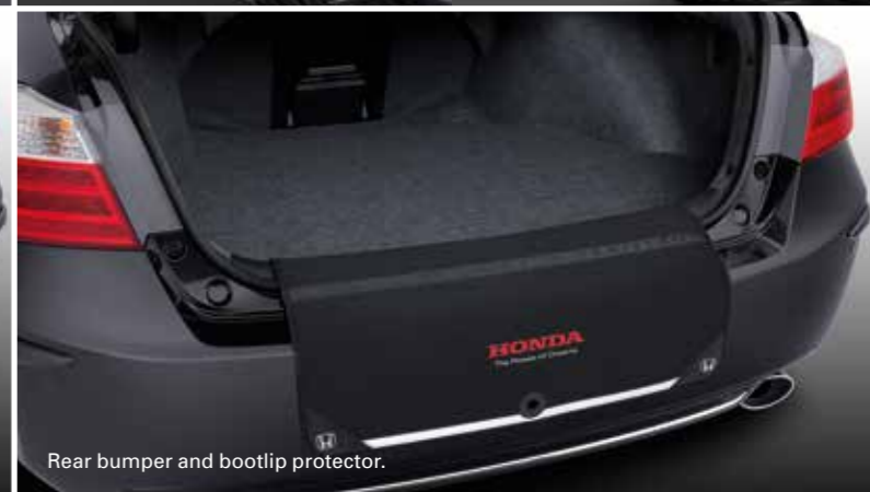
Rear bumper and bootlip protector.