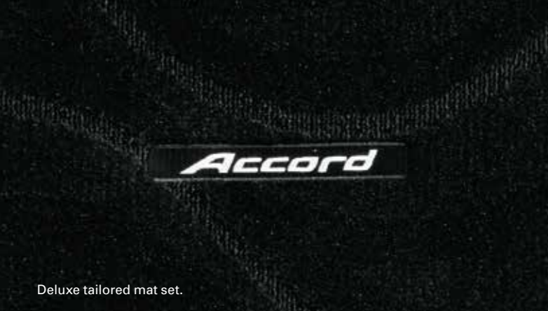
Deluxe tailored mat set.