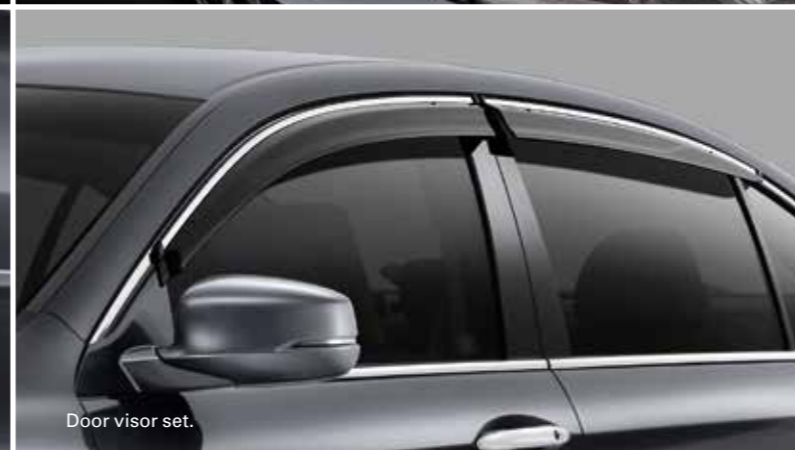
Door visor set.