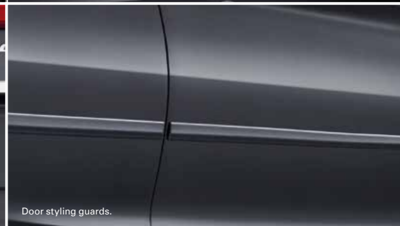
Door styling guards.