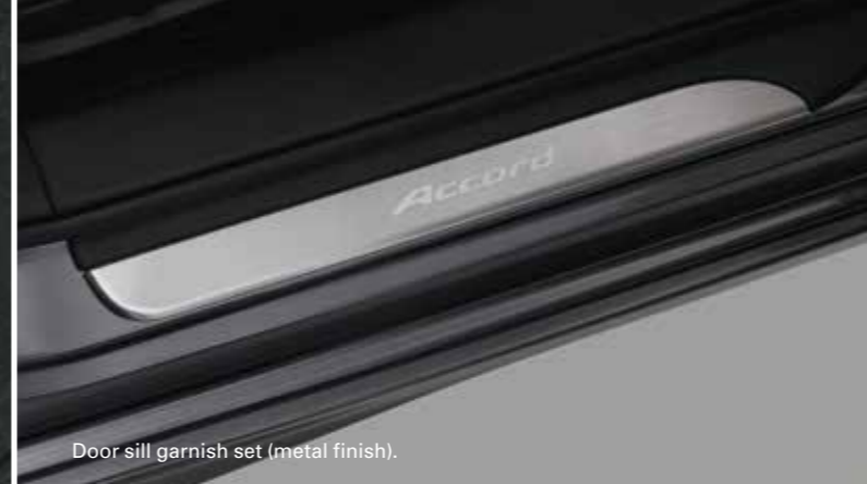
Door sill garnish set (metal finish).