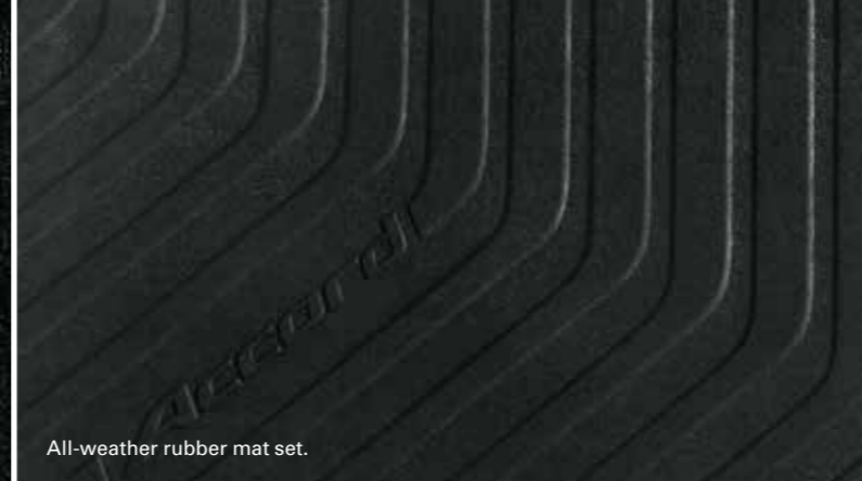
All-weather rubber mat set.