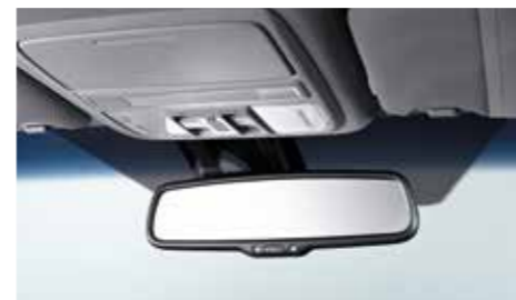
Auto-dimming rear-view mirror*

VTi-L and V6L models allow for 8-way driver's seat power adjustment. Individual memory settings stored in each key fob will automatically reset the seat back to your preferred arrangement.