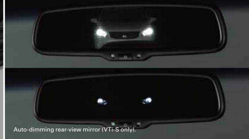
Auto-dimming rear-view mirror (VTi-S only).