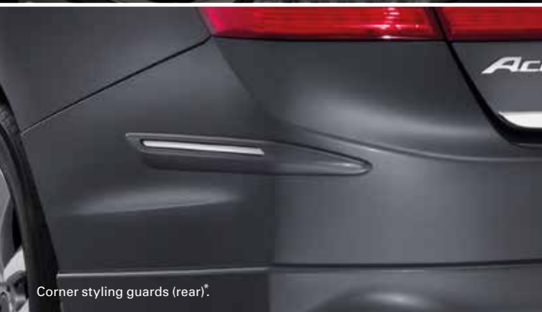
Corner styling guards (rear)*.