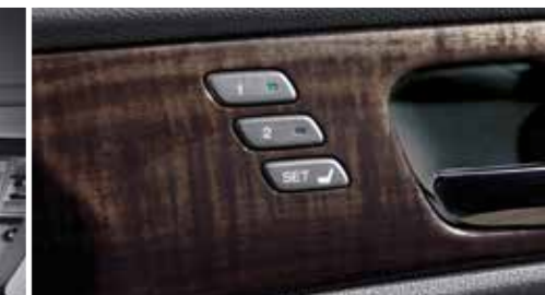
Power adjustable front seats 1

The electric sunroof in the VTi-L model and above opens the roof through slide and tilt functionality, whilst a floating liner in the sunroof lets you adjust how much light to let into the cabin.