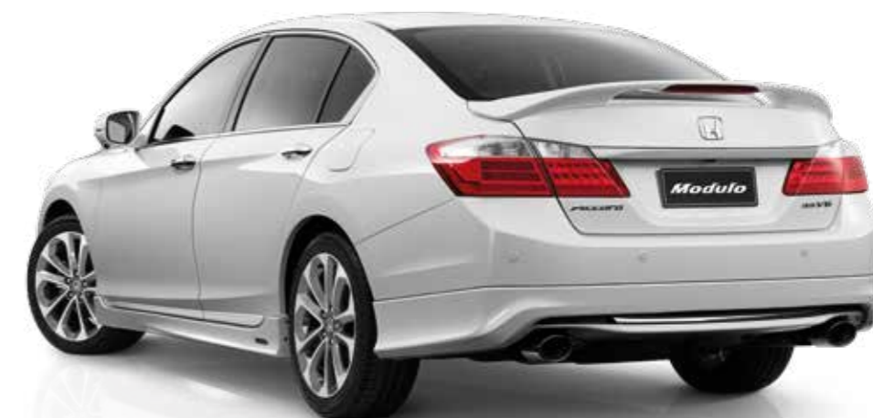
▼ Style Pack clockwise below: Door sill garnish – illuminated Boot garnish Rear spoiler – ducktail type Lower door garnish Accent lighting