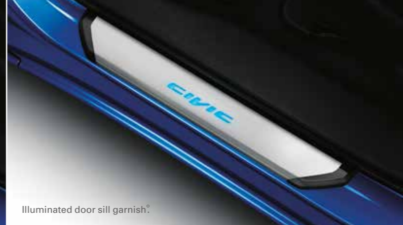
Illuminated door sill garnish*.