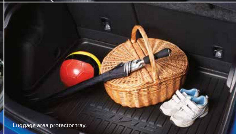
Luggage area protector tray.