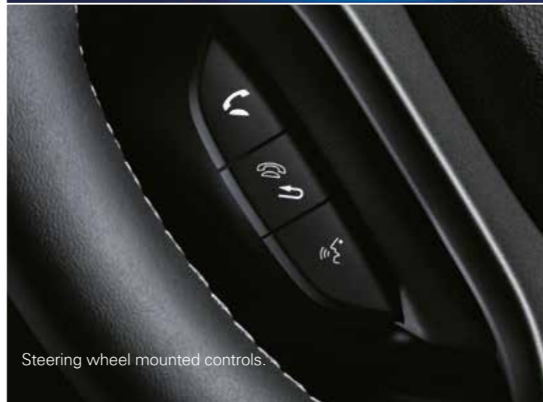
Steering wheel mounted controls.

Answer a call using the steering wheel mounted controls with Bluetooth ® ; send a text with Siri † ; or even watch video content when your car is stationary ‡ . Now you have the whole world at your fingertips.