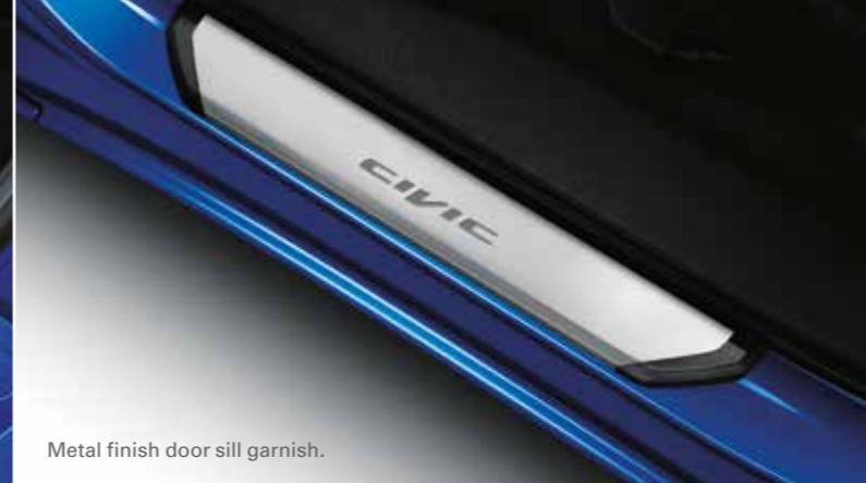
Metal finish door sill garnish.