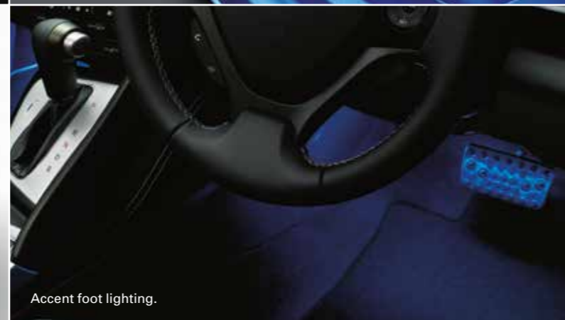
Accent foot lighting.