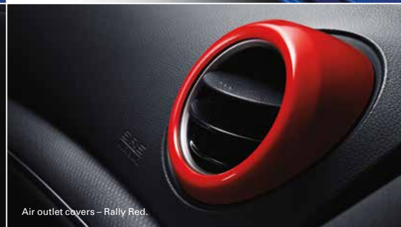
Air outlet covers – Rally Red.