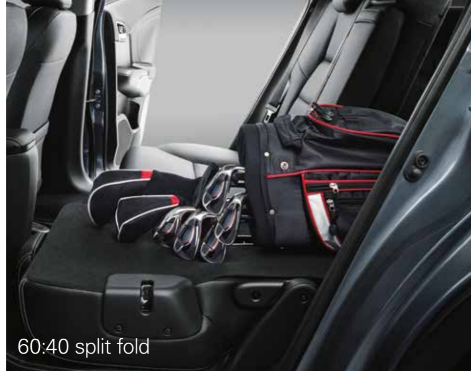
60:40 split fold