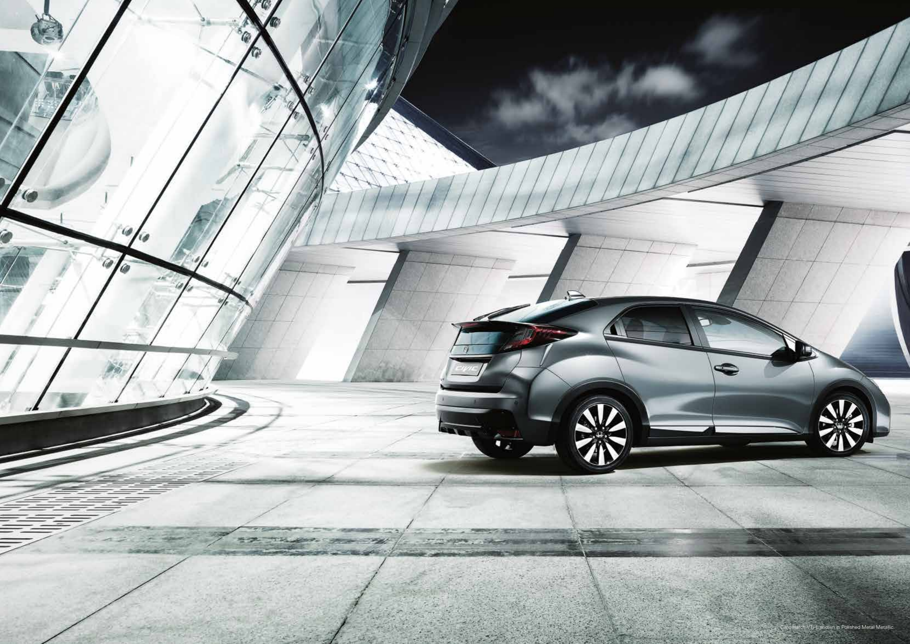
Civic Hatch VTi-L shown in Polished Metal Metallic.