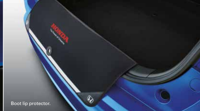
Boot lip protector.