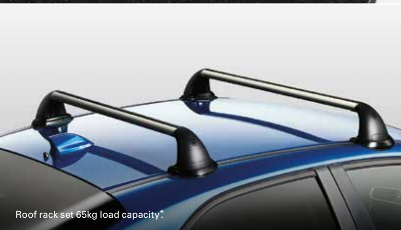
Roof rack set 65kg load capacity*.