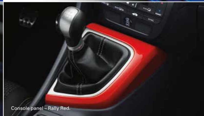
Console panel – Rally Red.