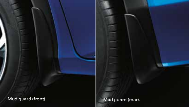
Mud guard (front).