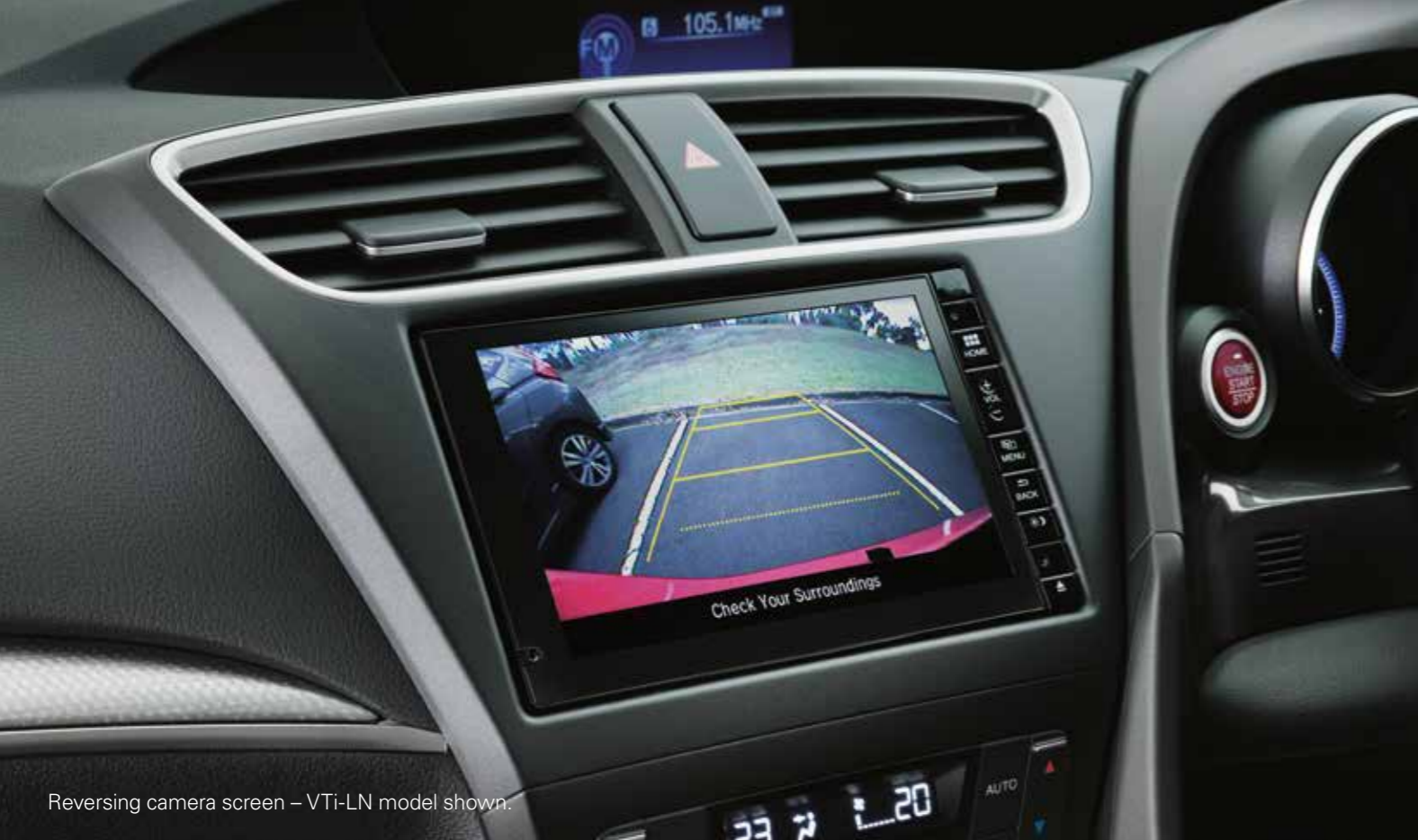
Reversing camera screen – VTi-LN model shown.