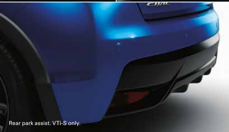
Rear park assist. VTi-S only.