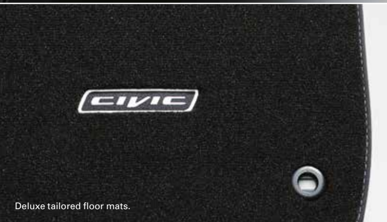
Deluxe tailored floor mats.