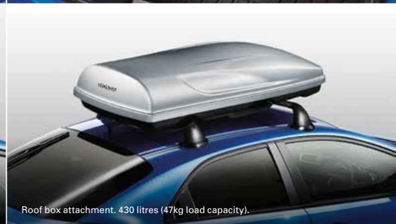
Roof box attachment. 430 litres (47kg load capacity).