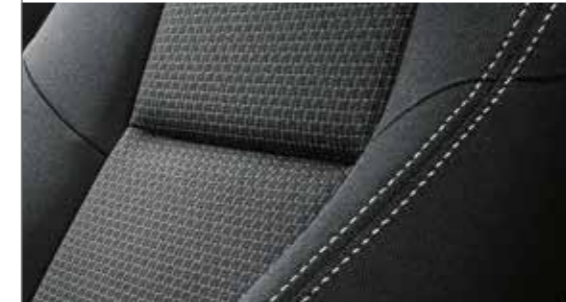
Black fabric seat trim – VTi-S and VTi-L models.