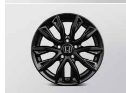
▲ Civic Hatch VTi-L shown in Brilliant Sporty Blue fitted with Sports Pack and 17-inch 'Neon' alloy accessory wheels ^

And being genuine, you know they'll fit perfectly and perform flawlessly. For more information, contact your local Dealer or visit honda.com.au/civichatch