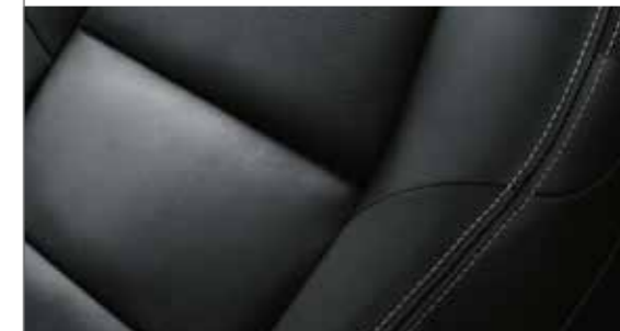
Black leather-appointed^ seat trim – VTi-LN models.