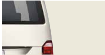
Candy White | Solid paint finish | B4B4