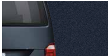
Starlight Blue | Metallic paint finish | 3S3S