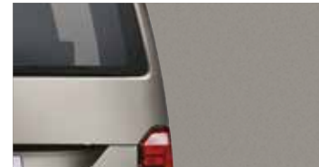
Mojave Beige | Metallic paint finish | 1B1B