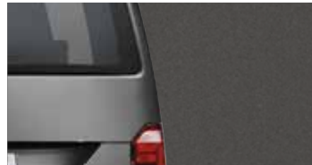
Indium Grey | Metallic paint finish | X3X3