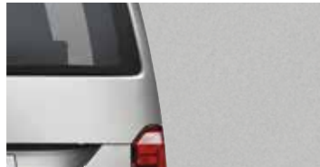
Reflex Silver | Metallic paint finish | 8E8E