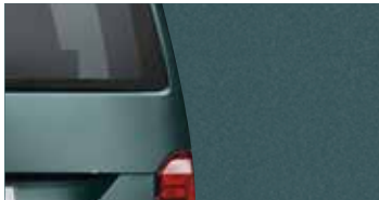
Bamboo Green | Metallic paint finish | 3T3T