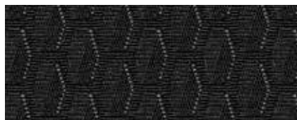
Kutamo Cloth seat upholstery | Titanium Black / Moon Rock Grey