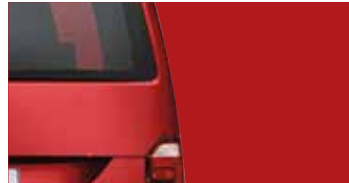
Cherry Red | Solid paint finish | 4B4B