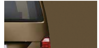
Chestnut Brown | Metallic paint finish | H4H4