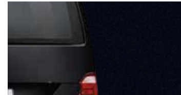
Deep Black | Pearl effect paint finish | 2T2T