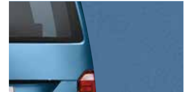
Acapulco Blue | Metallic paint finish | 2W2W