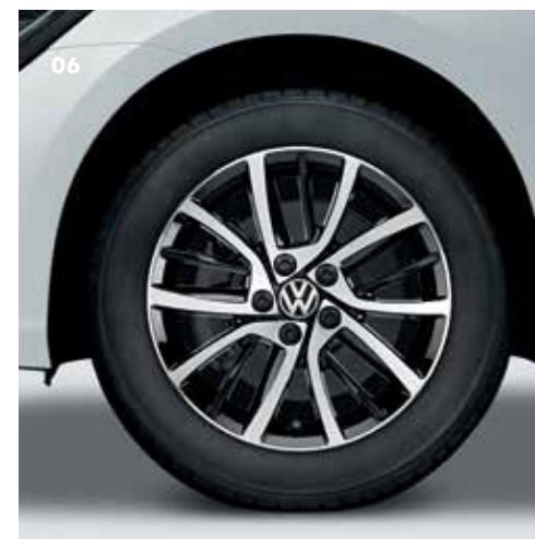
06 Blade, alloy wheel 17 inch, Black gloss machined Part. no. 5G0071497FZZ