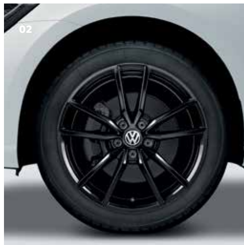
02 Pretoria, alloy wheel 18 inch, Black gloss Part. no. 5G0071498AAX1