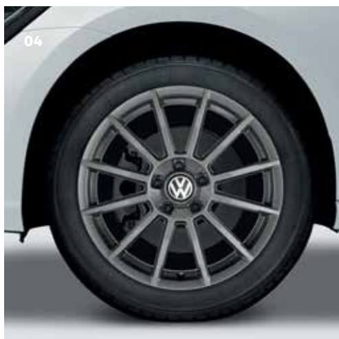
04 Rotary, alloy wheel 18 inch, Anthracite Part. no. 5G007149816Z