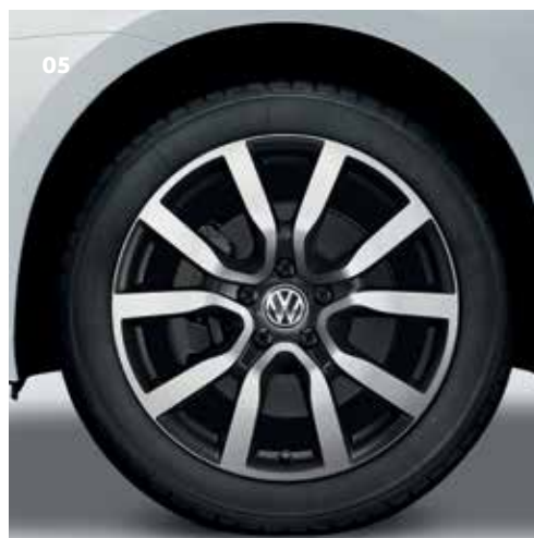
05 Serron, alloy wheel 18 inch, Black gloss machined Part. no. 5K0071498BAX1