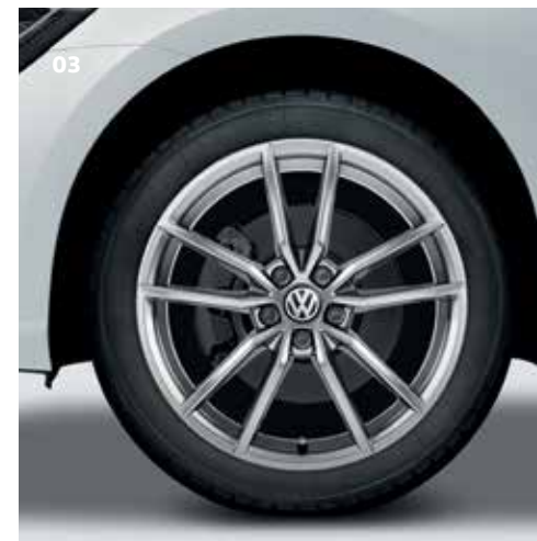
03 Pretoria, alloy wheel 18 inch, Sterling silver Part. no. 5G0071498A88Z