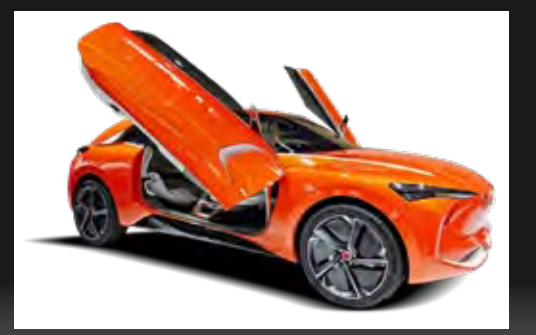
HAVAL concept vehicle