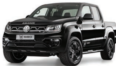
Deep Black (MP)*