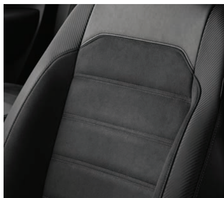
Art Velour Trim

Two-colour microfleece seat upholstery in Palladium/Titanium Black