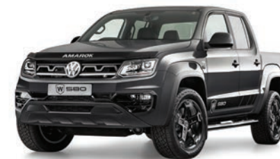
Indium Grey (MP)*