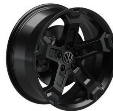
20" x 9" forged 'Clayton' Alloy Wheels

Two-colour Vienna Leather# upholstery in Palladium Grey /Titanium Black