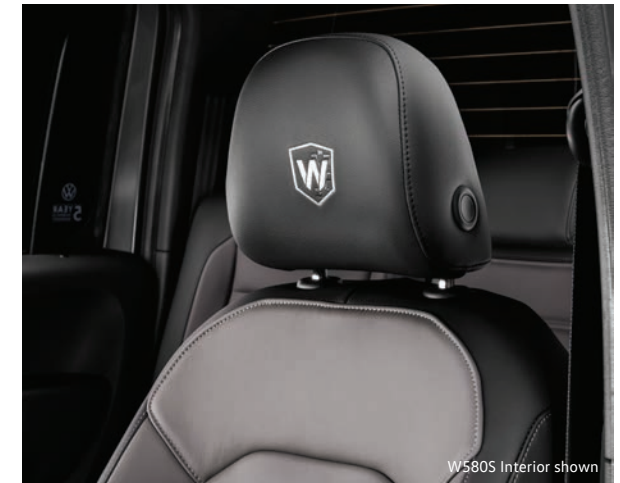
W580S Interior shown