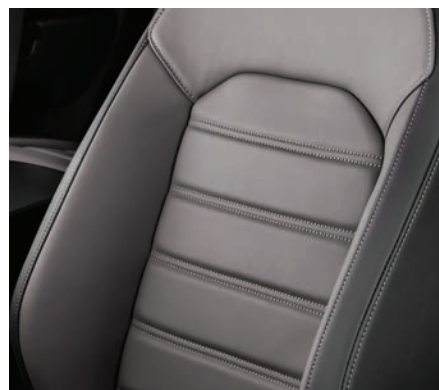
Vienna Leather# Trim

Two-colour microfleece seat upholstery in Palladium/Titanium Black