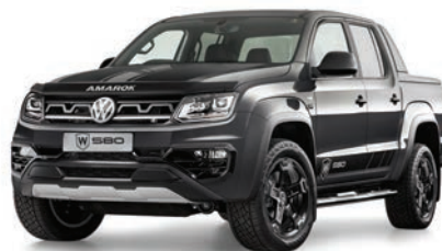
Indium Grey (PE)