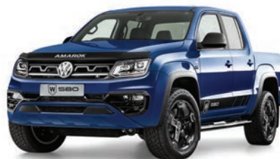
Ravenna Blue (PE)*