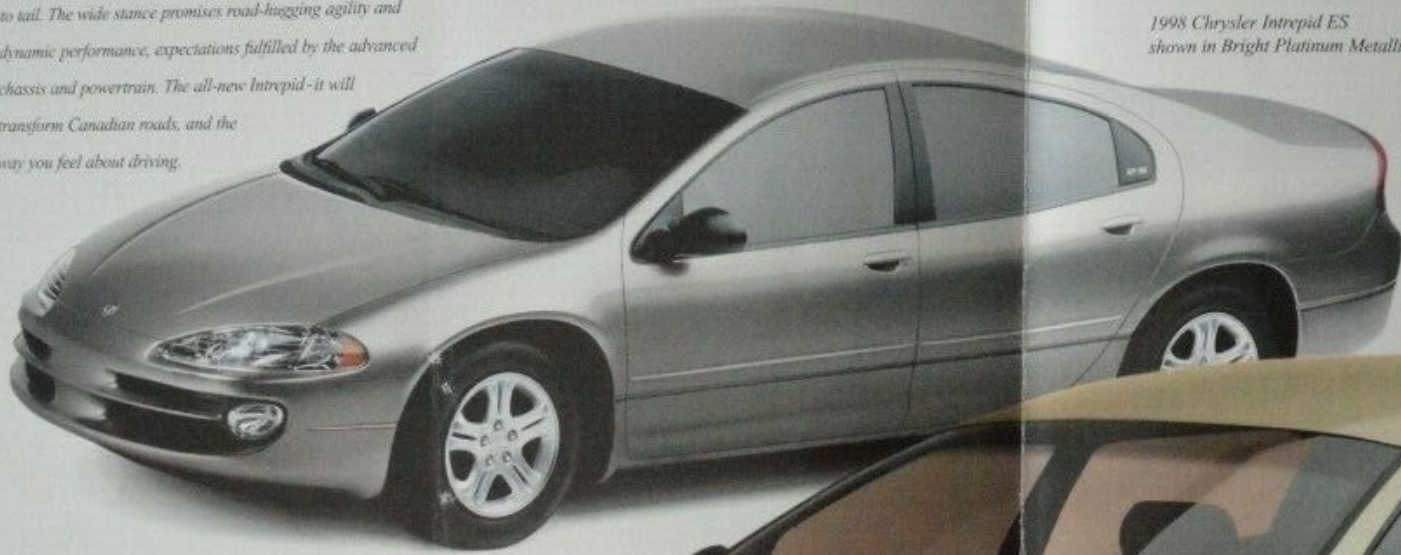
1998 Chrysler Intrepid ES shown in Bright Platinum Metallic

Dynamic, purposeful and stimulating, 1998 Chrysler Intrepid benefits from an enhanced Cab-Forward design, resulting in a striking silhouette that flows cleanly from nose to tail. The wide stance promises road-hugging agility and dynamic performance, expectations fulfilled by the advanced chassis and powertrain. The all-new Intrepid - it will transform Canadian roads, and the way you feel about driving.