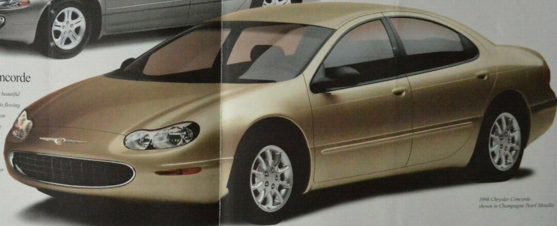
1998 Chrysler Concorde shown in Champagne Pearl Metallic

1998 Chrysler Concorde... the most beautiful expression yet of Cab-Forward design. Its flowing exterior lines create a new sense of motion even when the car is standing still, while the textured oval grille and sculpted quad projector-type headlamps bear the classic styling influences of Aston Martin and Ferrari. The all-new Chrysler Concorde - it will change your world.