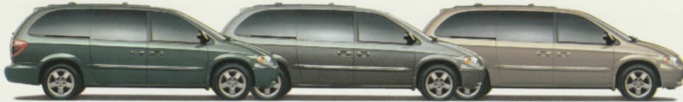
Onyx Green Pearl Metallic