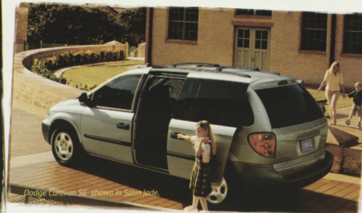
Dodge Caravan SE shown in Satin Jade.

Exceptional value has always been part of the winning Dodge Caravan formula. For 2003, Caravan SE with the 28D Package continues to be one of our most popular models, bringing together a long list of standard equipment, including: speed control and tilt steering, power mirrors, windows and door locks, 3.3-litre V6 engine, four-speed automatic transmission, air conditioning, sunscreen glass, seven-passenger seating with Easy Out® Roller Seats, rear seatback grocery bag hooks, Sentry Key® Engine Immobilizer and more.