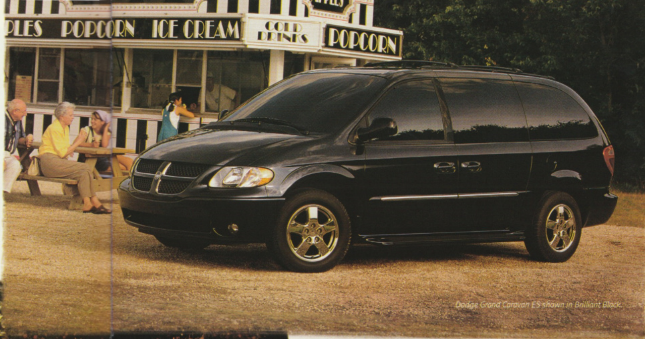
Dodge Grand Caravan ES shown in Brilliant Black.

Great-looking style. Rugged dependability. Kid-loving comfort. Advanced safety features. Unbelievable versatility. They're all hallmarks of every Dodge Caravan. And with a great selection of models to choose from, you can get the right combination for your lifestyle.