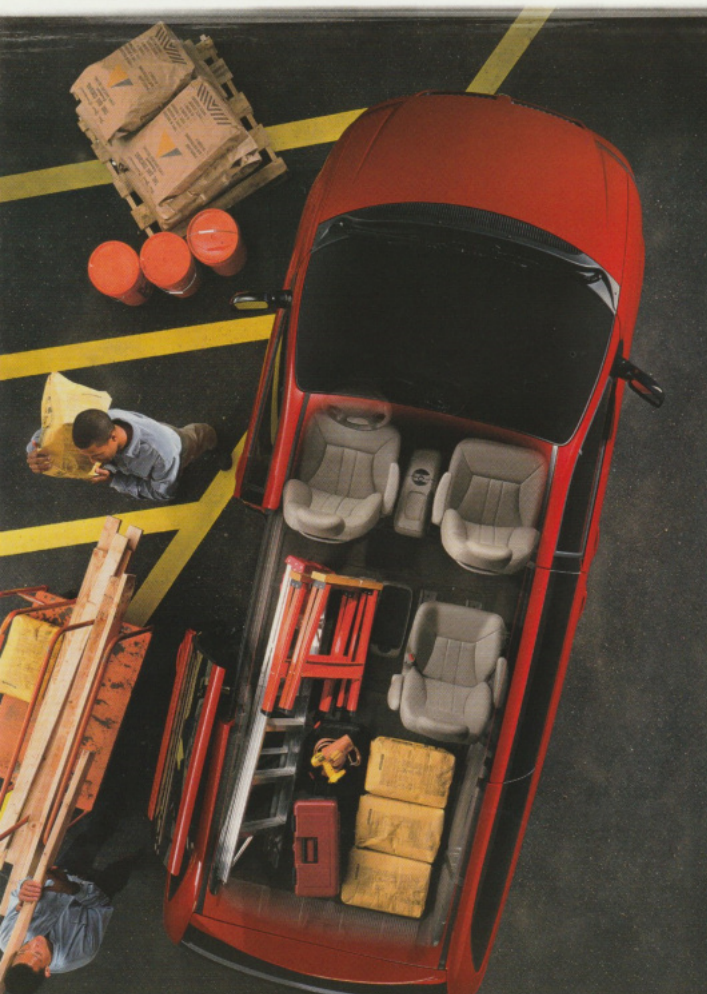
Dodge Caravan seating adapts to handle virtually any combination of passengers and cargo.* *Remember to properly secure all cargo.

The rear cargo organizer, is available on Grand Caravan and folds up in seconds to provide a variety of compartments that help keep things secure. Another Caravan innovation, it's the most flexible and adaptable one in its class.