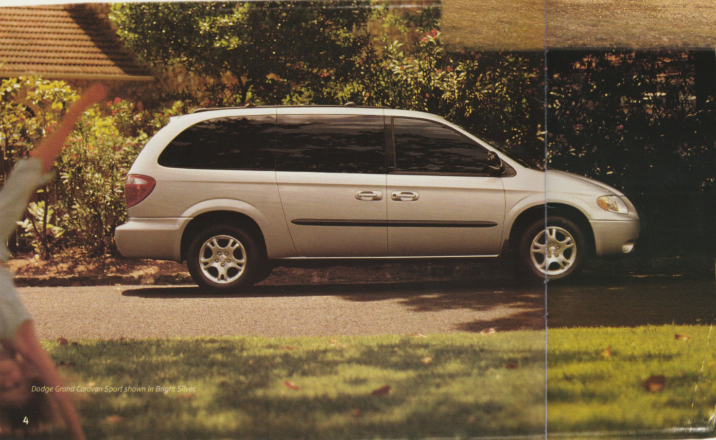
Dodge Grand Caravan Sport shown in Bright Silver.