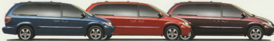
Patriot Blue Pearl Coat