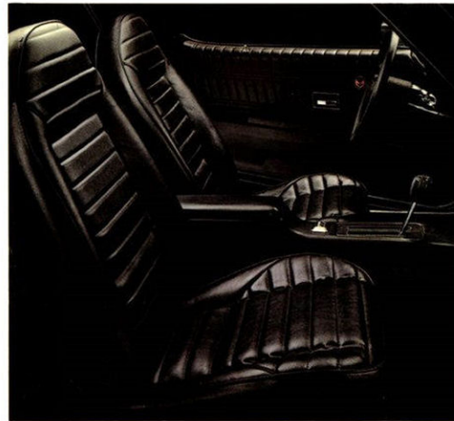
Standard Firebird, Formula and Trans Am interior. Shown in black—also available in saddle and white.