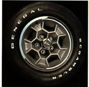
Available Honeycomb wheels.

AVAILABLE EQUIPMENT Luggage compartment, glove box and I.P. courtesy lamp group. Turbo Hydra-matic transmission. Whitewall tires—white-letter tires on Formula, AM, AM/FM or AM/FM stereo radio. Wheel trim rings (n/a Esprit, std. Trans Am). Power steering (std. Trans Am). Vinyl body side moldings. Door edge guards. Rear bumper guards. Large Firebird decal (width of hood) on Trans Am.