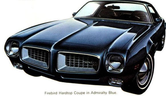
Firebird Hardtop Coupe in Admiralty Blue.

That's our way with sports cars. Now... are you ready to get serious?