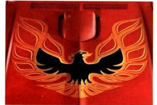
Available Trans Am hood decal.

Trans Am Features Distinctive from Firebird Black-textured grille. Full-width rear deck spoiler. Wheel opening air deflectors. Front fender air extractors. Trans Am decal on front fender and spoiler. 15-inch Rally II wheels with trim rings. 455 decal on hood. Right- and left-hand body-colored mirrors (left-hand remote controlled). Concealed wipers.