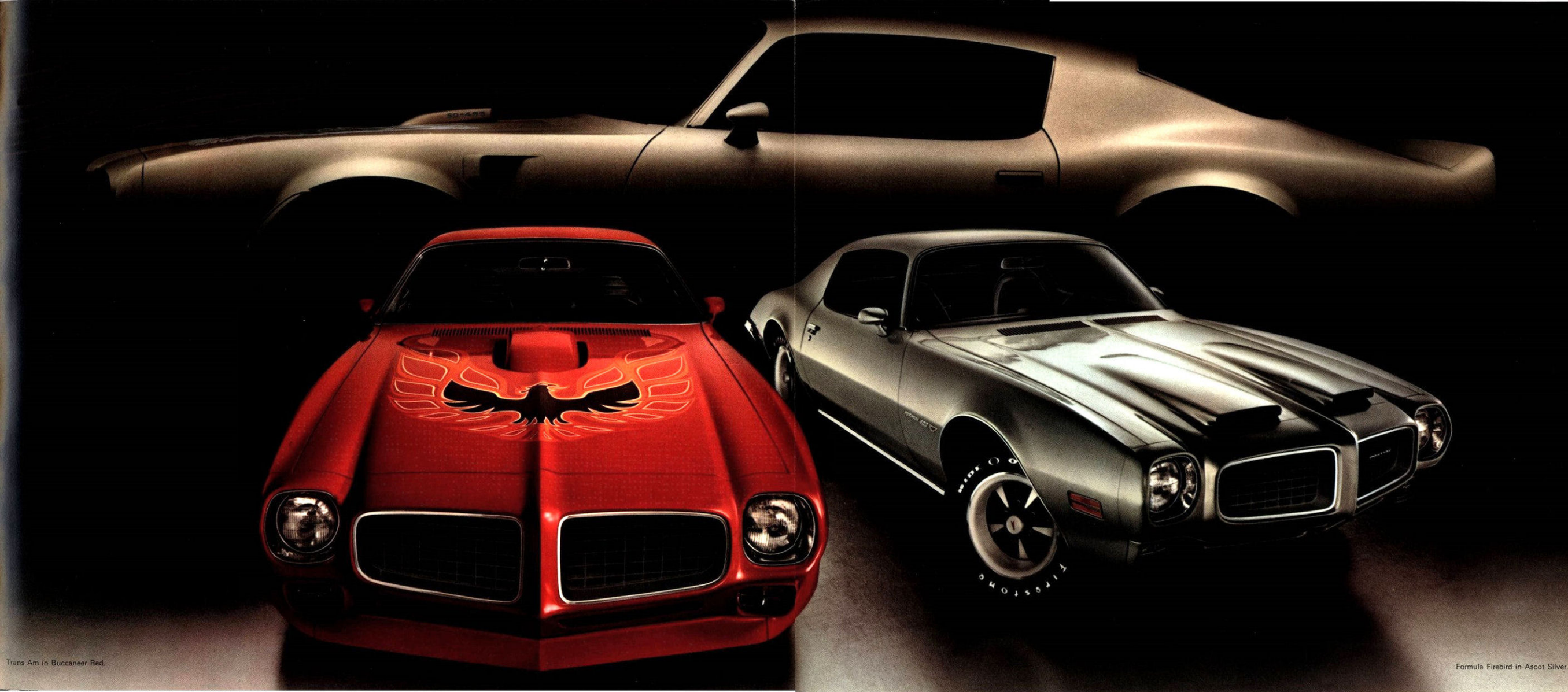
Trans Am in Buccaneer Red.

Shown on the cars on these pages are some of the options and accessories offered by Pontiac at extra cost.