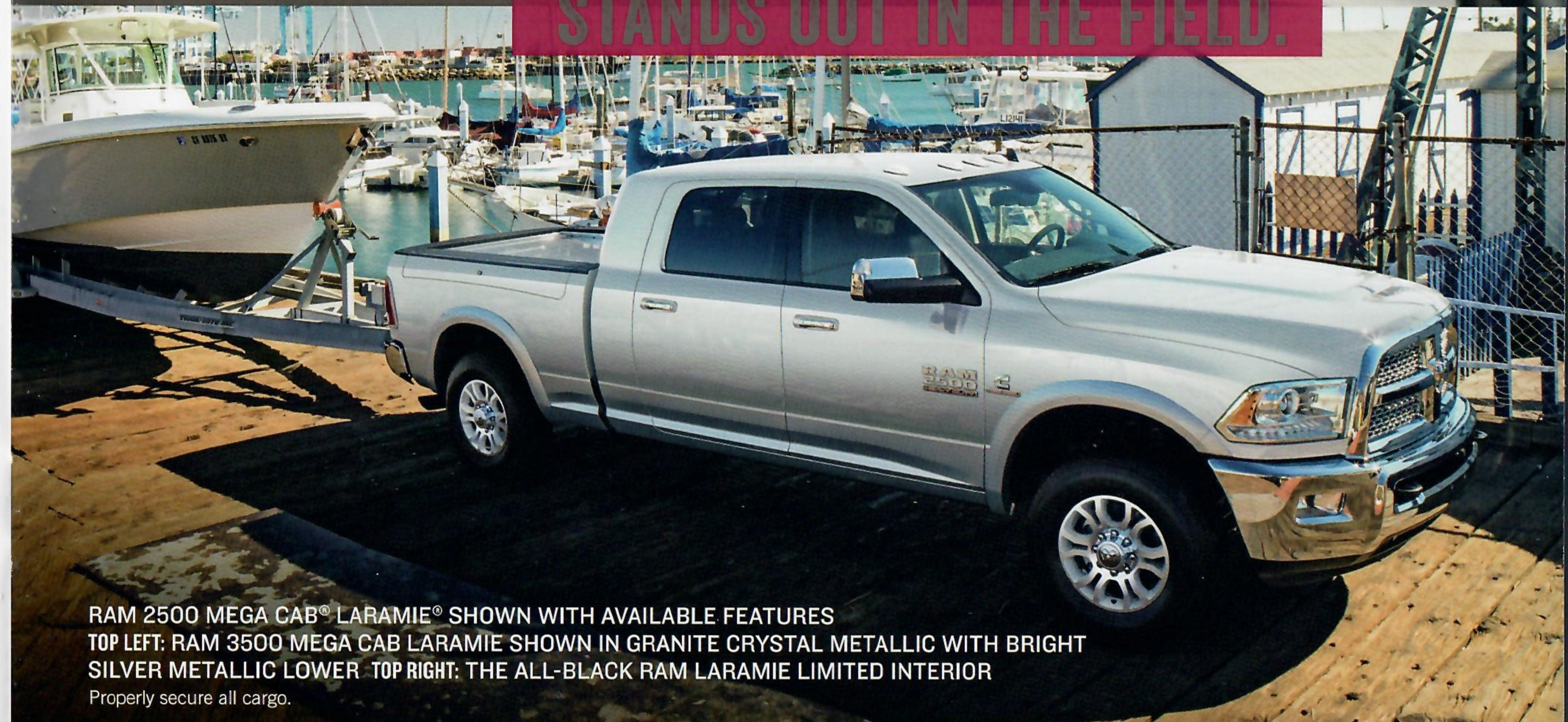
RAM 2500 MEGA CAB® LARAMIE® SHOWN WITH AVAILABLE FEATURES TOP LEFT: RAM 3500 MEGA CAB LARAMIE SHOWN IN GRANITE CRYSTAL METALLIC WITH BRIGHT SILVER METALLIC LOWER TOP RIGHT: THE ALL-BLACK RAM LARAMIE LIMITED INTERIOR Properly secure all cargo.

VERSATILE. ADAPTIVE. STANDS OUT IN THE FIELD.