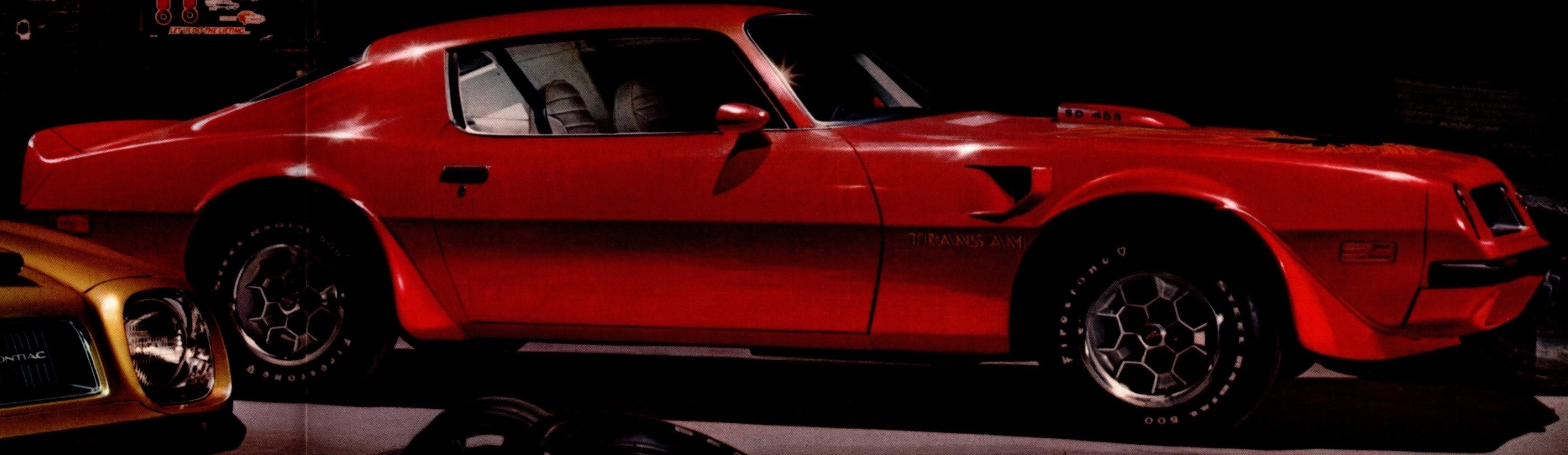
Formula Firebird in Denver Gold.