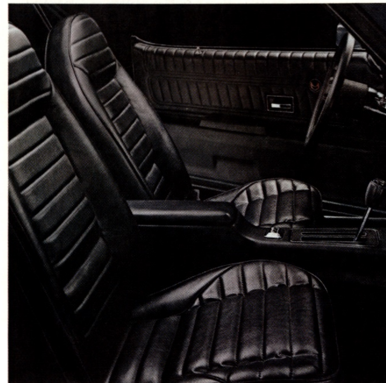
Standard Firebird, Formula Firebird and Firebird Trans Am interior. Shown in black—also available in white and saddle.

There are many tough decisions in life. You're about to make one of them. Because there are four fantastic new Pontiac Firebirds this year . . . and you can only drive one at a time.