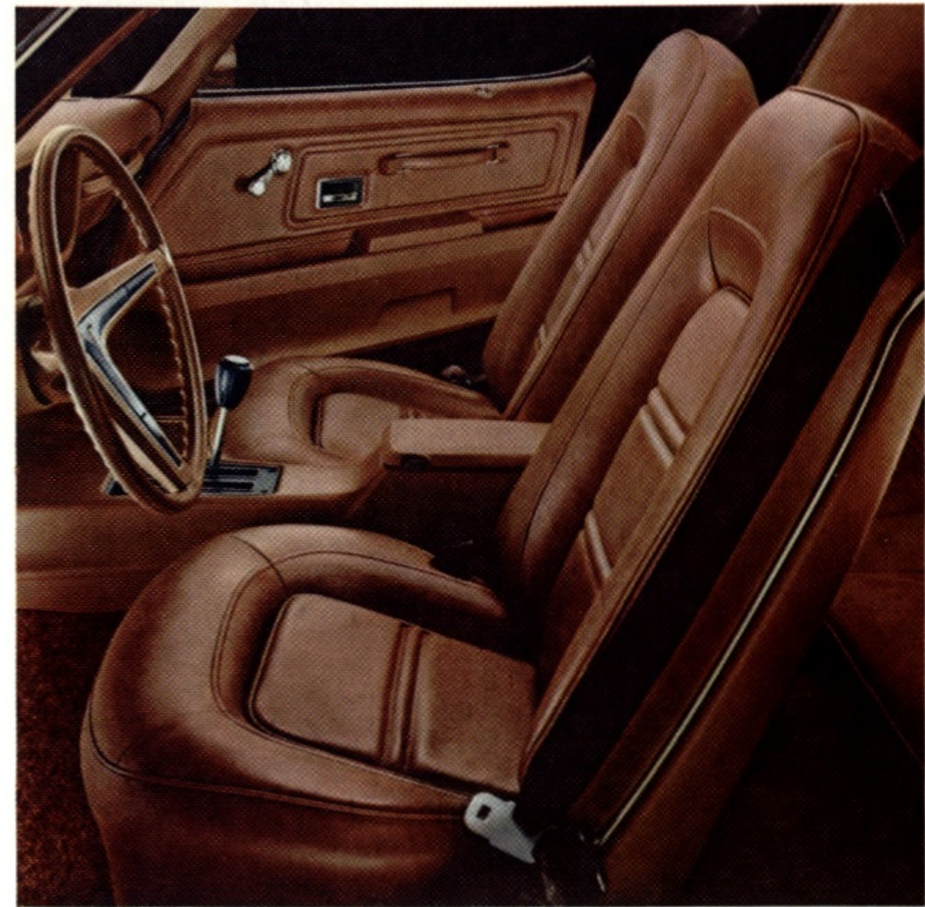
Custom interior—standard on Firebird Esprit, available on Formula Firebird and Firebird Trans Am. Shown in saddle—also available in red, white, blue, green and black.

Easy, now. Don't make your decision yet.