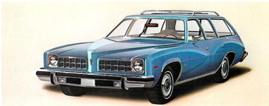
3-Seat LeMans Safari Wagon.

LeMans Safari or Grand LeMans Safari. Either way, you'll get the room of a wagon...and the performance of a Pontiac.