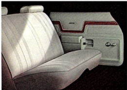
LeMans Safari's standard all-Morrokide upholstery. Shown in white—also available in saddle, blue, green and burgundy.

What's so grand about our brand-new Grand LeMans Safari wagon?