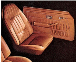
Astre Safari's standard all-Morrokide upholstery. Shown in saddle —also available in black, burgundy, sandstone and white.