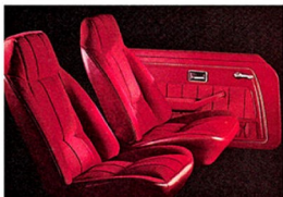
This is the standard cloth and Morrokide upholstery in Astre SJ Safari. Shown in burgundy—also available in blue and black.