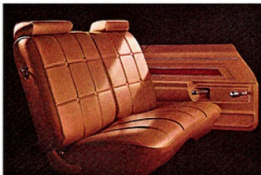
Sit back and relax. Catalina Safari's all-Morrokide upholstery. Shown in saddle—also available in blue, green and burgundy.