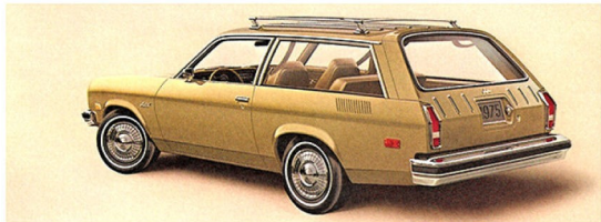
Astre Safari Wagon.