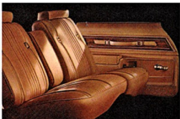
Grand LeMans Safari's available 60/40 seat. Shown in saddle—also available in white, blue and burgundy.