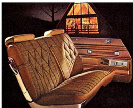
All this elegance in a station wagon? Grand Safari's standard cloth and Morrokide upholstery in saddle tweed.

1975 Grand Safari or Catalina Safari. Both are full-sized wagons that never forget they're Pontiacs.