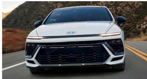
Seamless LED Horizon Lamp