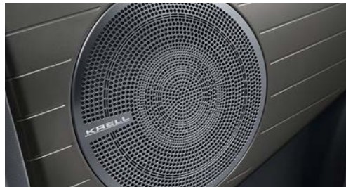
Krell® premium audio system