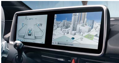
12.3" instrument cluster and touchscreen displays