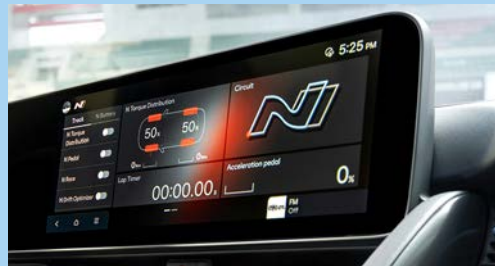
12.3" N technology display