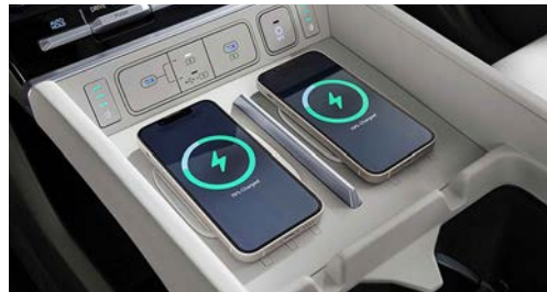
Bi-directional multi-console storage space