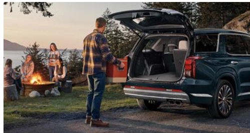
Hands-free smart liftgate with auto open