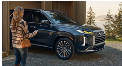
Remote Smart Parking Assist