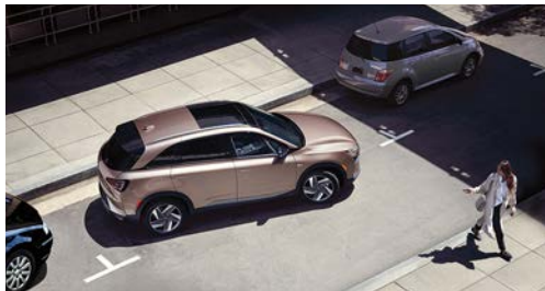
Remote Smart Parking Assist