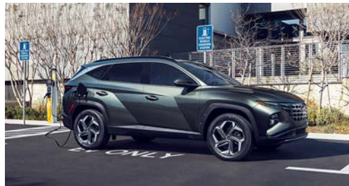
Tucson Plug-in Hybrid

5-Star Safety Ratings 2023 Hyundai TUCSON ICE FWD 3