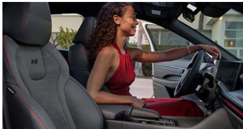
Class-leading front seat headroom and legroom