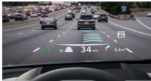
Premium Head-up Display with Augmented Reality