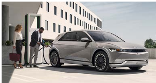
350-kW Ultra-fast DC Fast Charging capability

5-Star Safety Ratings 2023 Hyundai IONIQ 5 AWD 9