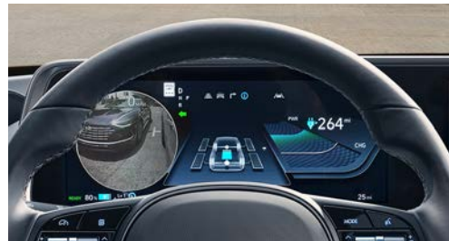
Blind-Spot View Monitor