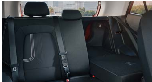
60/40 split-folding rear seats