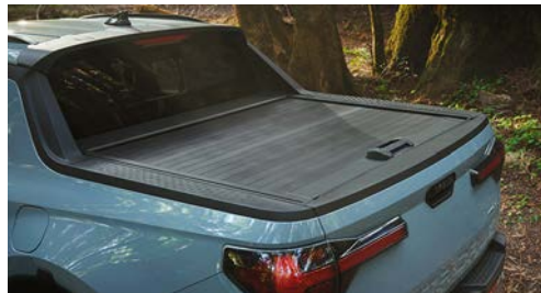
Lockable tonneau cover