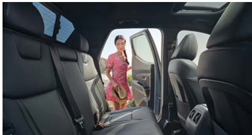
60/40 split rear seats with underseat storage