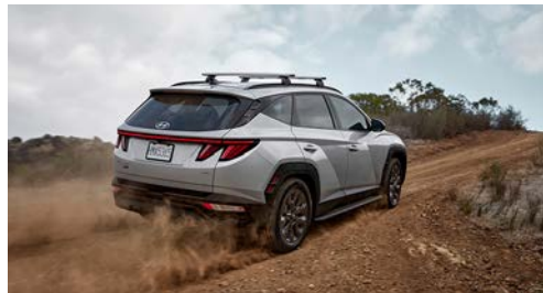
Tucson XRT with HTRAC All Wheel Drive