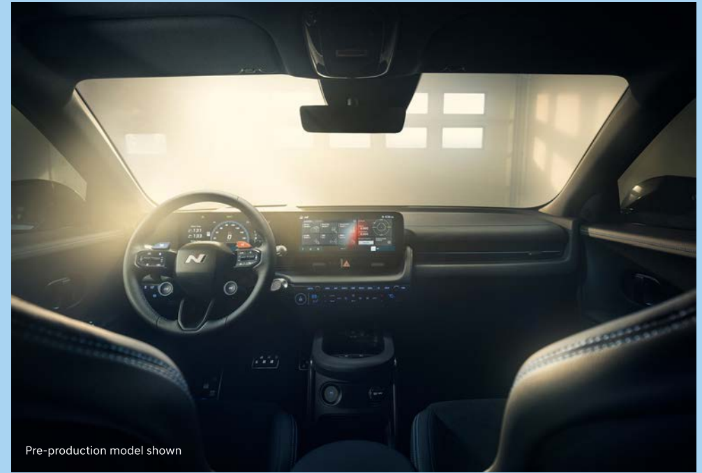
Pre-production model shown