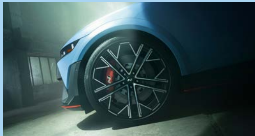
Pirelli P ZERO™ tires on forged 21" wheels