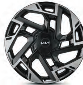
19" alloy wheels