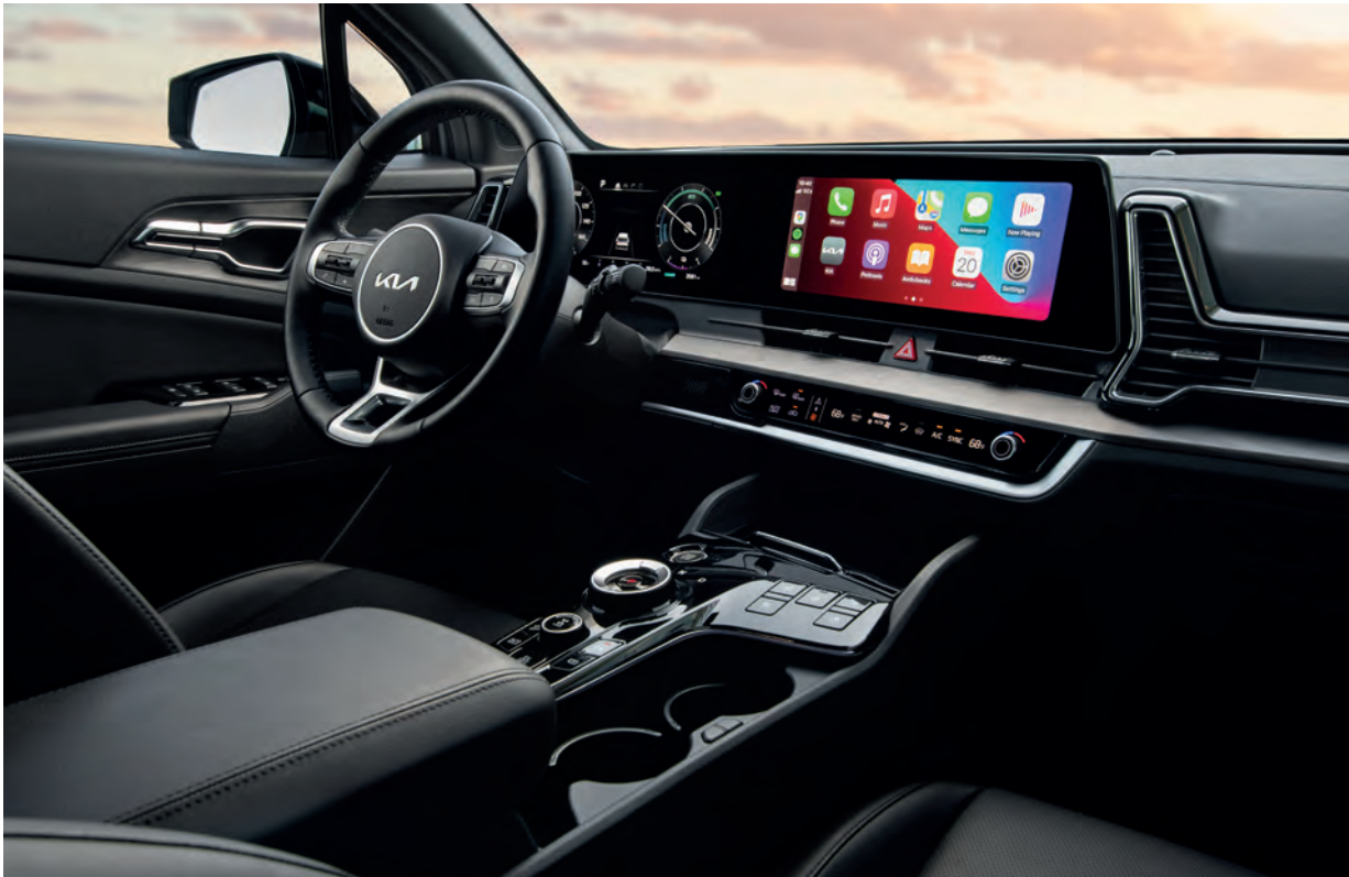
A 12.3" multimedia interface gives you at-a-glance control of navigation, audio and various vehicle system functions.