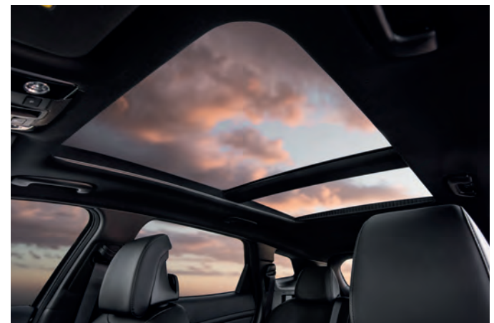
The panoramic sunroof lets the sunshine in for a brighter and airier cabin.