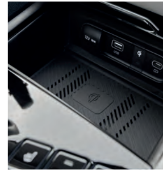
Wireless charging keeps your smartphone charged while you're on the road.