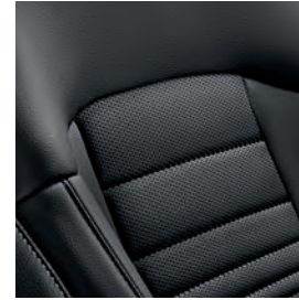
EX Premium, SX Black quilted leather (synthetic)