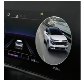
Blind view monitor displays the blind spot in the direction your turn signal is indicating.*