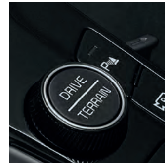
Terrain mode helps provide improved traction and control in mud, snow and sand.