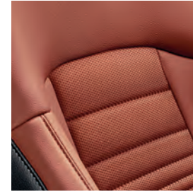
SX Carmine Red quilted leather (synthetic)