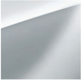
Snow White Pearl