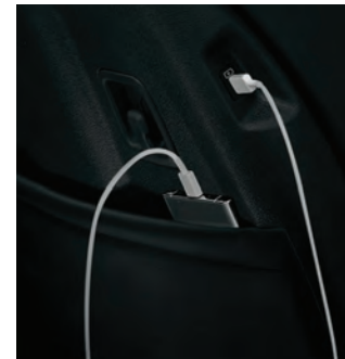
USB charging ports for rear passengers are located in the seatbacks ahead of them.