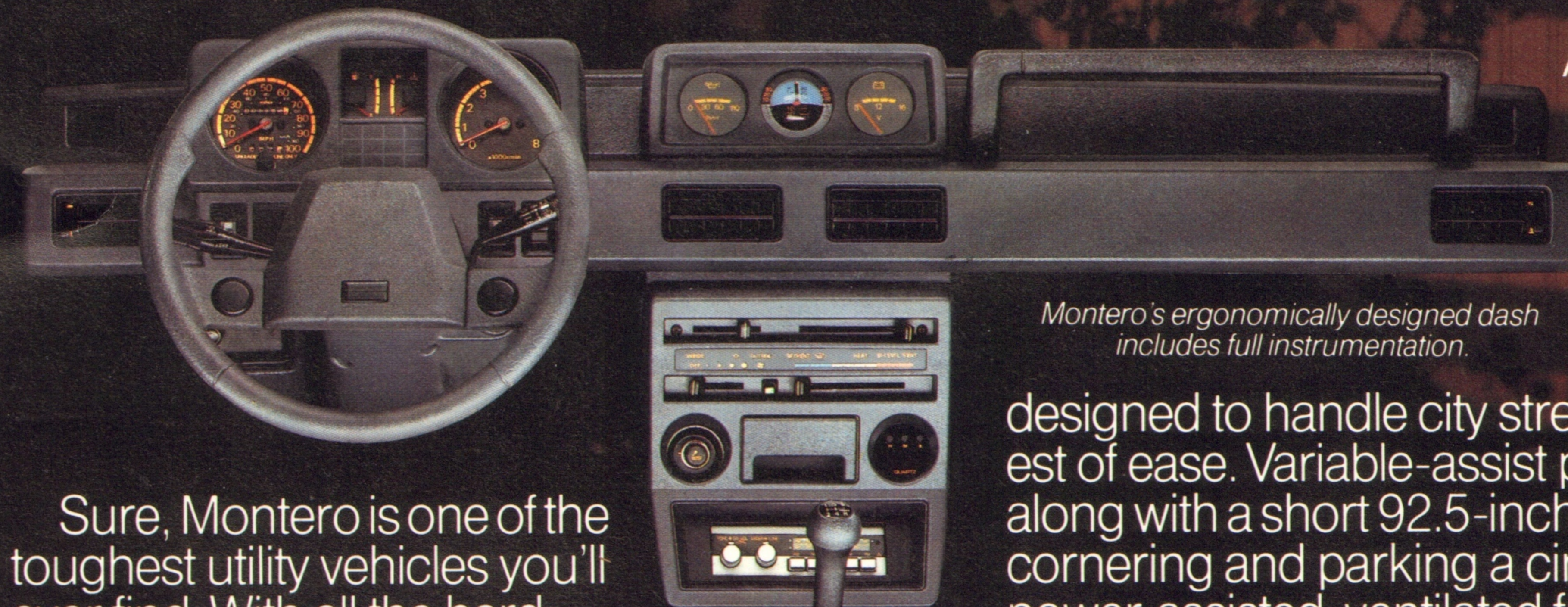
Montero's ergonomically designed dash includes full instrumentation.

Sure, Montero is one of the toughest utility vehicles you'll ever find. With all the hard-working hardware it takes to become one of the strongest off-road machines around.