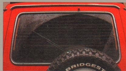
A rear wiper-washer helps you see your way clear through rough weather. It's standard on Montero Sport.