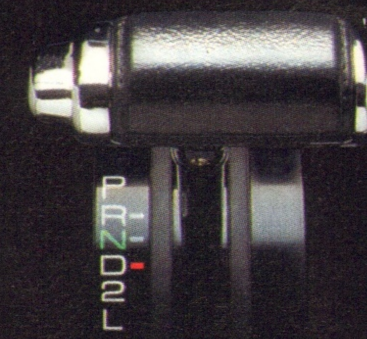
Get the Montero Sport model, and let an optional three-speed automatic transmission handle the shifting for you.

And the Montero comes through with an adjustable driver's seat and tilt steering column. Full instrumentation includes a speedometer, and a tachometer. There's a 4WD indicator. A fine digital quartz clock. A voltmeter. Fuel and temperature gauges. As well as warning lights.