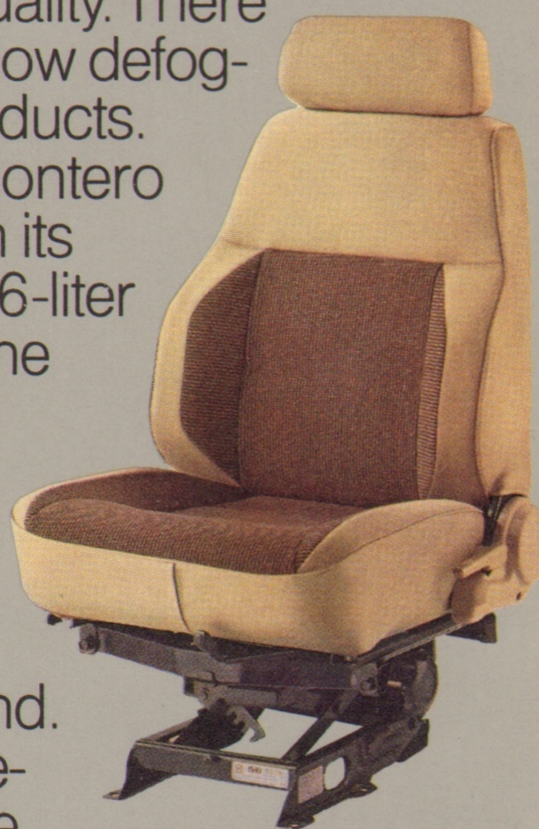
Montero's unique adjustable driver's seat floats on its own shock absorber.

All in all, Montero is a strong-running and easy-riding sports utility vehicle designed by Mitsubishi to help get you and your gear where you're going. Intact. And in style. No matter where you're headed.