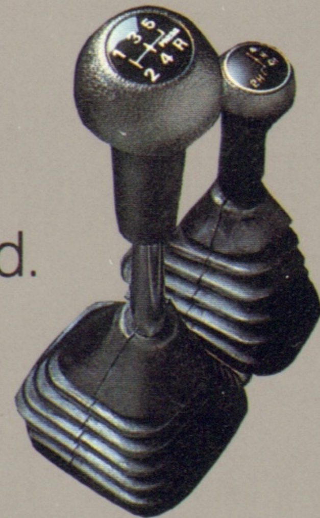
A five-speed manual overdrive transmission and two-speed transfer case make shifting a breeze.

And yet, Montero is as luxurious on the inside as it is tough on the outside. A spacious high roof profile makes for plenty of head and leg room for four adults. And ergonomically designed cloth upholstered seats take the jolts out of a rough ride. In fact, only the Montero has an amazing driver's suspension seat that actually floats on its own adjustable, spring-loaded shock absorber. A passenger front bucket seat folds forward for easy rear access. And the rear bench seat folds down