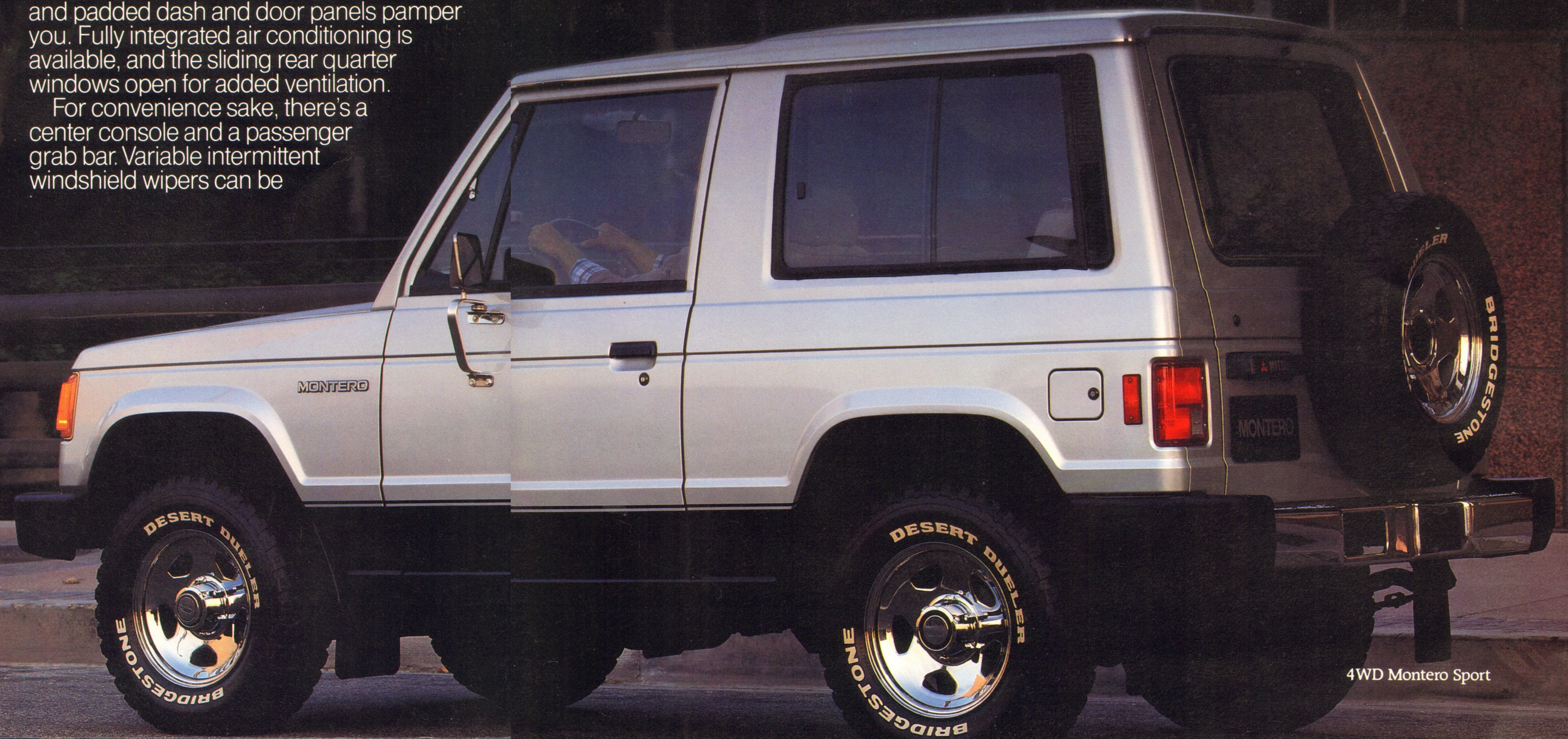
4WD Montero Sport

Town. Country. Or just about anywhere you want to do it.