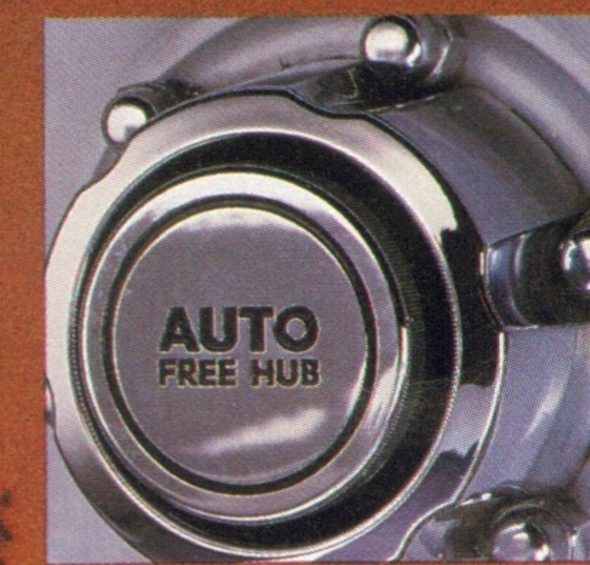
Automatic locking front hubs let you go in and out of four-wheel drive without leaving your seat.

It's this kind of ingenuity that you'll find throughout the Montero. From a six-cross member frame. To its independent front suspension system.