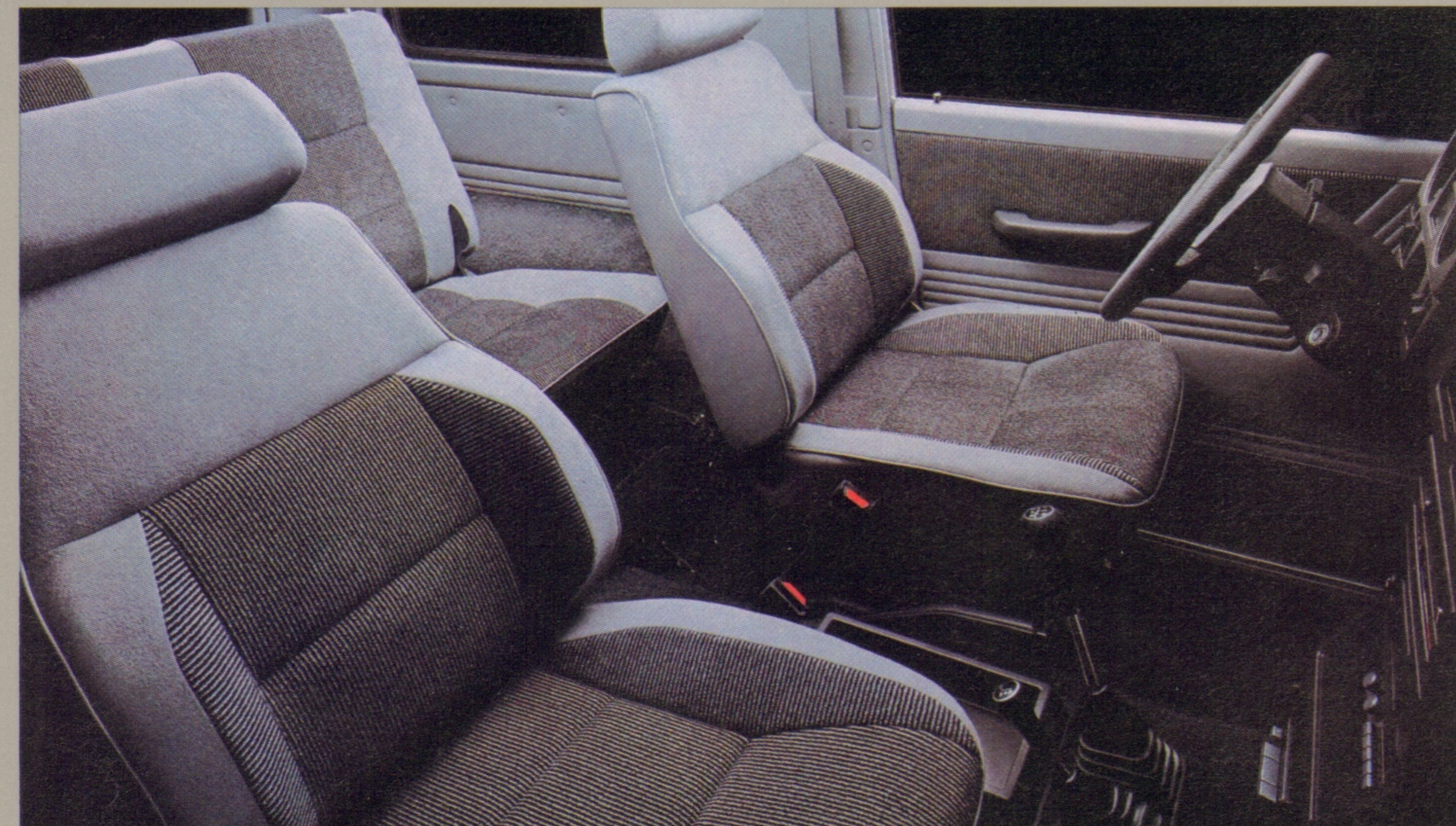
Montero has plenty of comfortable seating space for four adults.