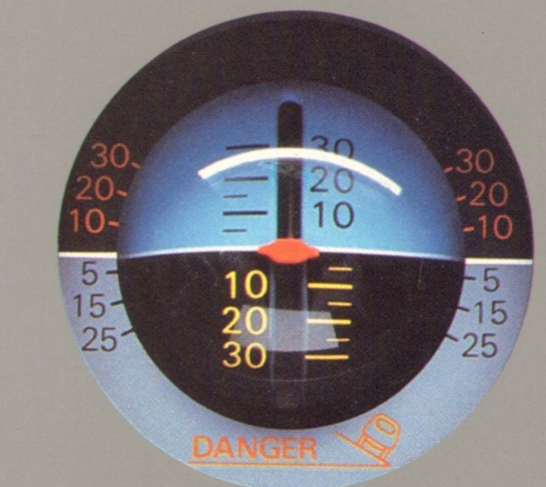
The standard Montero inclinometer keeps track of the angles from side to side and front to rear.