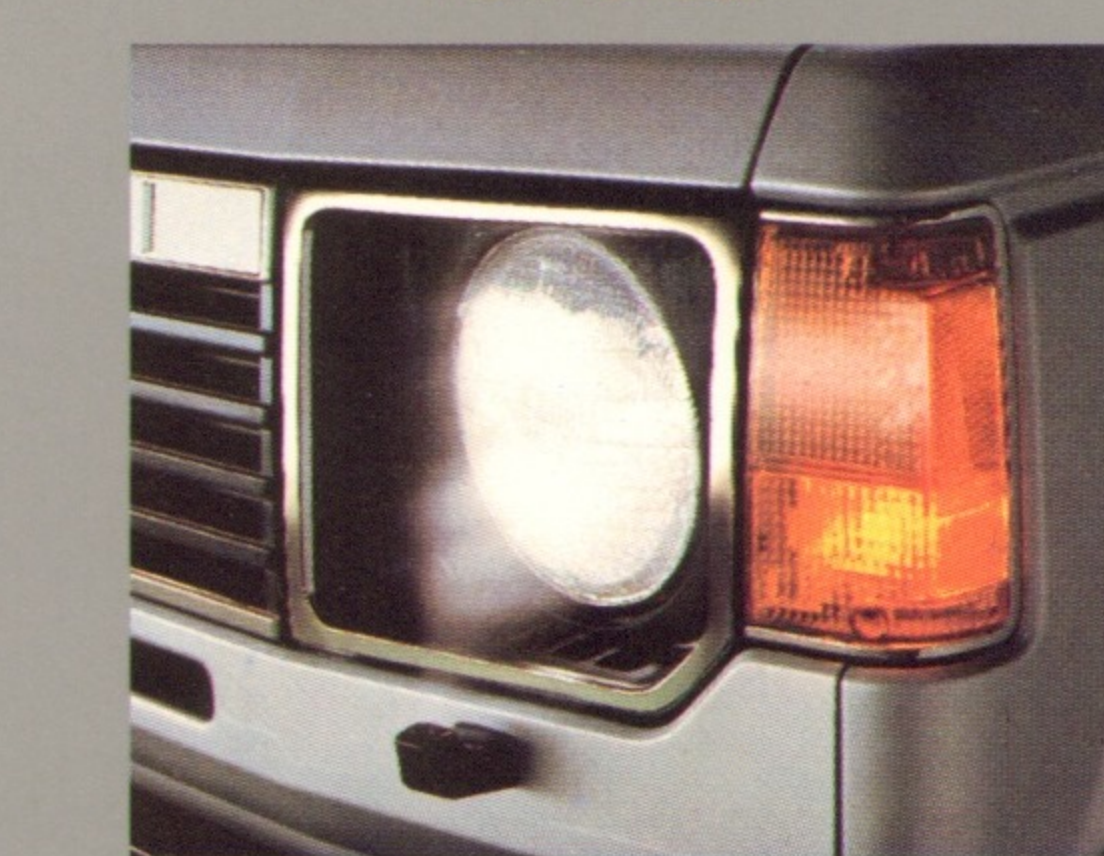
High-pressure spray cleans the headlights on the Montero Sport.