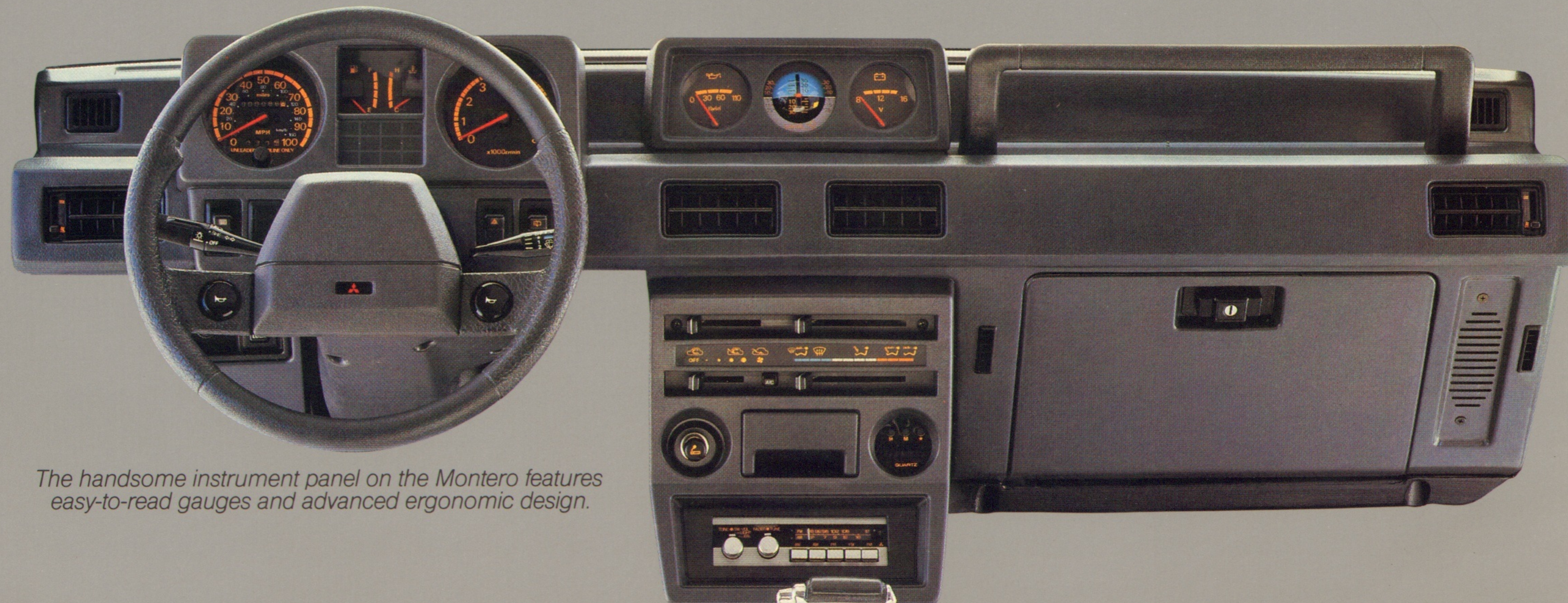
The handsome instrument panel on the Montero features easy-to-read gauges and advanced ergonomic design.

So you can utilize the 1986 Mitsubishi Montero to take you right where you want to be.