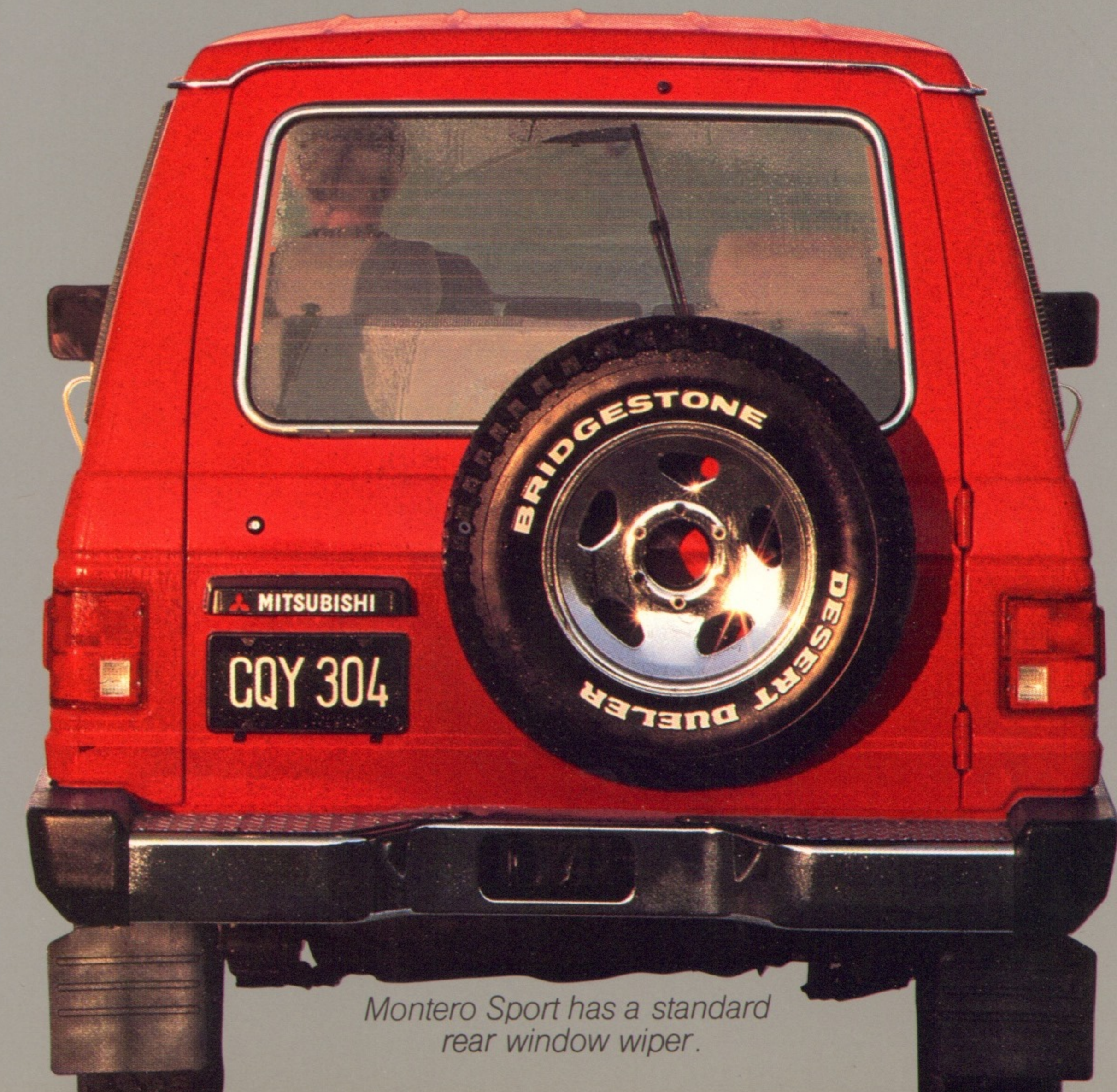
Montero Sport has a standard rear window wiper.