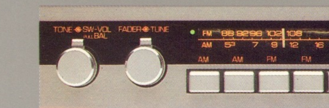
A Mitsubishi AM/FM cassette stereo system with four speakers offers high-fidelity fun. It's standard on the Montero Sport.