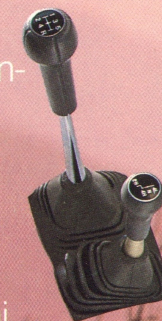
The five-speed manual overdrive transmission and two-speed transfer case work together.