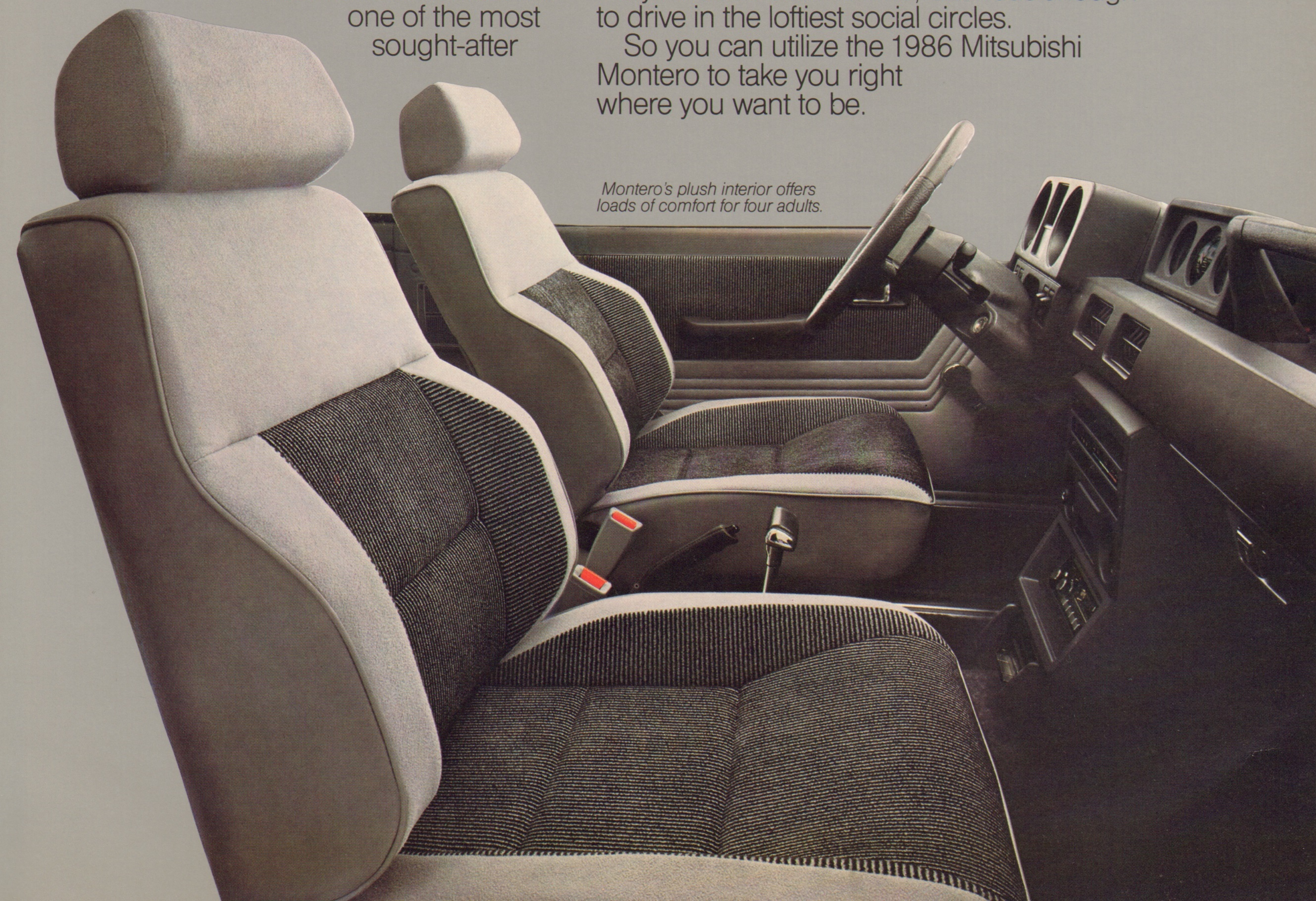
Montero's plush interior offers loads of comfort for four adults.