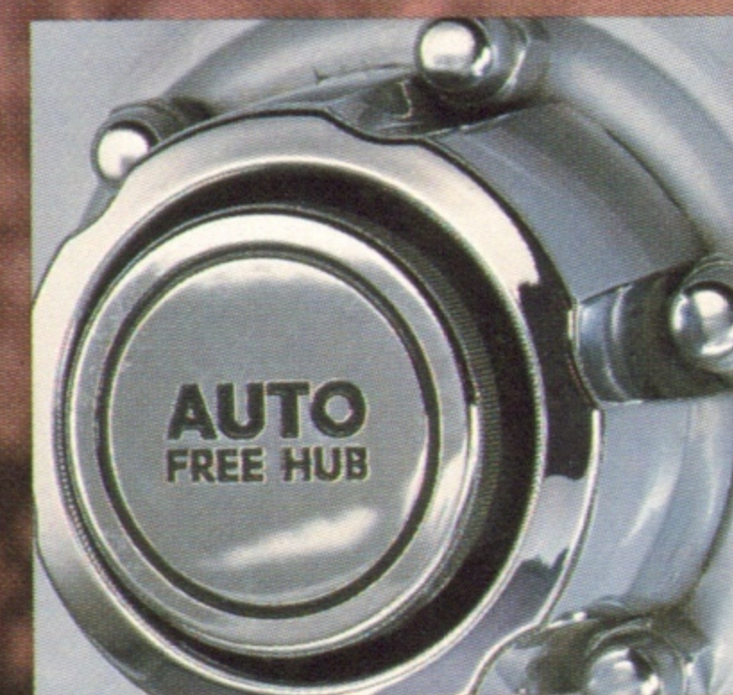
Auto-locking front hubs let you stay inside when you go off-road.

The Montero is built from bottom to top for the gnarliest terrain. A front differential placed high in the frame and an integrated two-speed transfer case provide outstanding ground clearance.