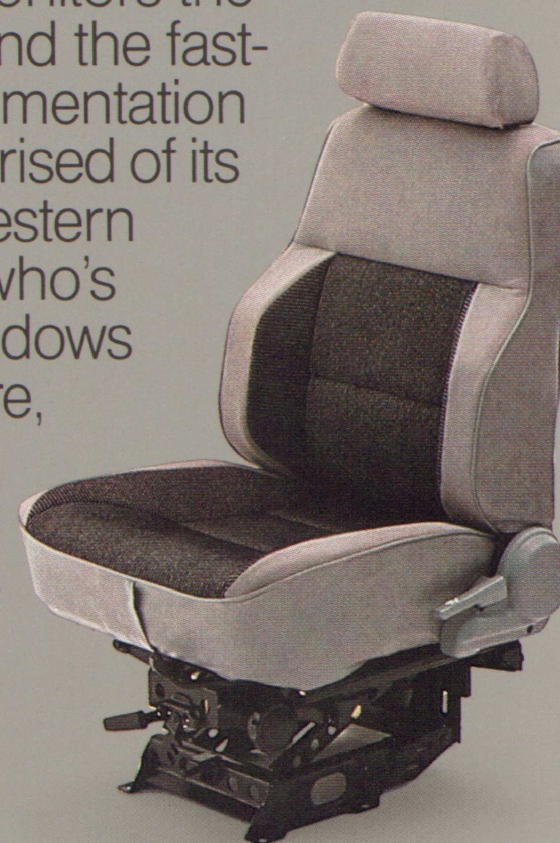
The innovative Montero driver's seat has its very own suspension system that you can adjust.

Take up a new Sport. If the features list still just isn't long enough for you, add the Sport Option Group. The Montero Sport comes with rich, two-tone paint. A high-pressure spray washer helps