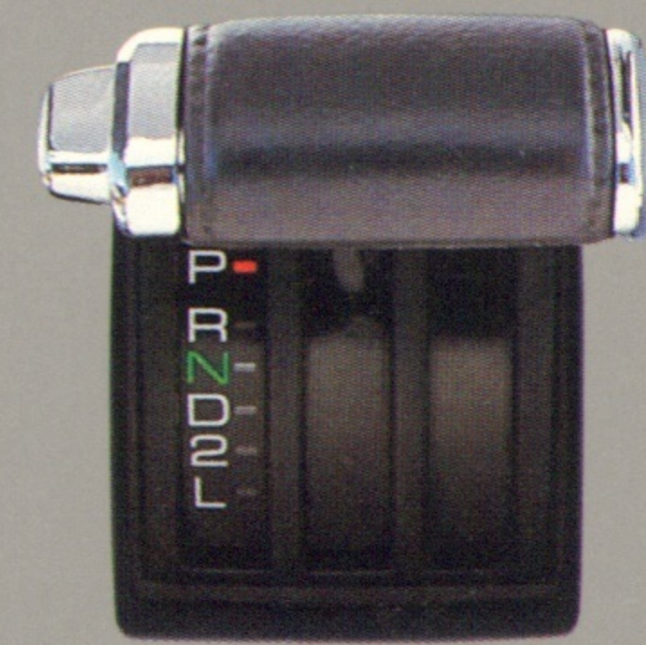
A three-speed automatic transmission available on Montero Sport lets you forget about shifting.

No matter where you want to drive your Montero, it's loaded with features that make driving fun. Like power-assisted steering. A