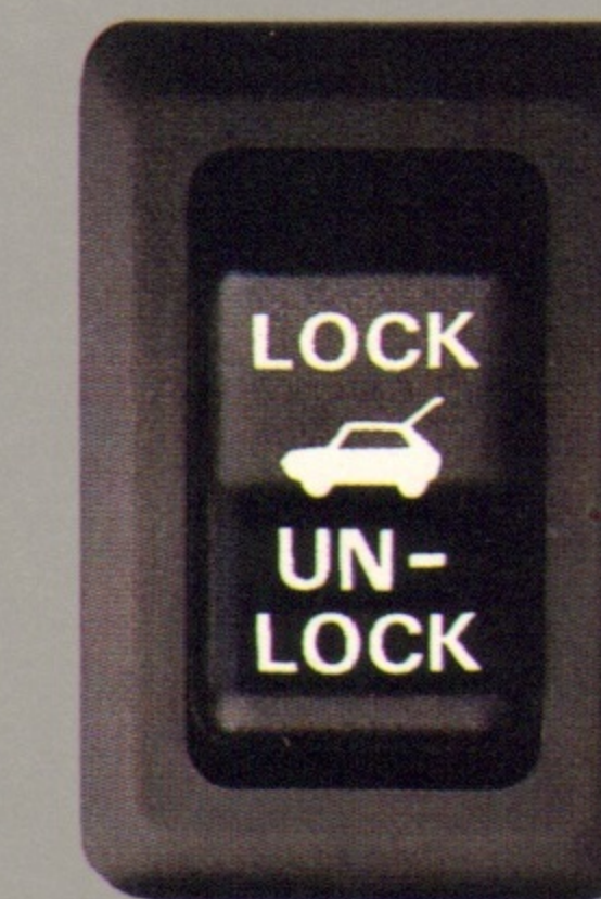
You can lock and unlock the rear door right from the driver's seat with this dash-mounted switch.

Features that set the standard. Whether you choose the Montero or Montero Sport, you get the advanced Mitsubishi engineering that makes this machine one of the most sought-after